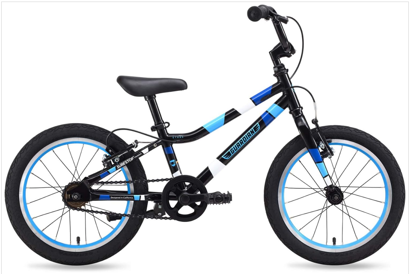
Figure 1: Guardian Ethos Kids Bike (Black/Blue)

The Guardian Ethos line of kids' bikes is engineered with a primary focus on safety and ease of use for children. These bikes incorporate advanced features designed to prevent common accidents and make the learning-to-ride process smoother and more confident. Each bike undergoes a comprehensive 34-point setup and safety check before shipping, ensuring a consistently safe product for every customer.