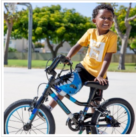
Figure 3: SureStop Single Brake Lever for enhanced safety.