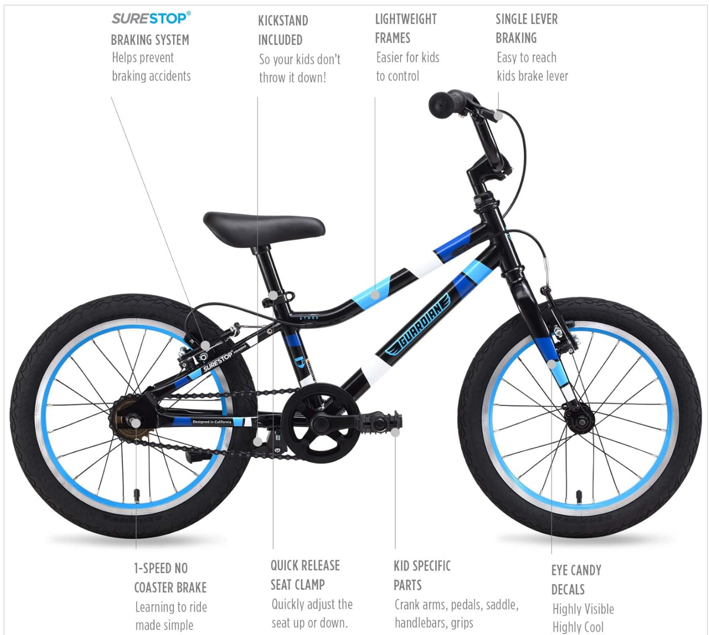
Figure 2: Guardian Ethos Key Features Overview