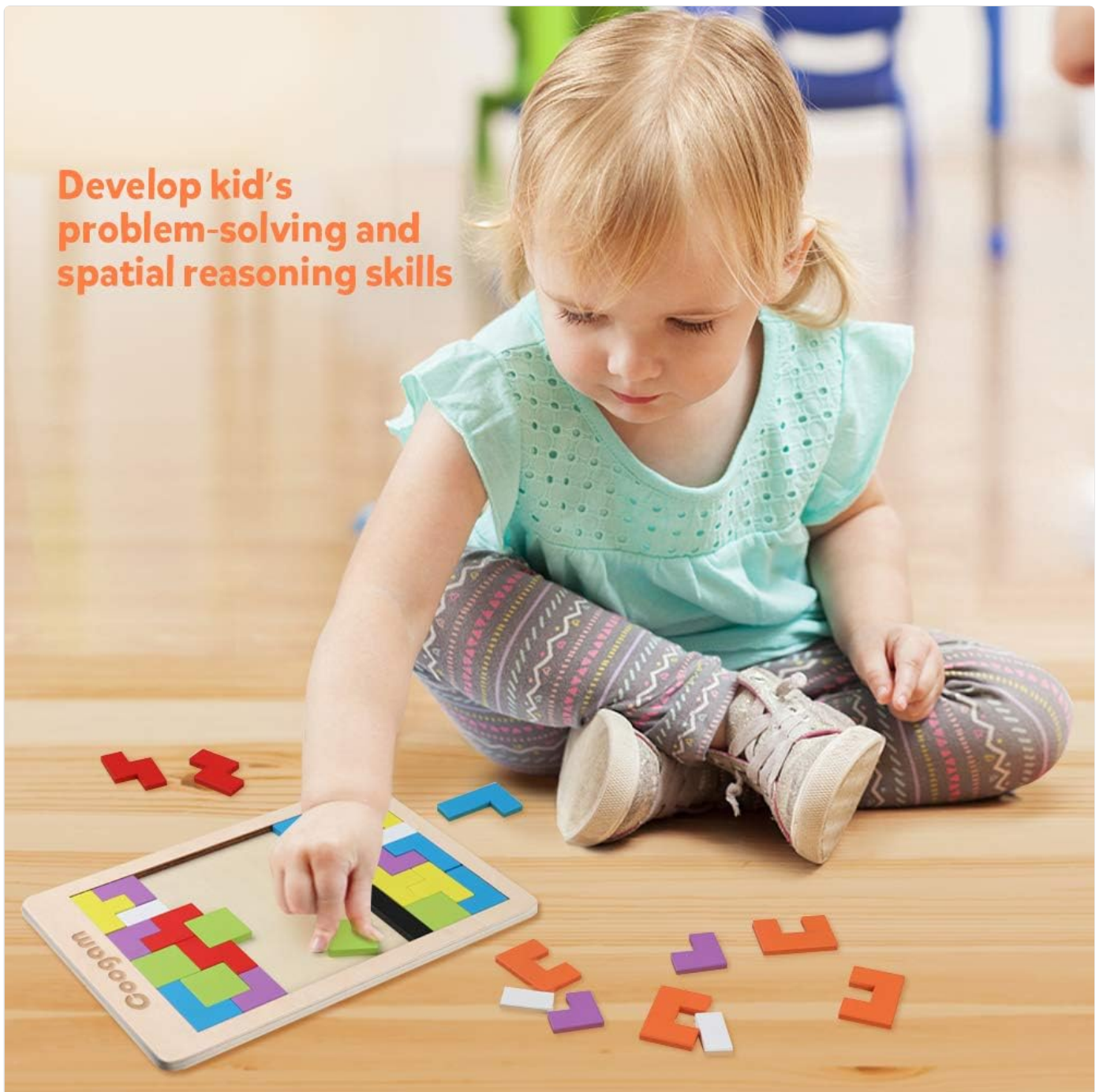
Figure 3: The puzzle helps develop problem-solving and spatial reasoning skills.

Develop kid's problem-solving and spatial reasoning skills