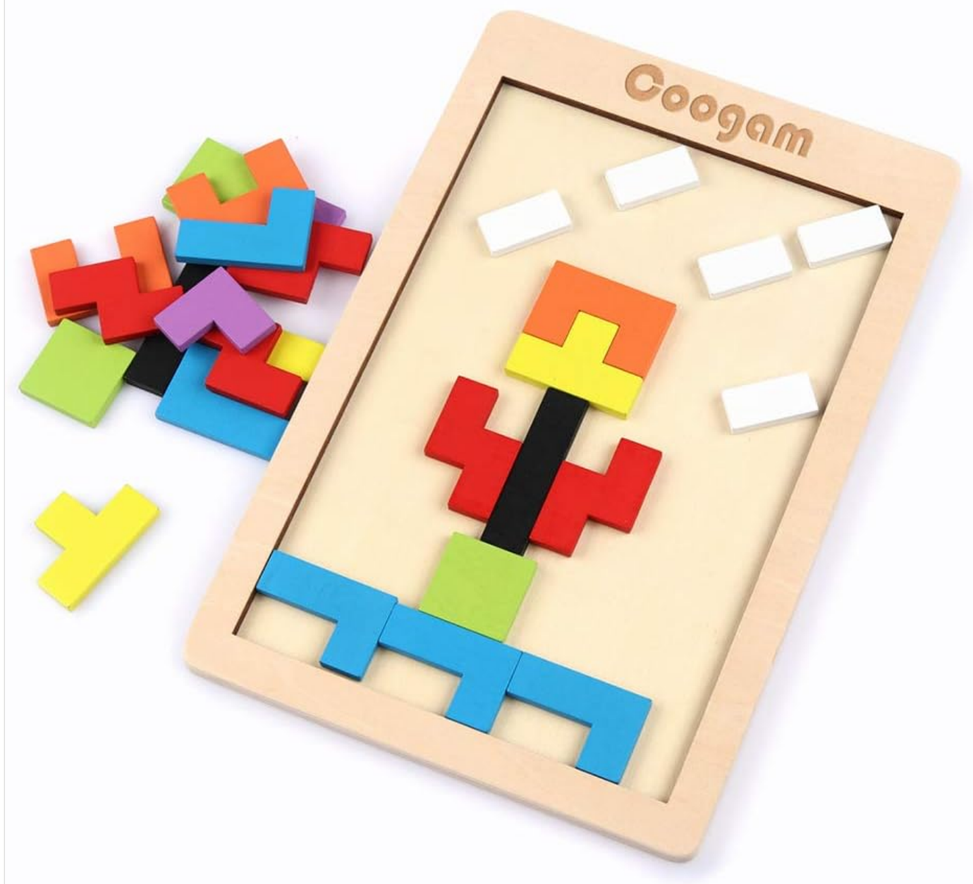
Figure 6: Product dimensions for the puzzle board.