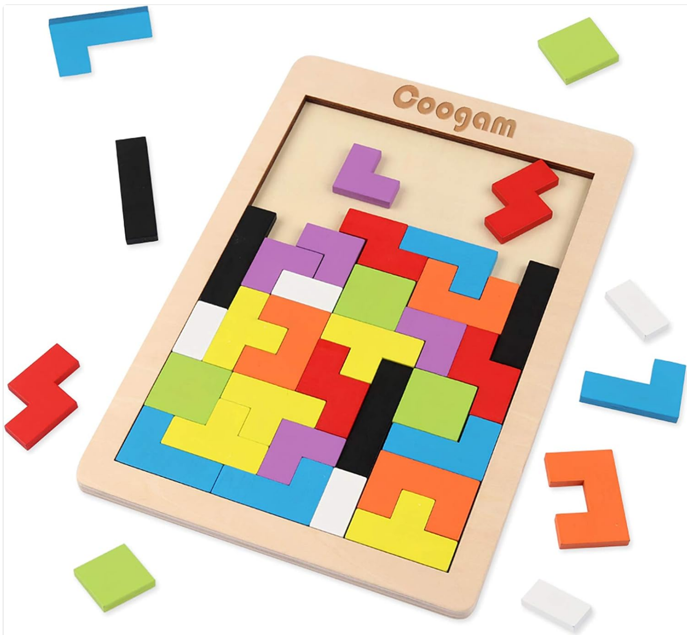
Figure 1: The Coogam Wooden Blocks Puzzle fully assembled in its board.