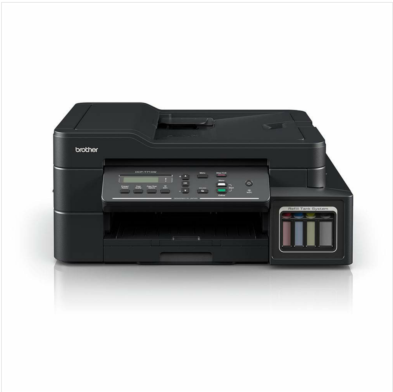
Figure 1.1: Front view of the Brother DCP-T710W printer, showcasing its compact design and integrated ink tanks.