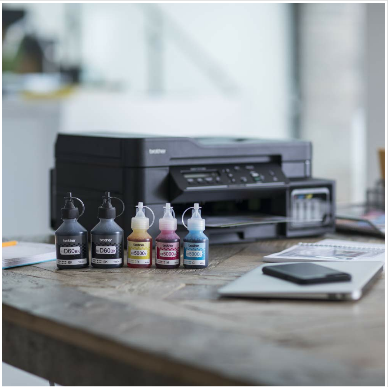
Figure 3.2: Genuine Brother ink bottles (Black, Yellow, Magenta, Cyan) displayed on a wooden surface, with the printer visible in the background.