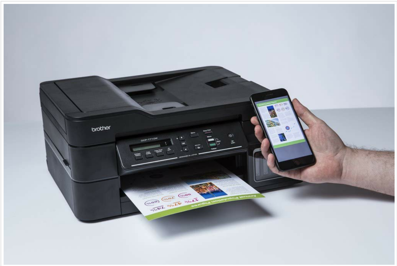
Figure 3.3: A person holding a smartphone displaying a document, with the Brother printer actively printing, illustrating wireless printing capabilities.