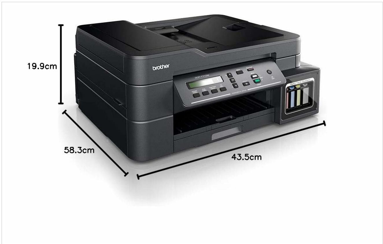
Figure 7.1: Diagram showing the dimensions of the Brother DCP-T710W printer: 58.3 cm (Depth), 43.5 cm (Width), and 19.9 cm (Height).