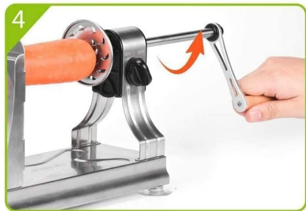
4 Caution: Never contrarotate the crank, otherwise the screw will come off

Examples of various vegetables and fruits that can be spiralized with ease.