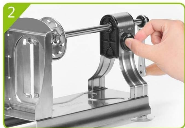
2 On/Off switch to control the working status