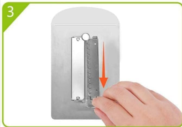
3 Chose the desired replacement blade