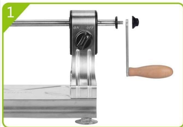
1 install the crank by disassembling the screw