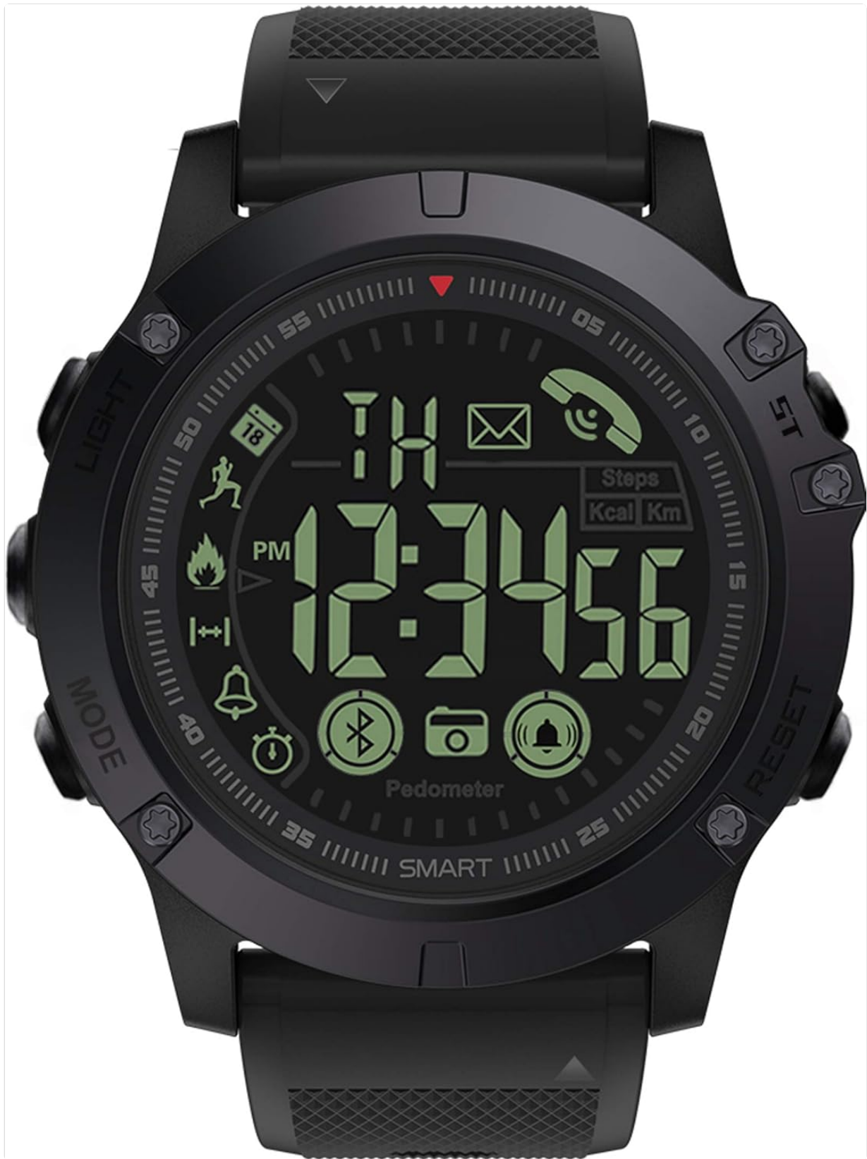
Figure 1: findtime Military Tactical Digital Sports Watch (Front View)