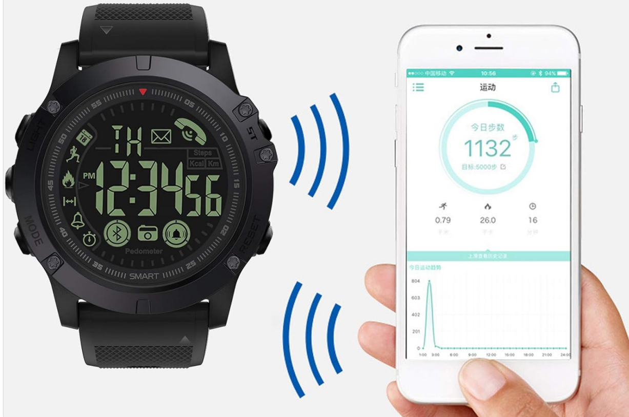
Figure 10: Bluetooth Compatibility with Smartphone App.

SCAN THE QR CODE TO DOWNLOAD AND INSTALL APK BLUETOOTH NOTIFICATION