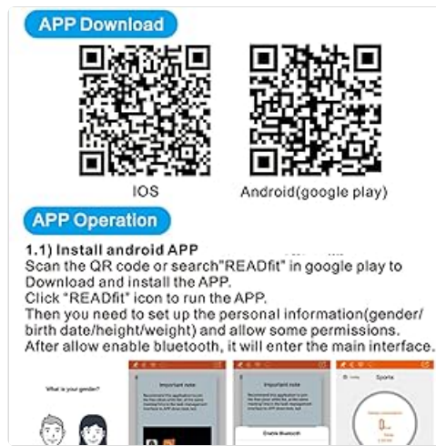
Figure 3: QR Codes for 'READfit' App Download (iOS and Android).