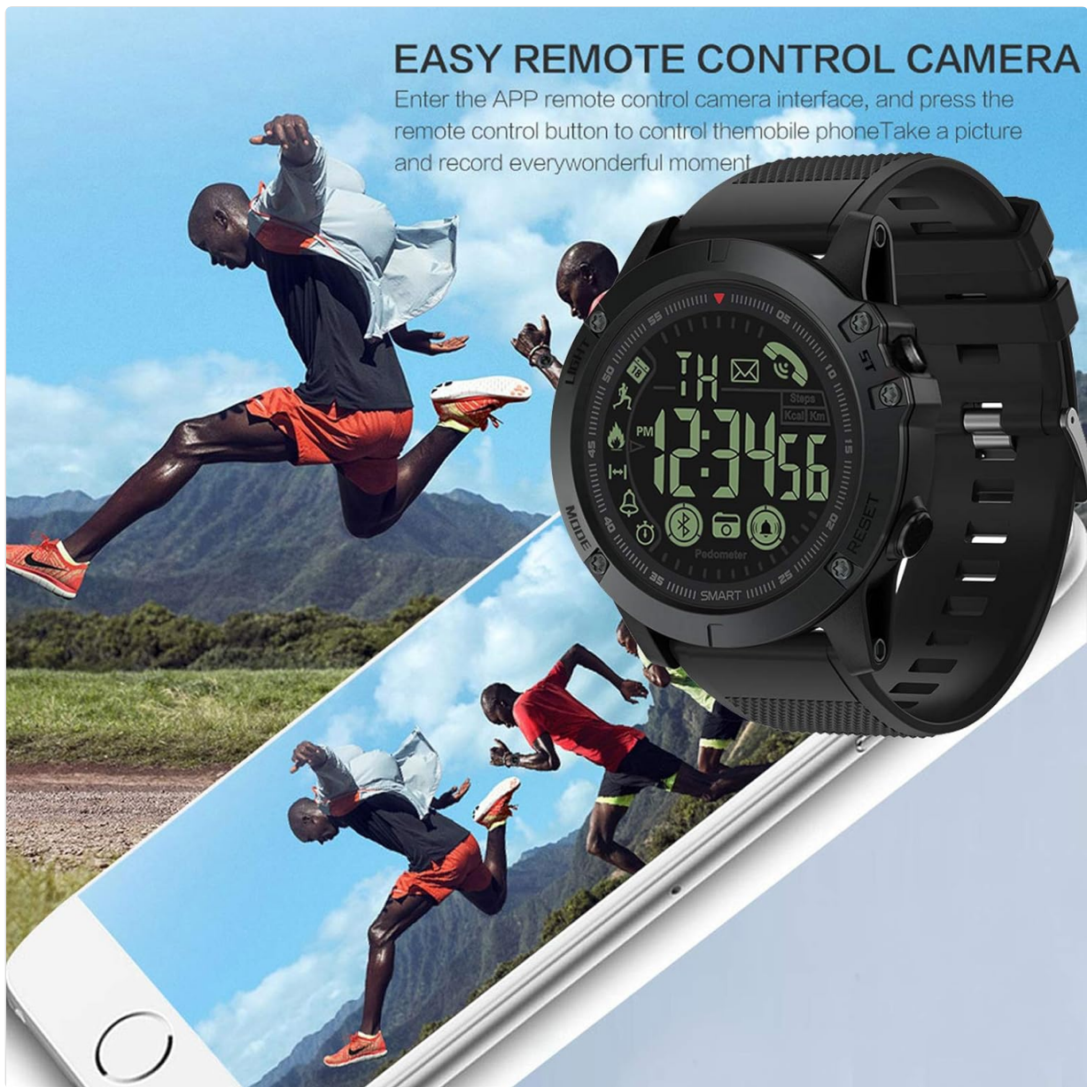
Figure 7: Remote Camera Control Functionality.