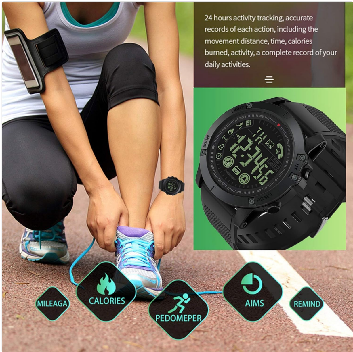
Figure 8: Fitness Tracking Features including Pedometer, Calorie, and Distance Counter.