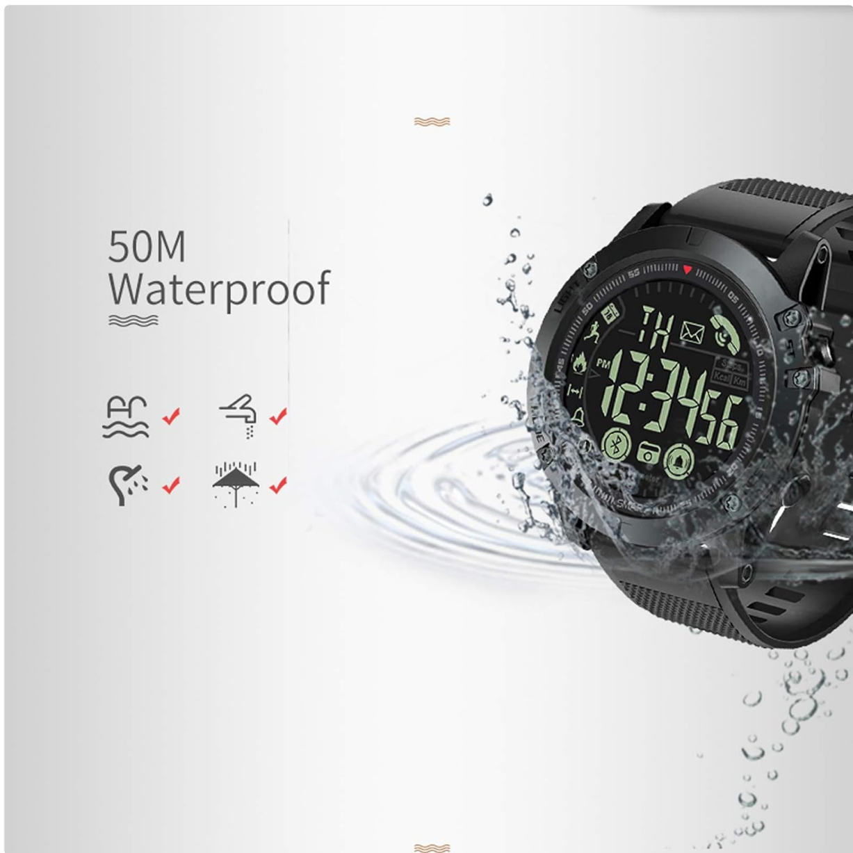
Figure 9: Water Resistance up to 50 meters (5ATM).