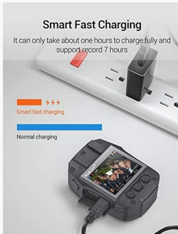
Figure 6: Smart Fast Charging

The device supports smart fast charging, allowing for a full charge in approximately one hour, providing up to 7 hours of continuous recording time.