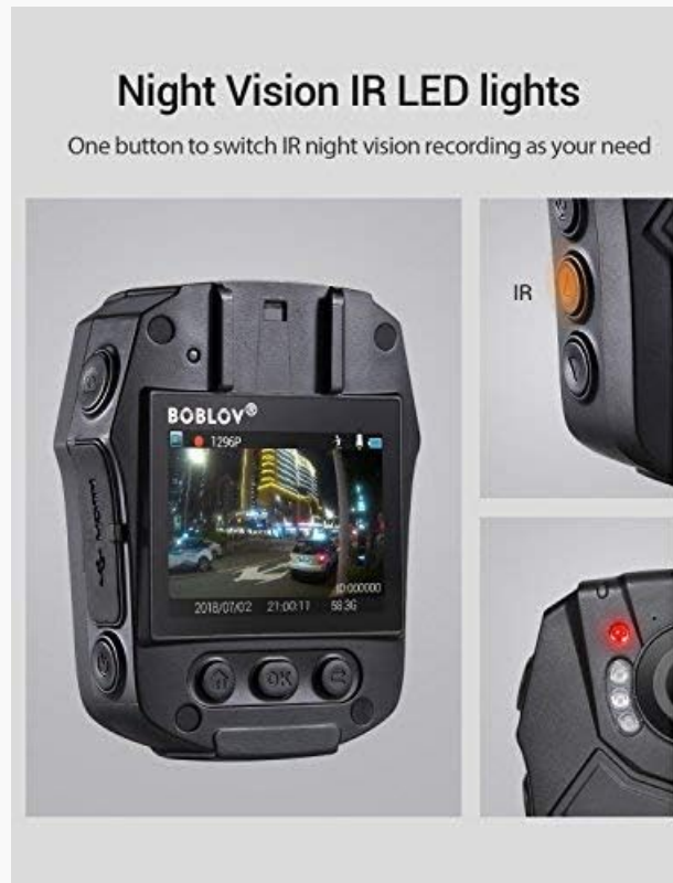
Figure 4: Night Vision IR LED Lights

Integrated IR LED lights enable clear recording in low-light or complete darkness. The night vision mode can be manually activated for optimal visibility.