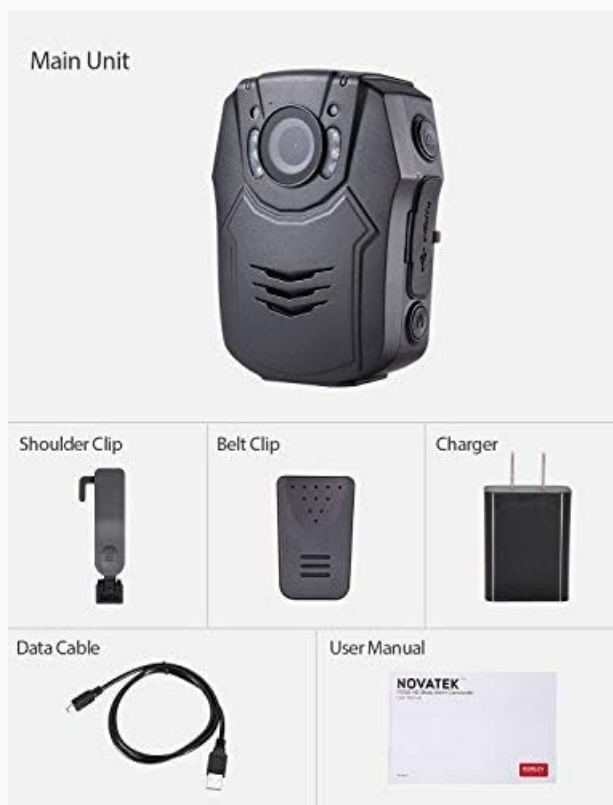
Figure 1: Included Accessories

Verify that all items listed below are included in your package: