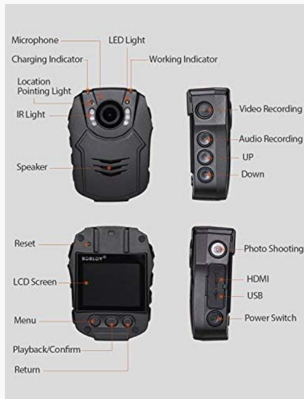
Figure 8: Product Structure and Controls

Familiarize yourself with the camera's layout and button functions as detailed in the diagram above for efficient operation.