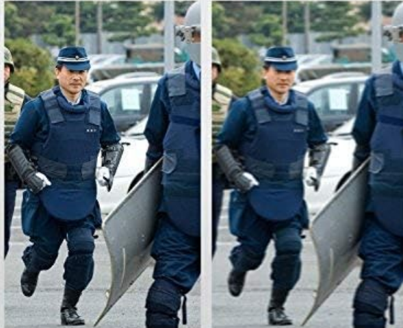
Figure 2: 1296P HD Resolution

Novatek 96658 chip embraces advanced Cortex ARM image processor, the video is more clear and delicate