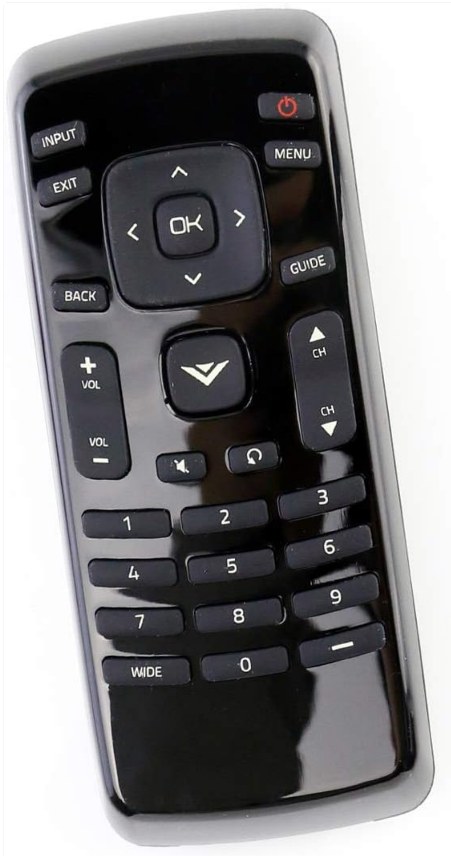
Figure 1: Front view of the XRT020 Remote Control.