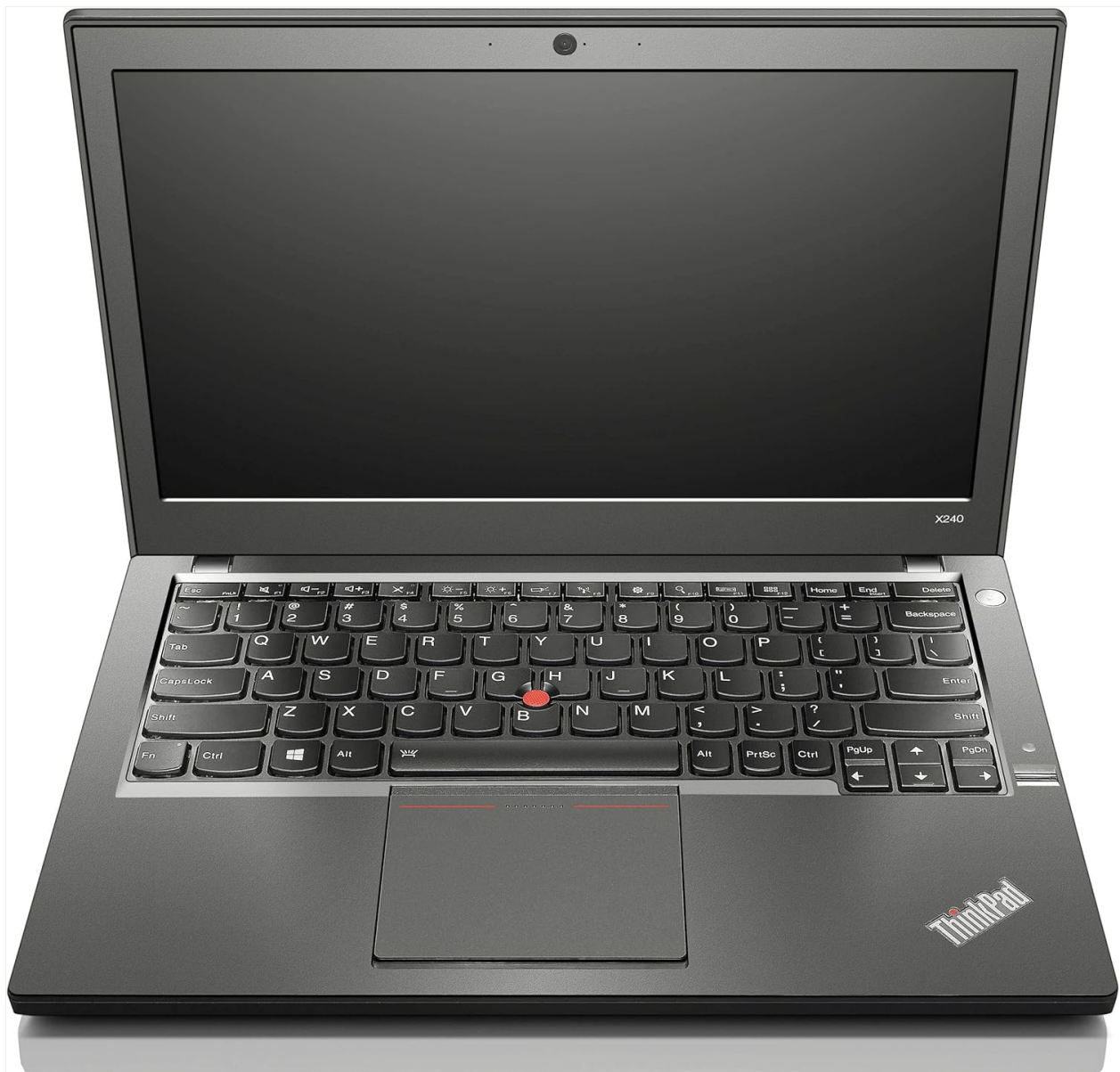
Figure 3.1: Top-down view of the ThinkPad X240 keyboard, showing the TrackPoint and touchpad.