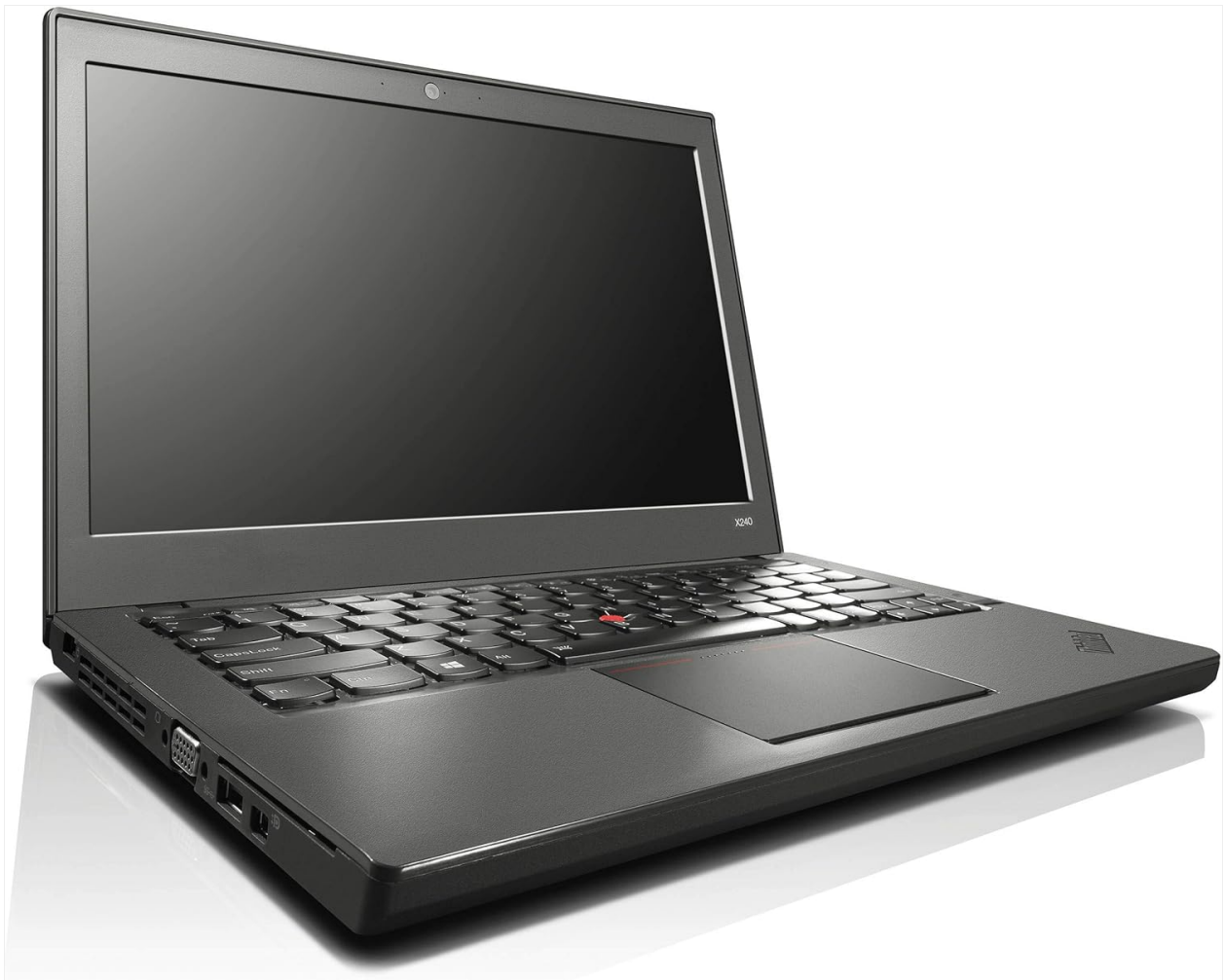
Figure 2.1: Side view of the ThinkPad X240, illustrating the location of various ports including the power input.