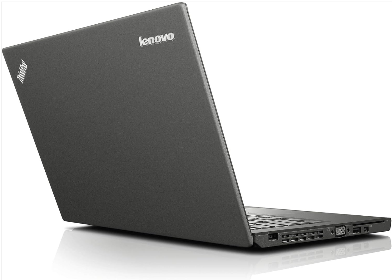
Figure 3.2: Rear view of the ThinkPad X240, highlighting the available connectivity ports.