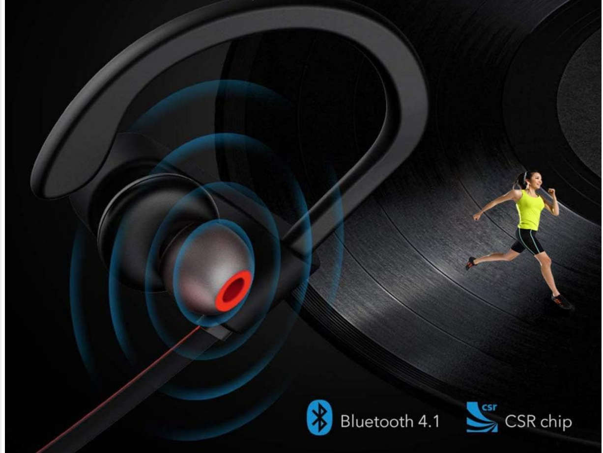
Image: Close-up of the BassPal TonePro U14 earphone highlighting its high-fidelity sound capabilities with rock-solid bass and crisp treble.

Wireless workout headphones with rock-solid bass and crisp treble