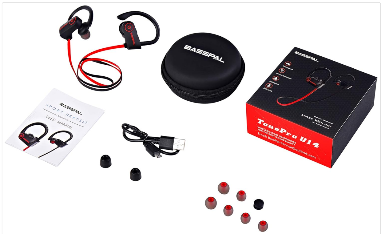
Image: Contents of the BassPal TonePro U14 package, including earphones, charging cable, ear tips, carrying case, and user manual.