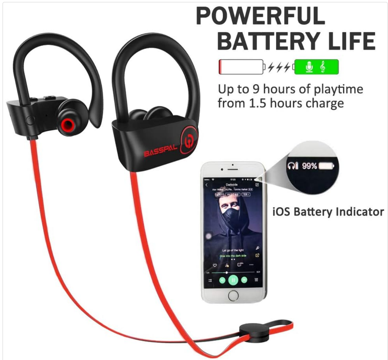
Image: BassPal TonePro U14 earphones with a visual representation of their powerful battery life and iOS battery indicator feature.

Before first use, fully charge the earphones. Connect the provided USB charging cable to the USB charging port on the earphones and to a standard 5V/1A USB power source. The LED indicator will show charging status and turn off or change color when fully charged. A full charge takes approximately 1.5 hours and provides up to 9 hours of playback.