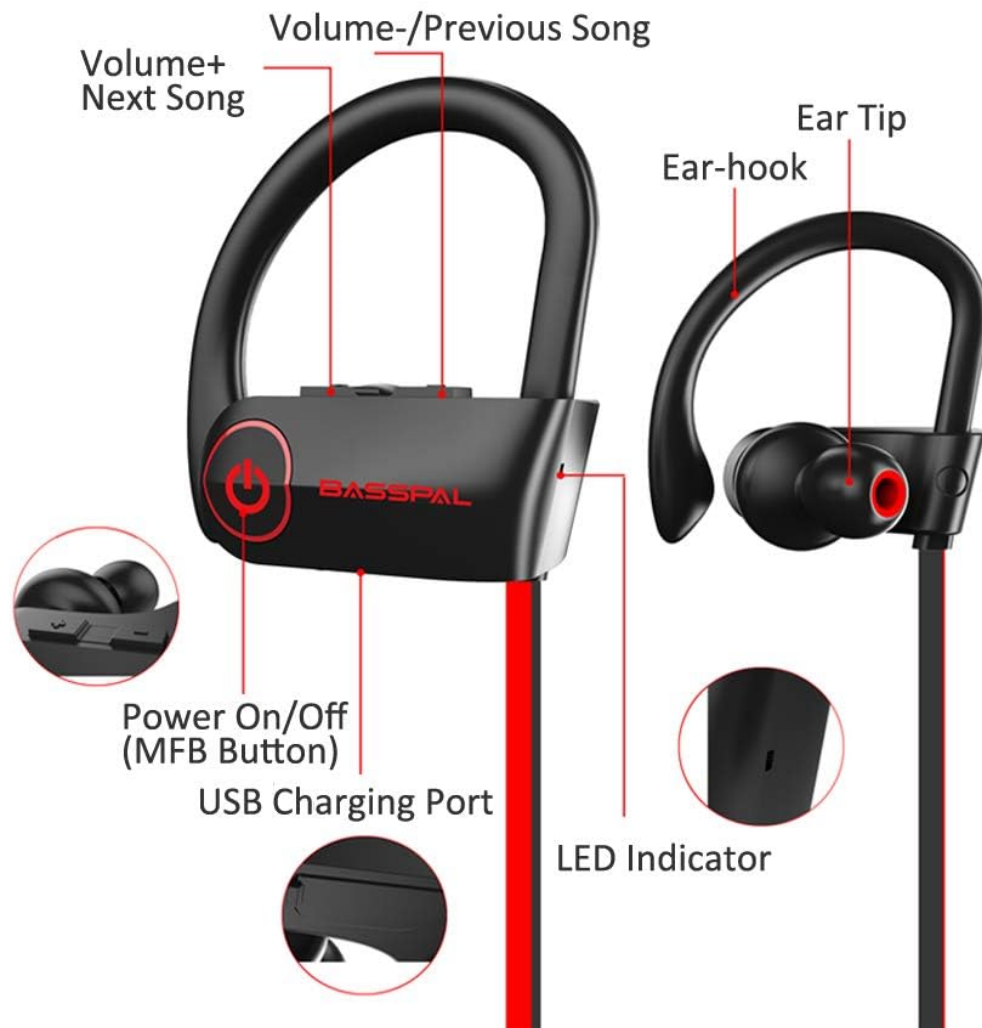
Image: Diagram illustrating the various components and controls of the BassPal TonePro U14 earphones, including volume buttons, MFB button, USB charging port, LED indicator, ear tip, and ear-hook.