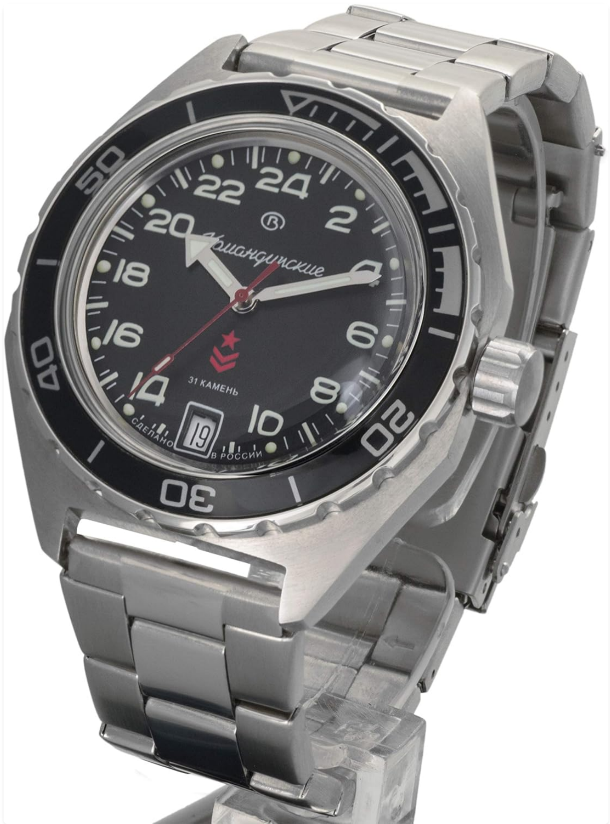
The Vostok Komandirskie Automatic Wristwatch, Model 020/650, featuring a black dial, silver case, and metal bracelet.