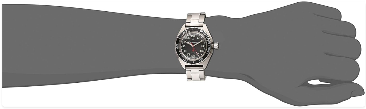
The Vostok Komandirskie watch as it appears on a wrist, highlighting its proportions.