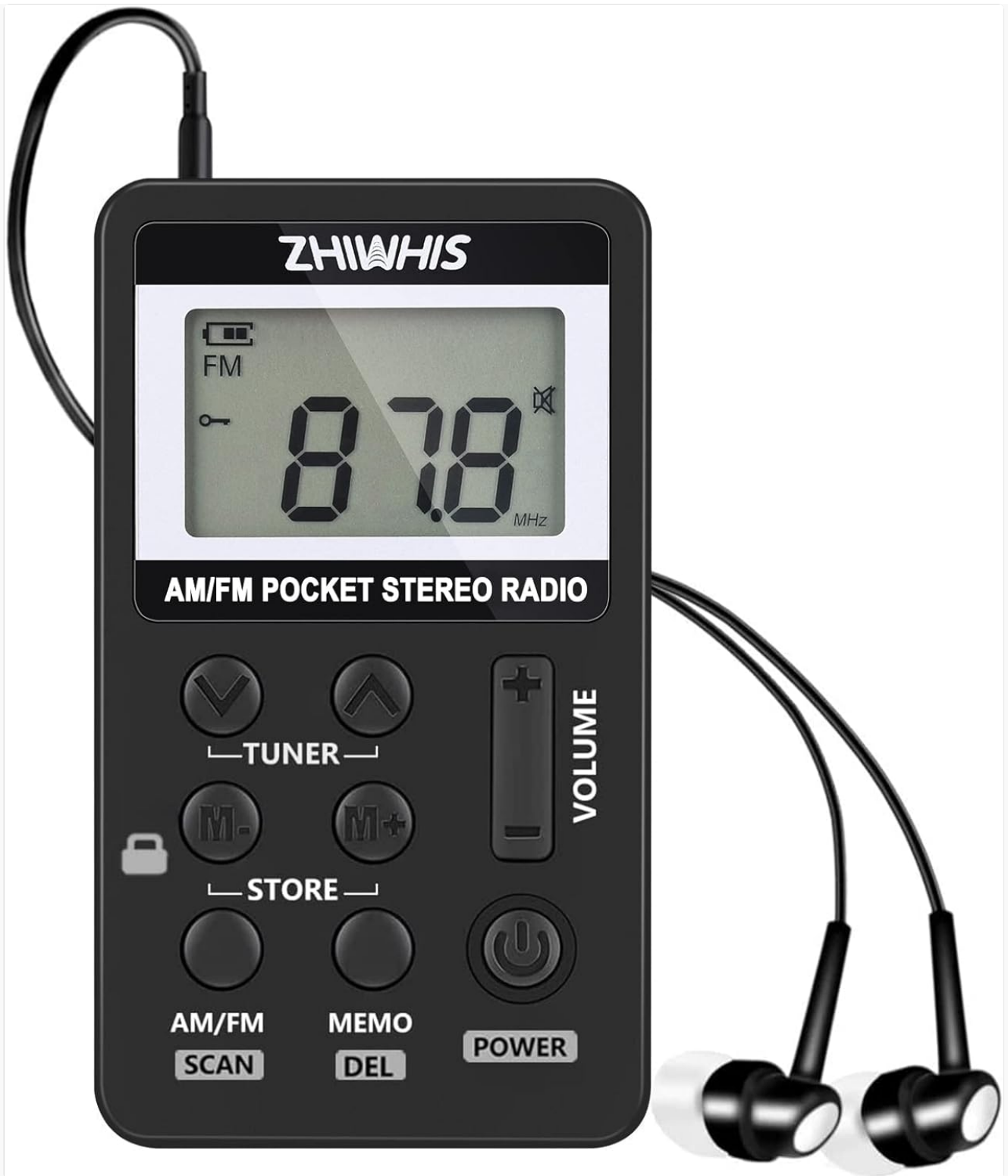
Image: The ZHIWHIS Portable AM/FM DSP Digital Radio, a compact black unit with an LCD display and control buttons, shown with its included stereo earphones.