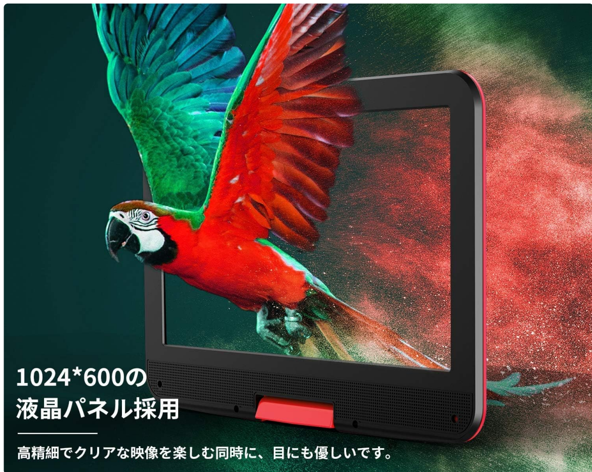
Image: The DBPOWER MK101 Portable DVD Player with its screen open, displaying a vibrant, colorful image.

The DBPOWER MK101 is a versatile portable DVD player designed for entertainment on the go. It features a 10.5-inch LCD screen with 270-degree rotation, region-free playback, and support for various media formats via DVD, SD card, and USB.