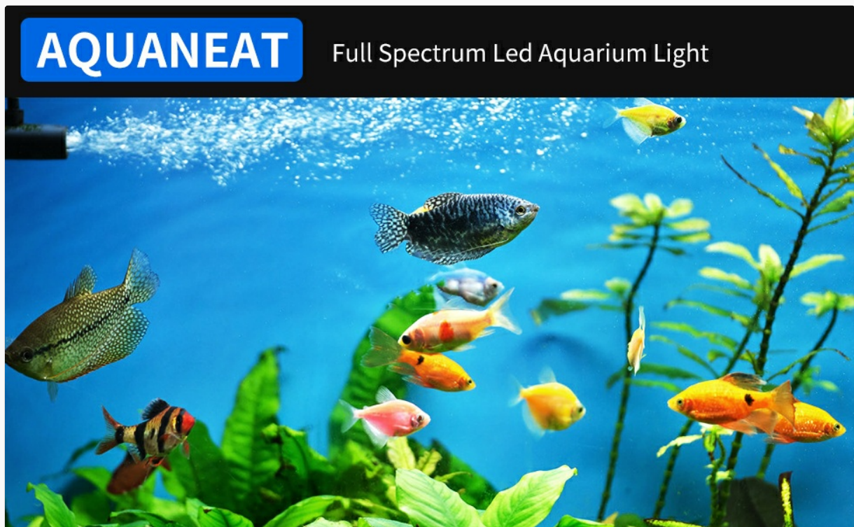
Image 1.1: Overview of the AQUANEAT LED Aquarium Light, highlighting its full spectrum LED configuration including white, blue, pink, and green lights.

The AQUANEAT LED Aquarium Light is designed to provide full spectrum illumination for freshwater fish tanks ranging from 11 to 14 inches in length. It features a combination of white, blue, pink, and green LEDs to support the healthy growth of fish and plants.