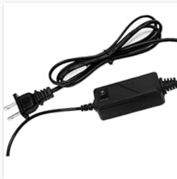
Image 3.1: The simple on/off switch integrated into the power cable for easy control.