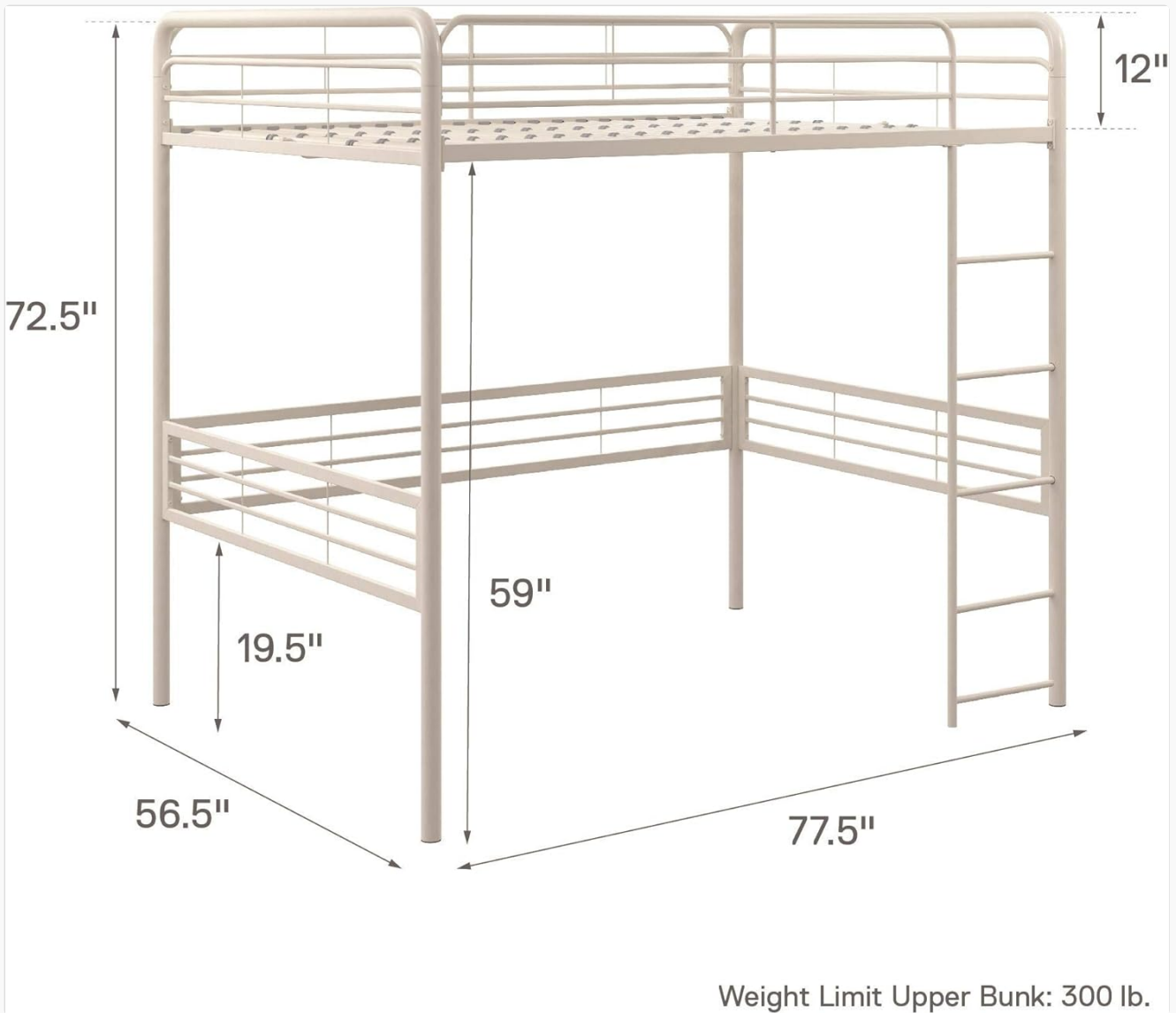
Image: A diagram illustrating the key dimensions of the loft bed, including length, width, height, and under-bed clearance.