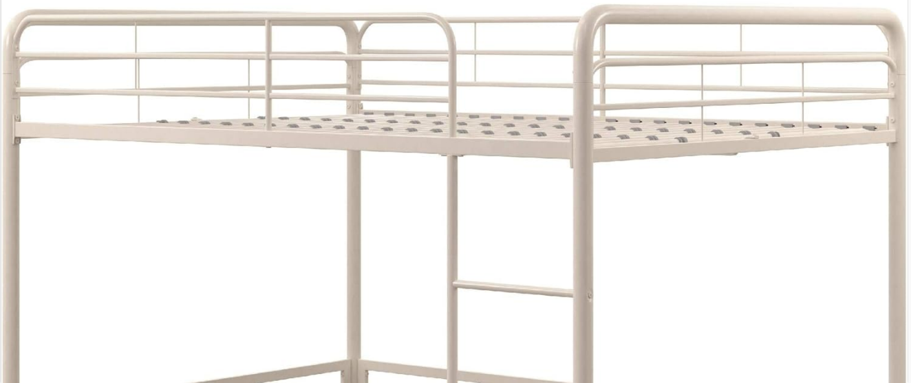
Image: Graphic highlighting the child-friendly design and full-length guardrails for enhanced safety.