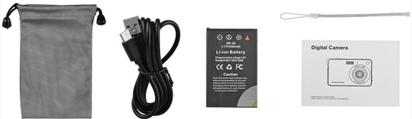
Image: Contents of the camera package, showing the camera, battery, USB-C cable, wrist strap, carry bag, and user manual.