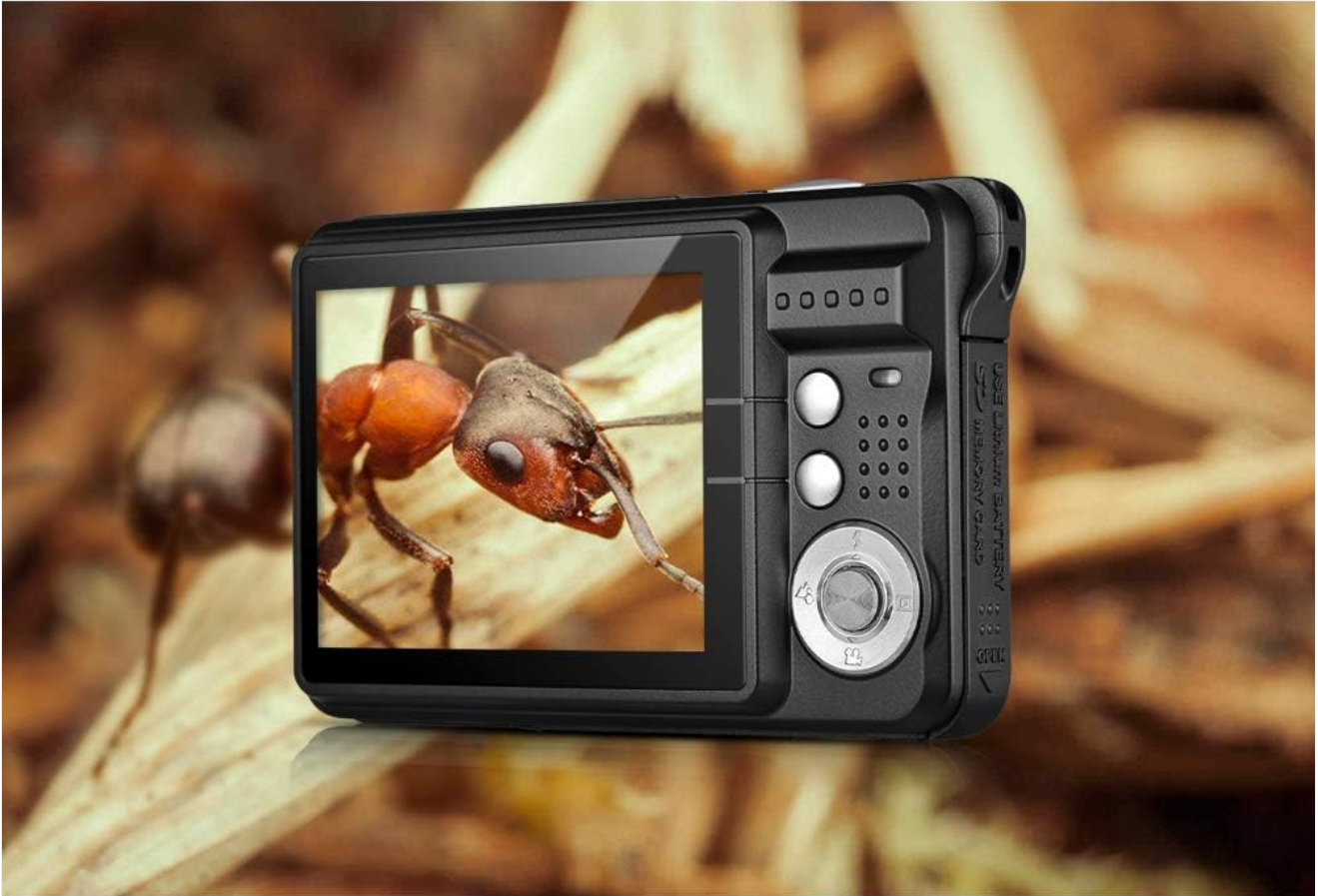
Image: A close-up photograph of an ant, demonstrating the camera's Macro Mode capability for detailed shots of small subjects.