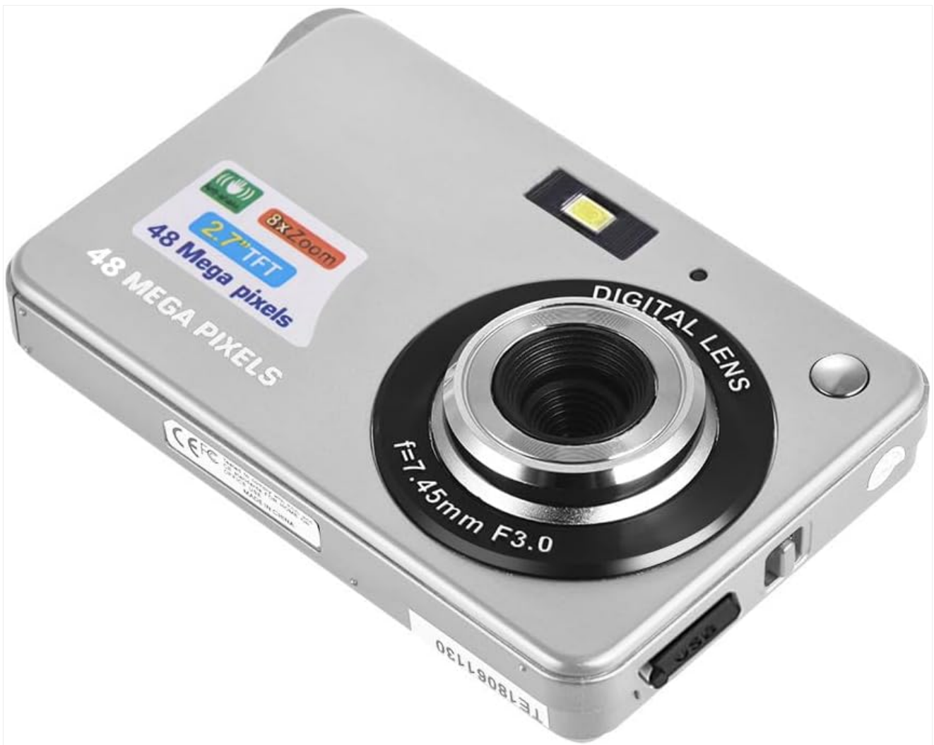
Image: Front view of the Andoer D11773S camera. Key features visible include the digital lens, built-in flash, and the 2.7" TFT display and 48 Mega pixels indicators.