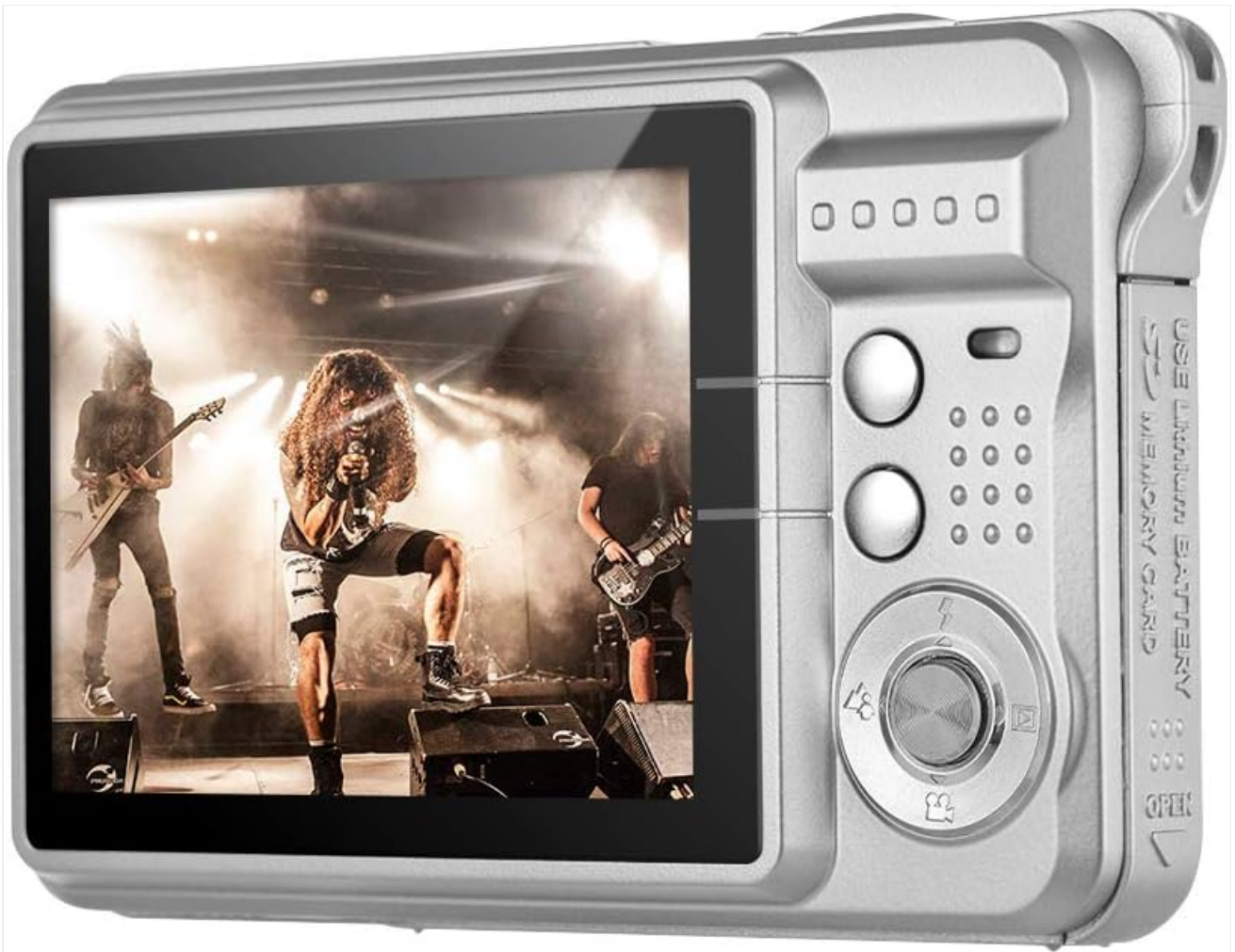
Image: Rear view of the Andoer D11773S camera, displaying the 2.7-inch LCD screen and various control buttons for navigation and settings.