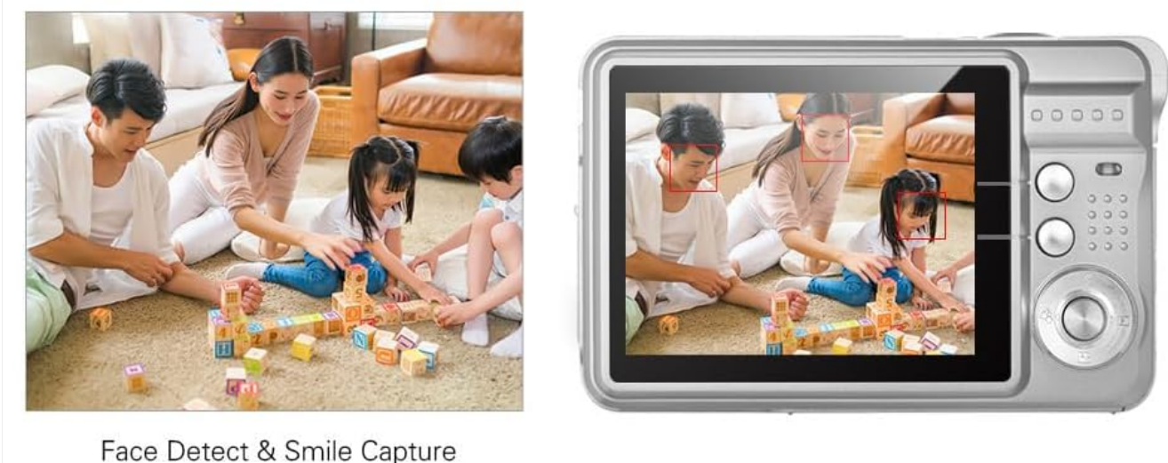
Image: Demonstrations of the camera's Anti-shake function (reducing blur from movement) and Face Detect & Smile Capture (identifying faces and automatically taking a photo when a smile is detected).