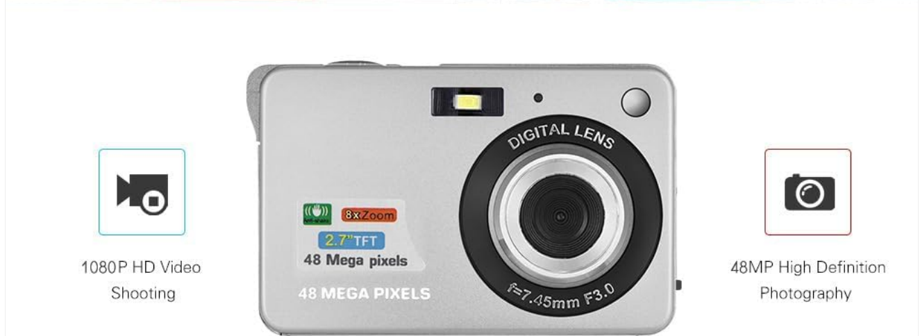
Image: Visual representation of the camera's capabilities, showing a 48MP photo example and a 1080P video example.