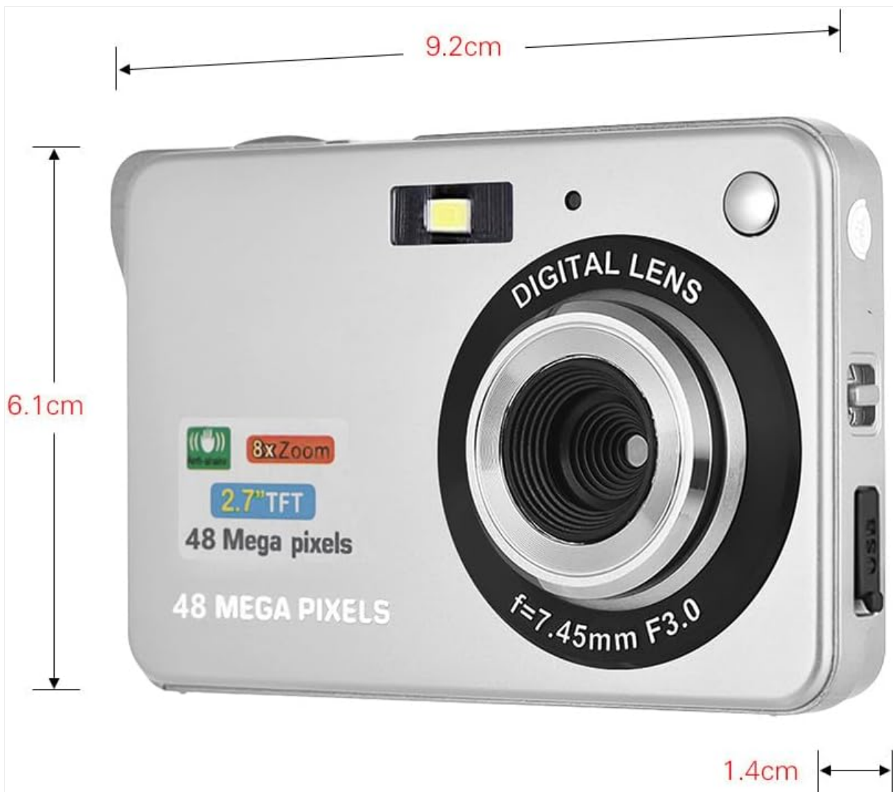
Image: Diagram illustrating the dimensions of the Andoer D11773S camera: 9.2cm length, 6.1cm width, and 1.4cm thickness.