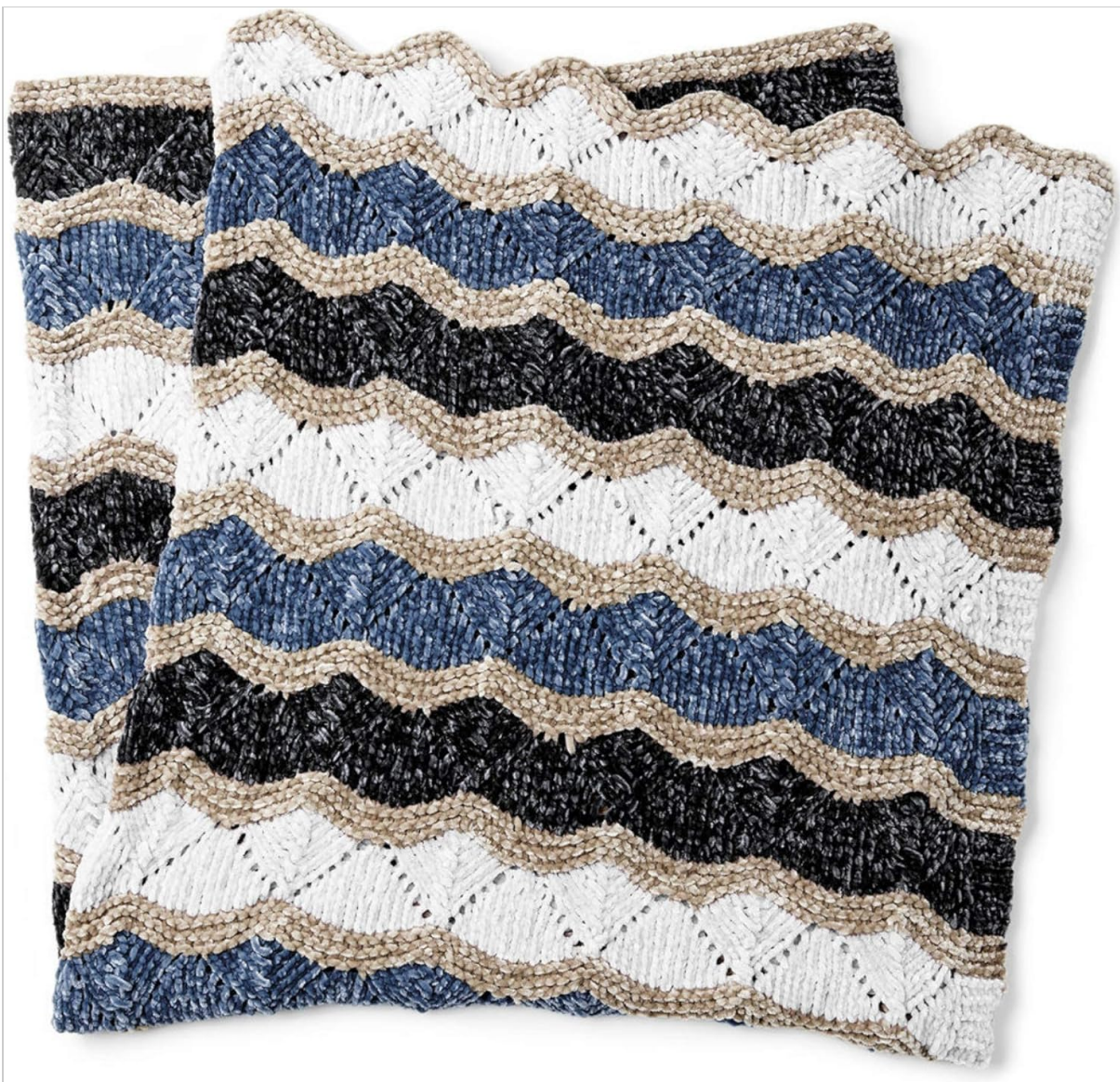
Image: Example of a finished blanket crafted with Bernat Velvet Yarn, showcasing its soft texture and drape.