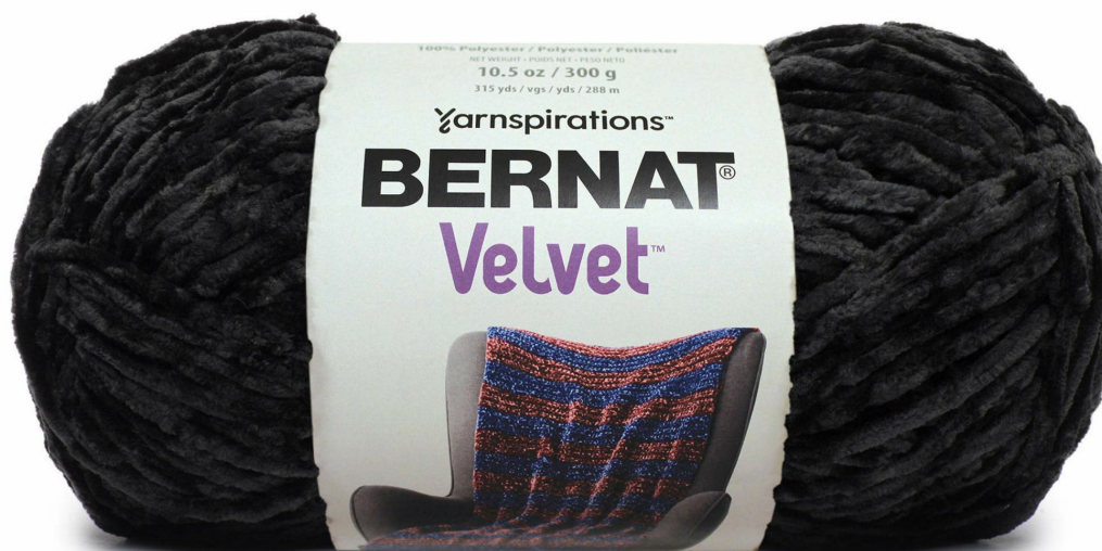
Image: Close-up of Bernat Velvet Yarn in Blackbird color, highlighting its soft, velvety texture.