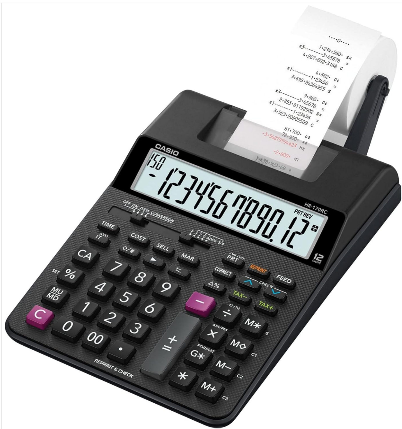
Figure 3: Top view of the calculator showing key layout