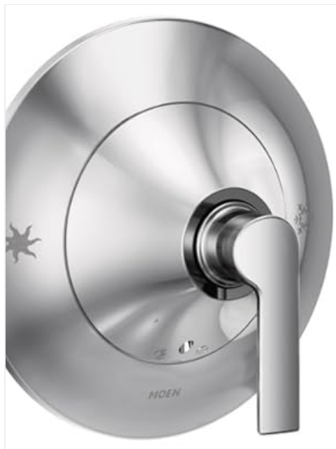
Close-up of the Moen Doux Chrome trim kit handle.

The Moen Doux 1-Handle Posi-Temp Pressure Balancing Valve Trim Kit is designed for simple and intuitive operation.