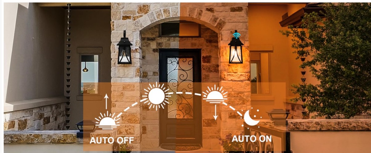
Figure 3: Dusk to Dawn Functionality. The integrated photocell automatically manages light operation.

Your browser does not support the video tag.