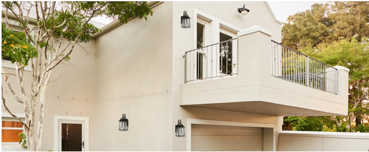
Figure 4: Weather Resistance. The fixture is designed to withstand various outdoor weather conditions.