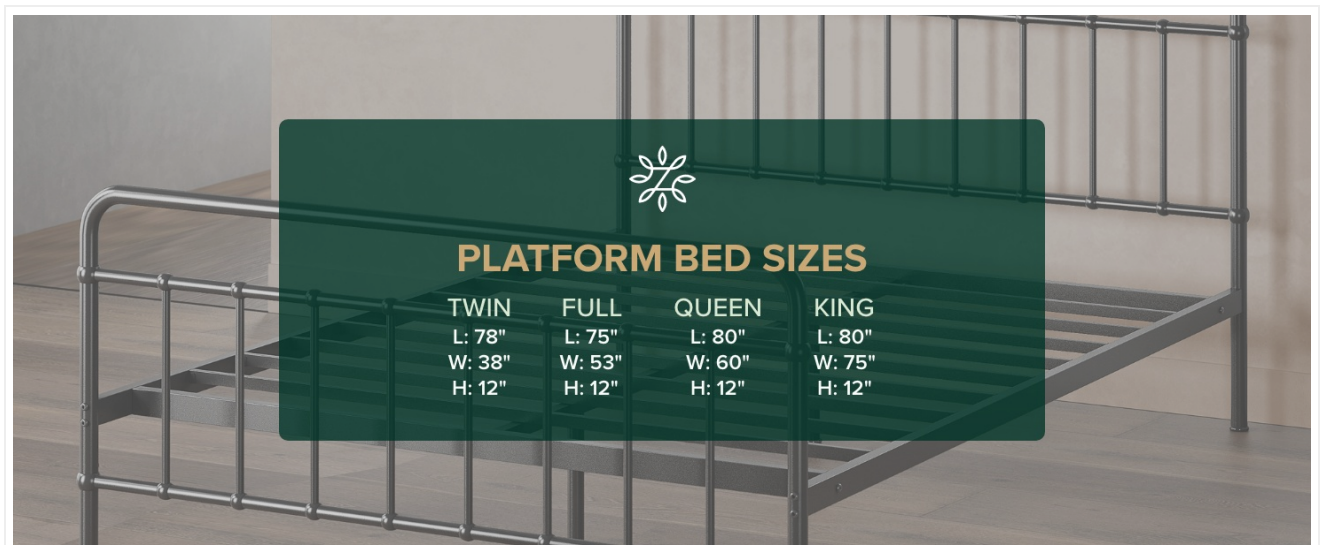
Image: A chart detailing the available sizes for the ZINUS Florence Platform Bed, including Twin, Full, Queen, and King, with their corresponding dimensions.