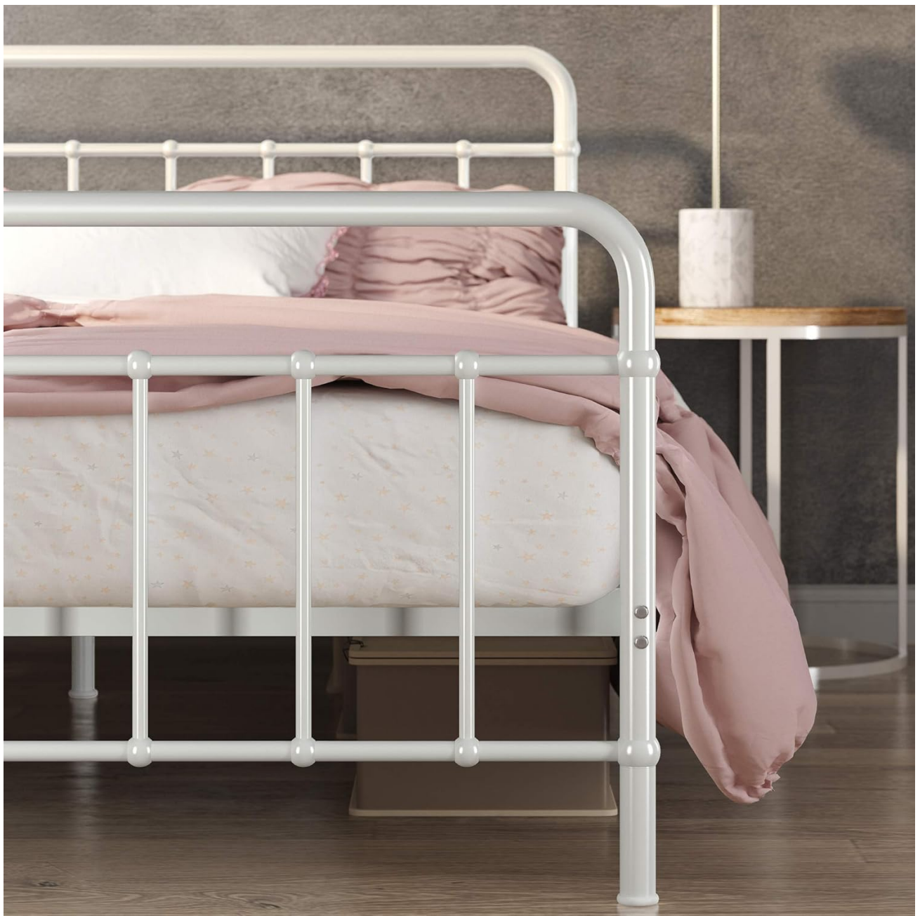
Image: A close-up of the bed frame's side, highlighting the 10-inch under-bed clearance, perfect for storage solutions.