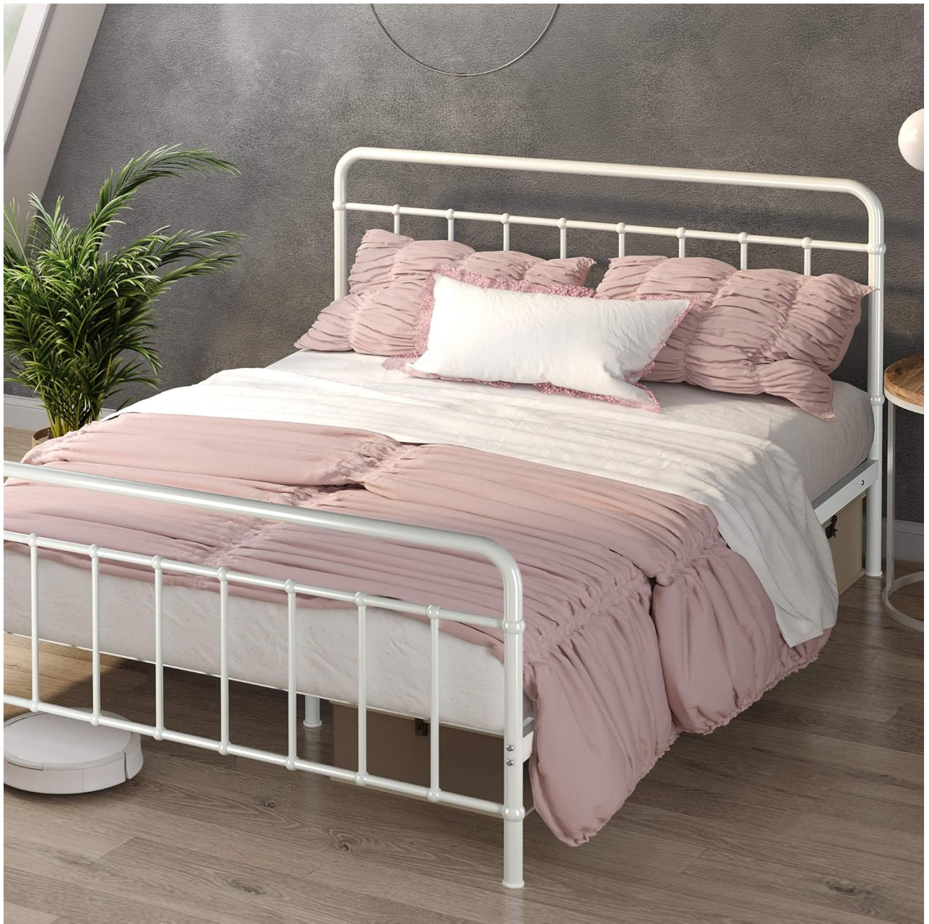
Image: The ZINUS Florence Full Panel Metal Platform Bed Frame, white, shown in a bedroom with pink bedding, demonstrating its aesthetic appeal and design.