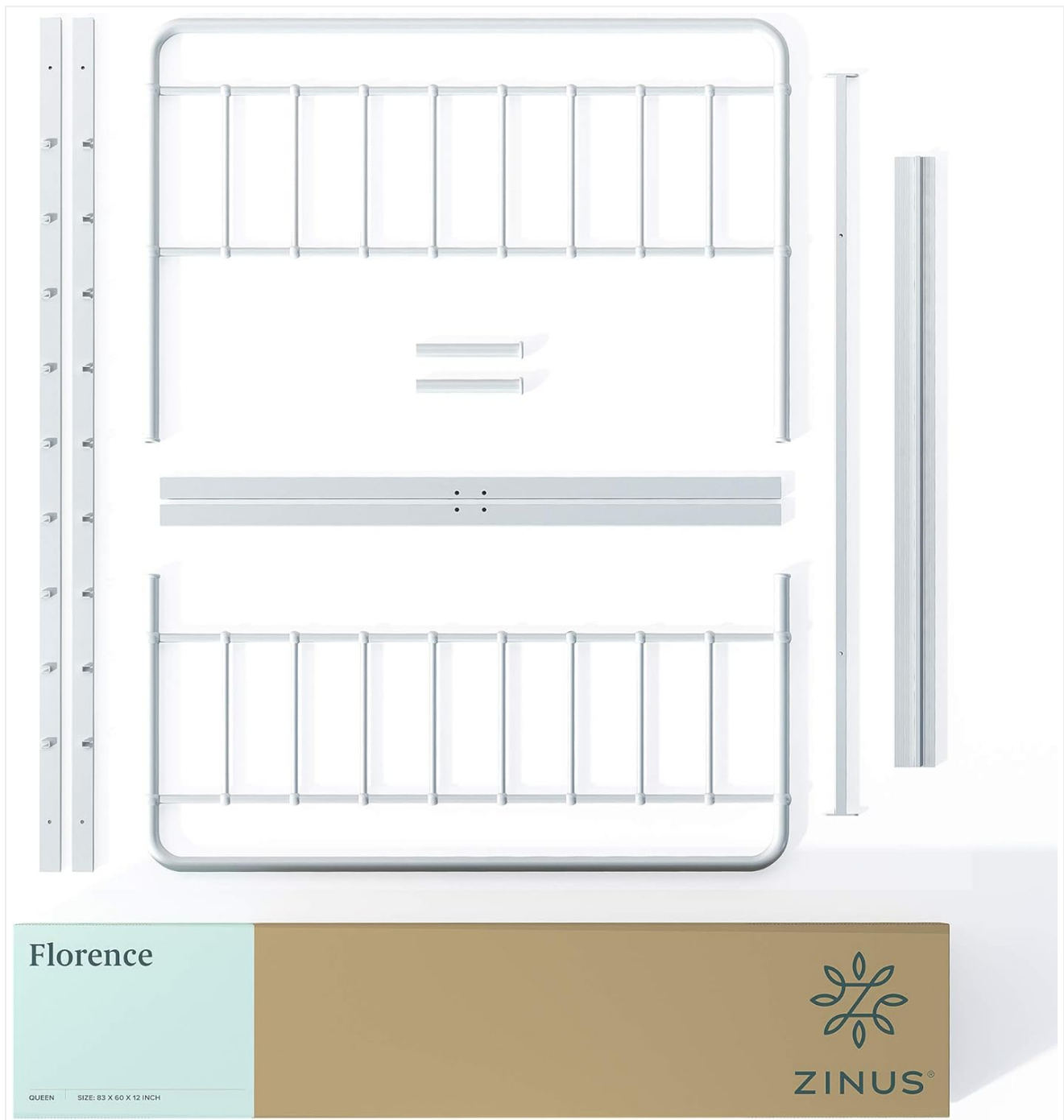
Image: An overhead view of all bed frame components neatly arranged, including the headboard, footboard, side rails, and slats, alongside the product packaging.