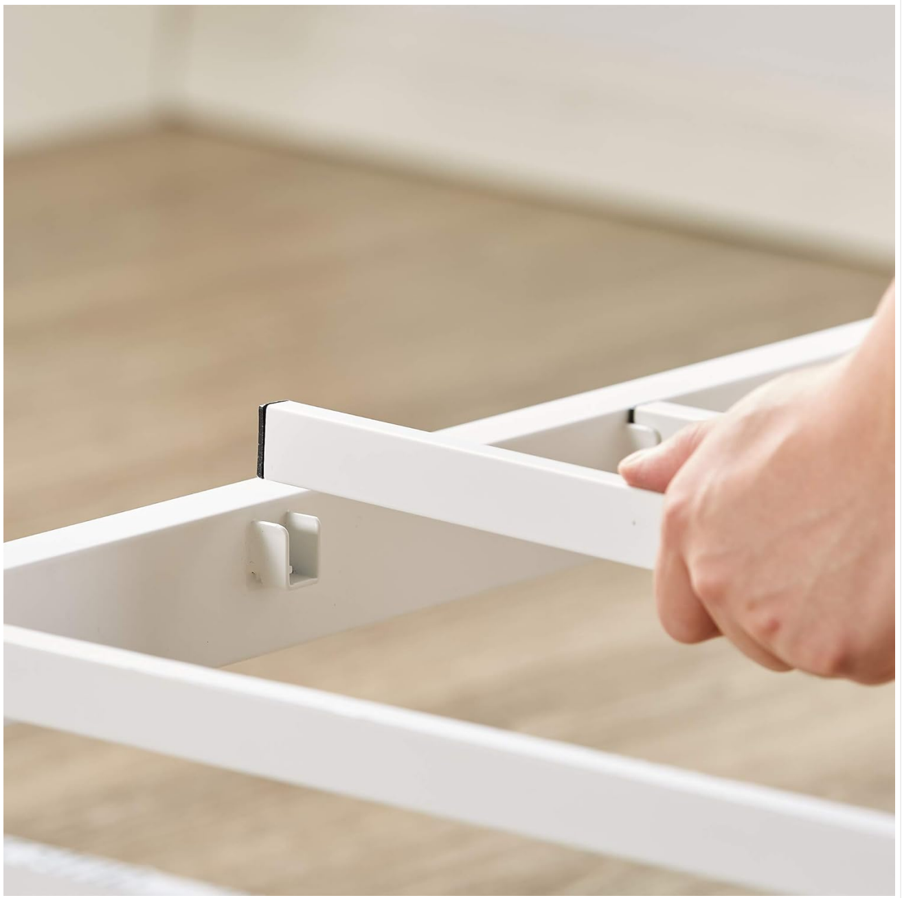
Image: Another perspective of a hand securing a metal slat, illustrating the intuitive design for quick setup.