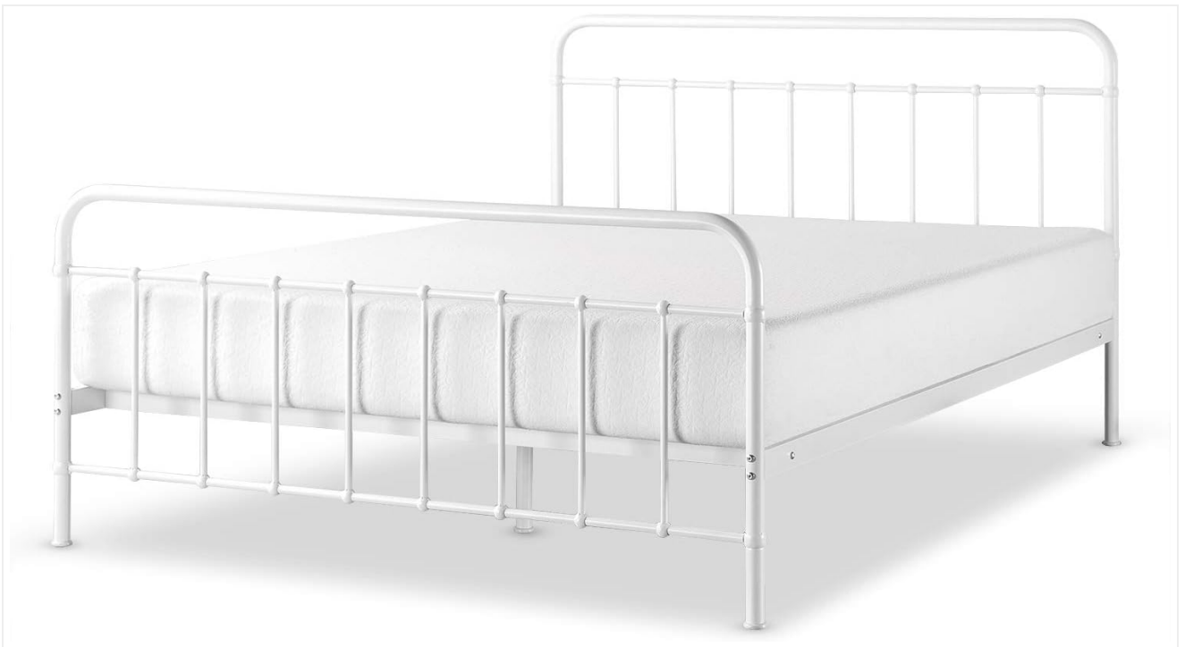
Image: The ZINUS Florence bed frame with a mattress in place, illustrating that a box spring is not required due to the integrated slat support.