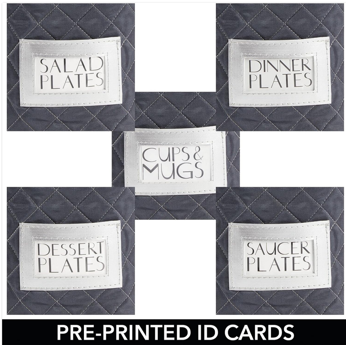
Image: Pre-printed ID cards for various dinnerware types.