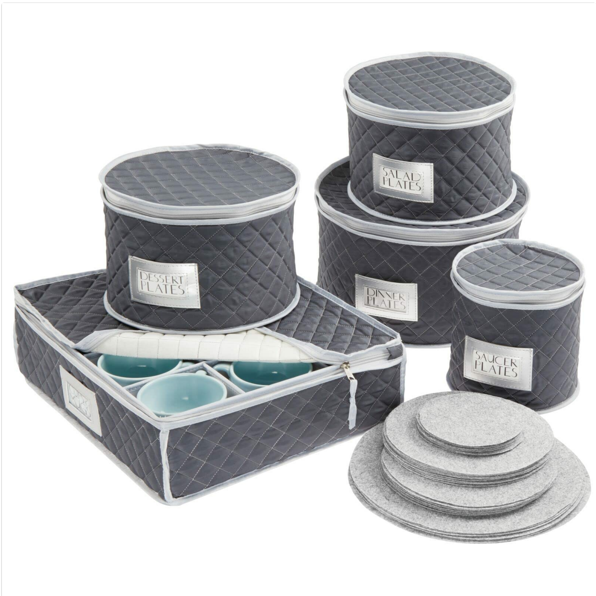
Image: The complete mDesign Quilted Dinnerware Storage 5 Piece Set, including bins for dinner plates, salad plates, dessert plates, saucers, and cups, along with felt separators.