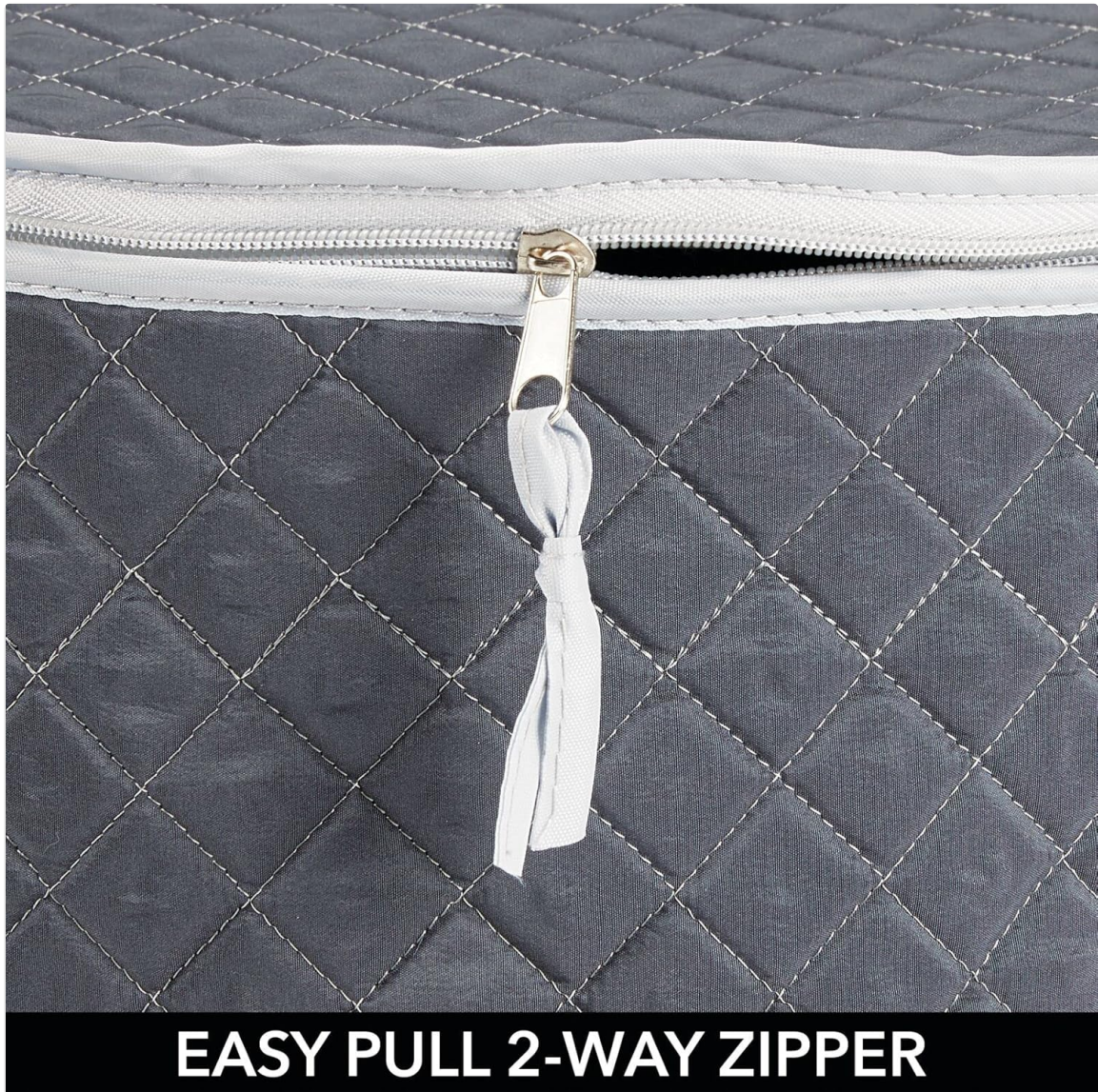
Image: Detail of the easy-pull 2-way zipper for secure closure.