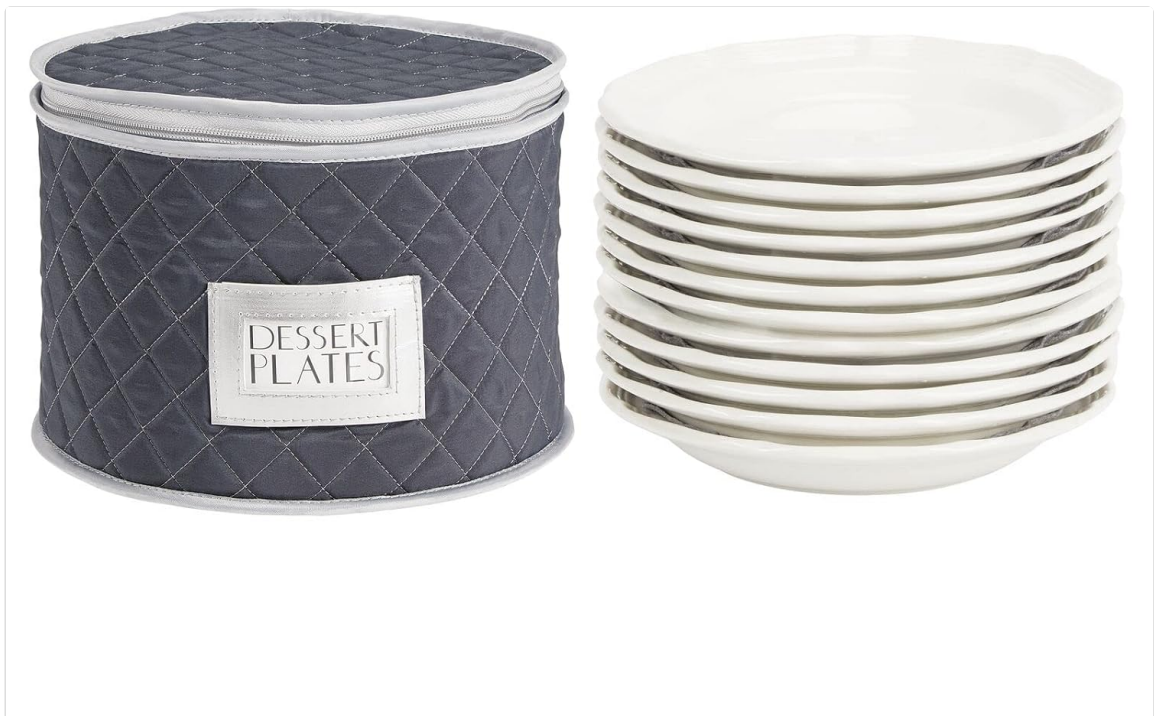
Image: Demonstrating the use of felt separators between plates.