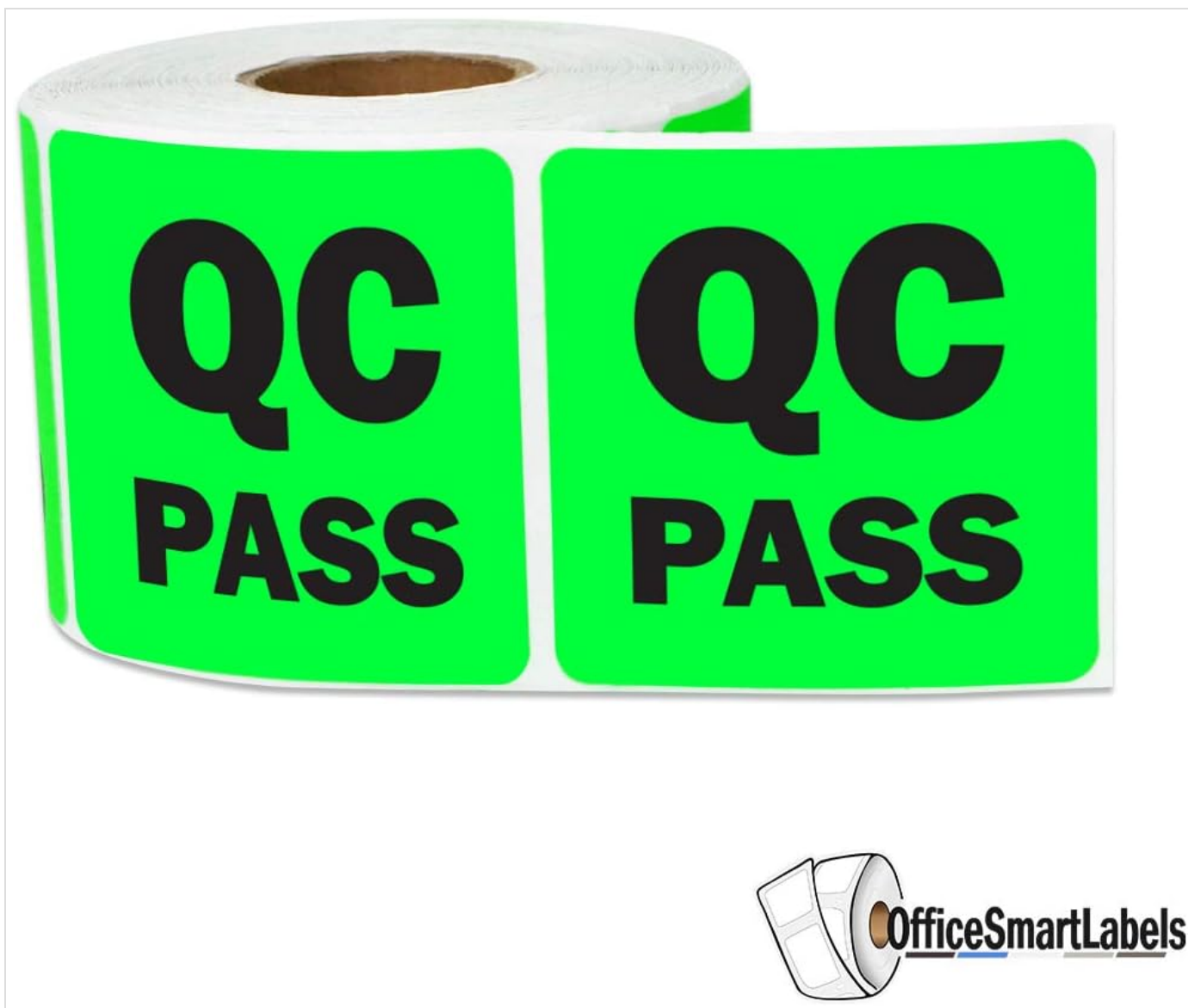
Image: Two rolls of QC Pass stickers, showing the continuous roll format.