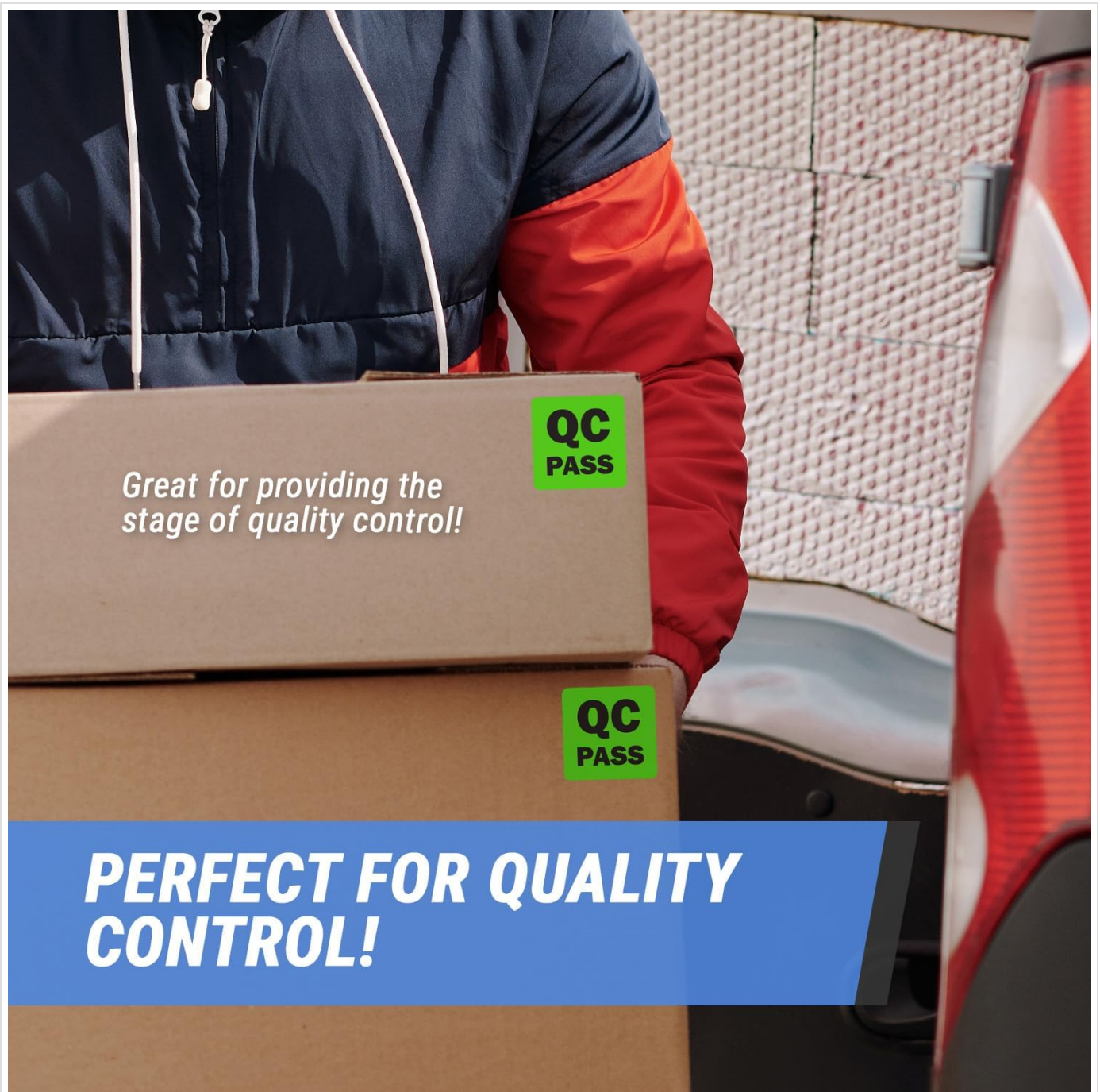
Image: A person carrying two cardboard boxes, each clearly marked with a QC Pass sticker, ready for transport.