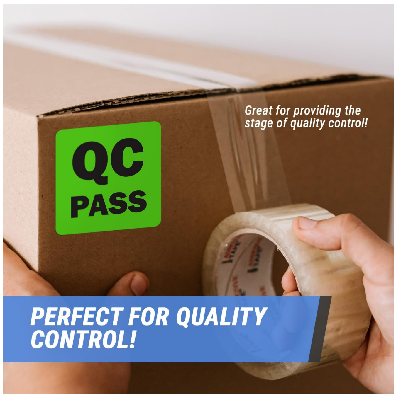
Image: A QC Pass sticker on a box, with clear packing tape being applied over it, demonstrating durability.