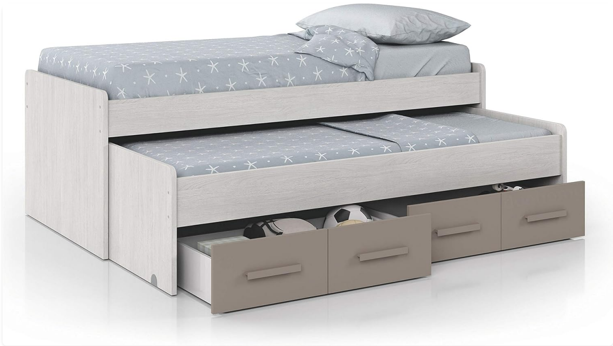
Figure 1: The Habitdesign Ares Trundle Bed in Alpine White and Basalt, with the lower bed extended and storage drawers open. This image illustrates the bed's dual sleeping capacity and integrated storage.

This product is manufactured from high-quality, durable melamine particle board, certified by PEFC (Spanish Association for Forest Sustainability), ensuring both longevity and environmental responsibility. Its non-porous surface makes it easy to clean and maintain.