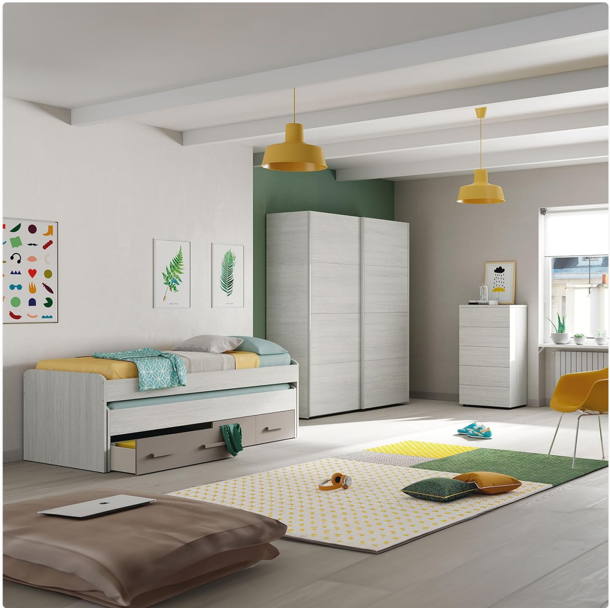
Figure 4: The Habitdesign Ares Trundle Bed in a bedroom, demonstrating the functionality of the pull-out lower bed and the accessible storage drawers. This image highlights the practical use of the bed's features.