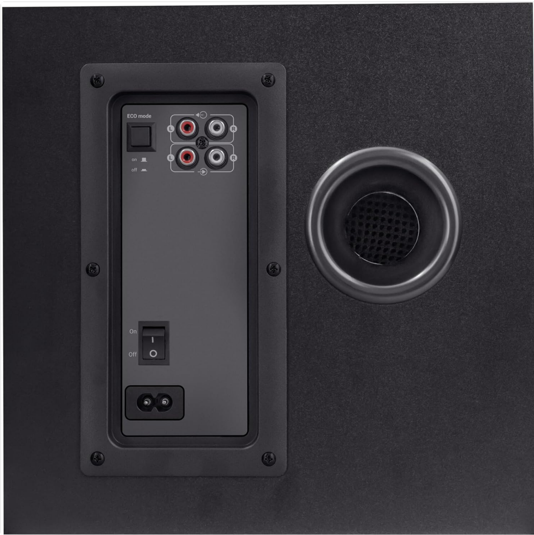
Rear view of the subwoofer, showing the RCA input ports for satellite speakers and the power switch.