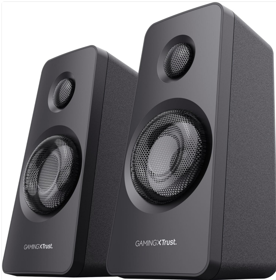
The two satellite speakers, designed for clear audio output.