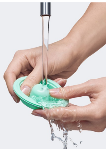
Image: A visual guide demonstrating the ease of cleaning Elvie Pump components. Hands are shown washing the detachable parts under running water, emphasizing the hygienic and simple maintenance process.