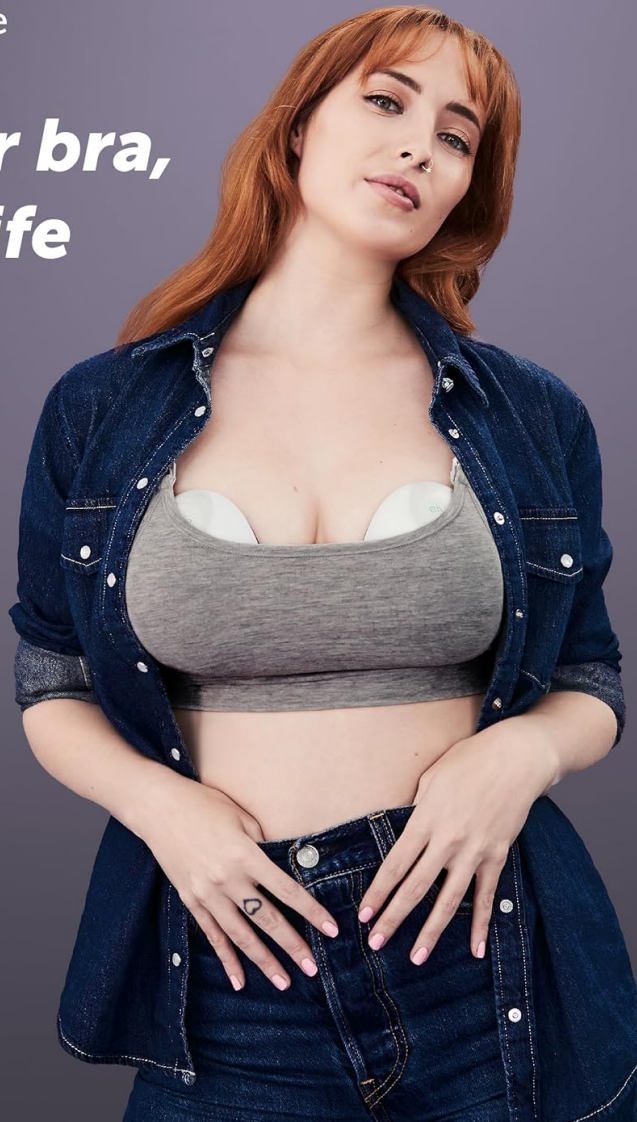
Image: A woman wearing the Elvie Pump discreetly inside her bra, demonstrating its wearable and hands-free nature. The pump is designed to be small and quiet for use in various settings.