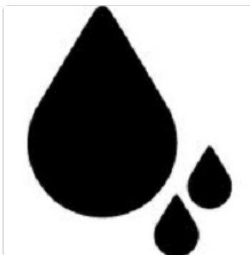
Figure 5: Water resistance indicator.

Your Casio W218H watch is water resistant to 50 meters (165 feet). This means it is suitable for short periods of recreational swimming, showering, and washing hands. It is not suitable for diving or snorkeling. Avoid operating buttons while the watch is wet or submerged to prevent water ingress.