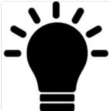
Figure 4: Watch display with LED backlight activated.

Press the LIGHT button to illuminate the display for easy viewing in low-light conditions. The backlight will remain active as long as the button is pressed.