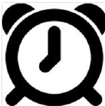
Figure 2: Alarm setting display.