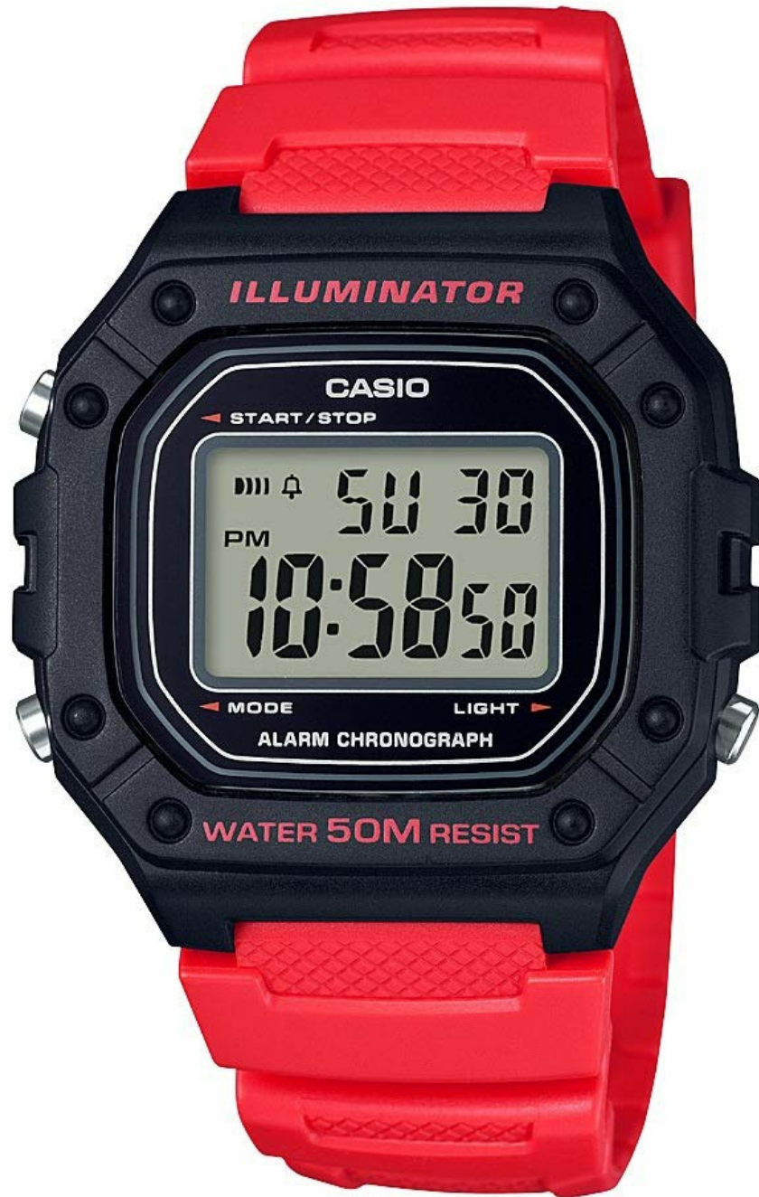
Figure 1: Front view of the Casio W218H Series Digital Watch.