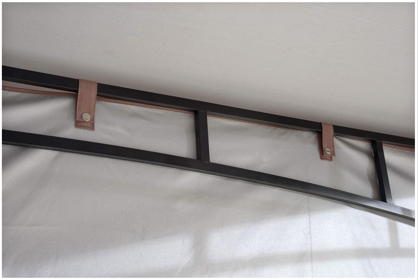
Figure 3: Fabric attachment straps securing the cover to the frame.