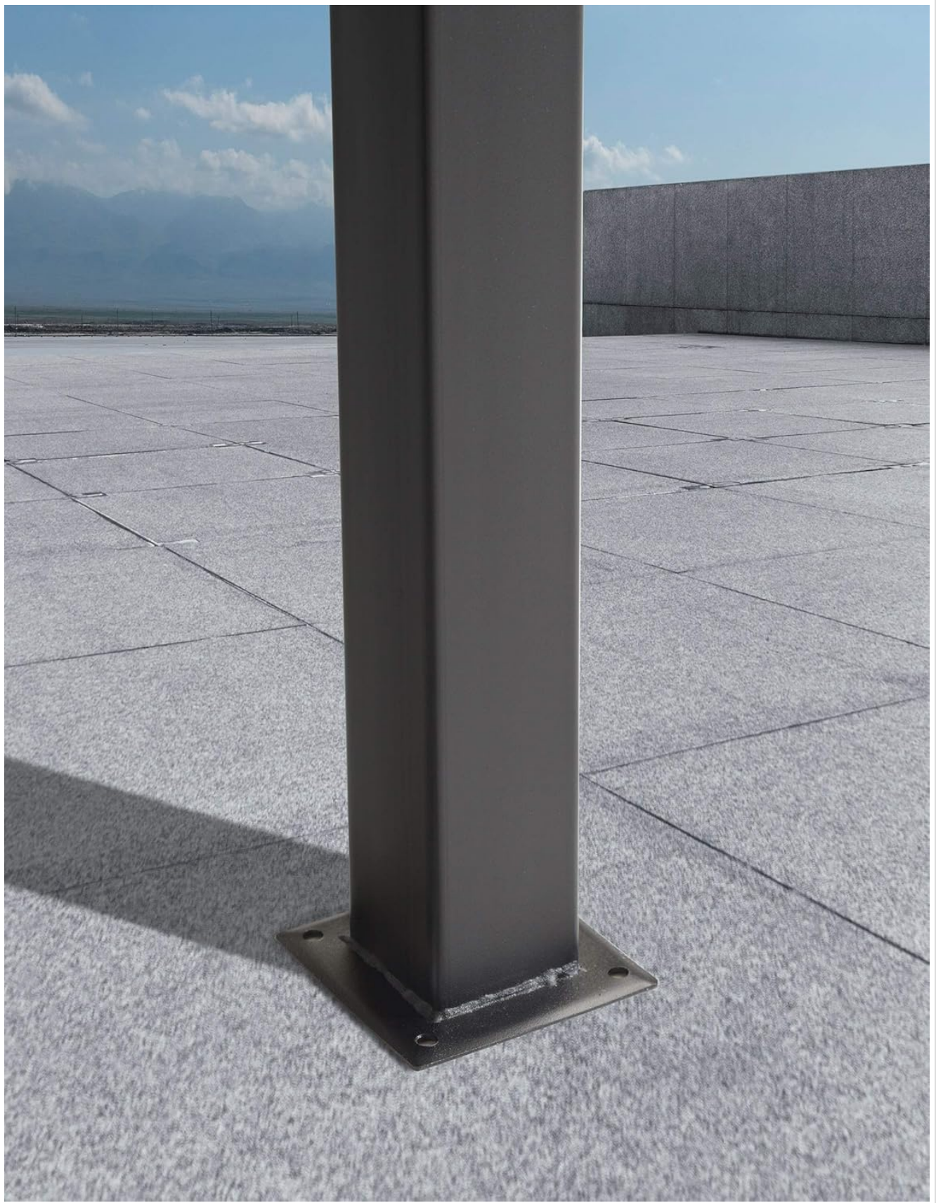
Figure 2: Base plate of a canopy leg, ready for anchoring.