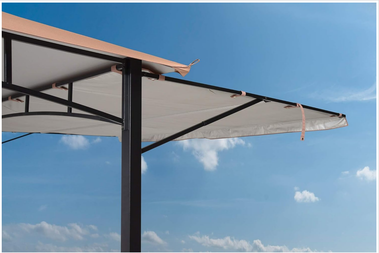
Figure 5: Awning attachment detail.