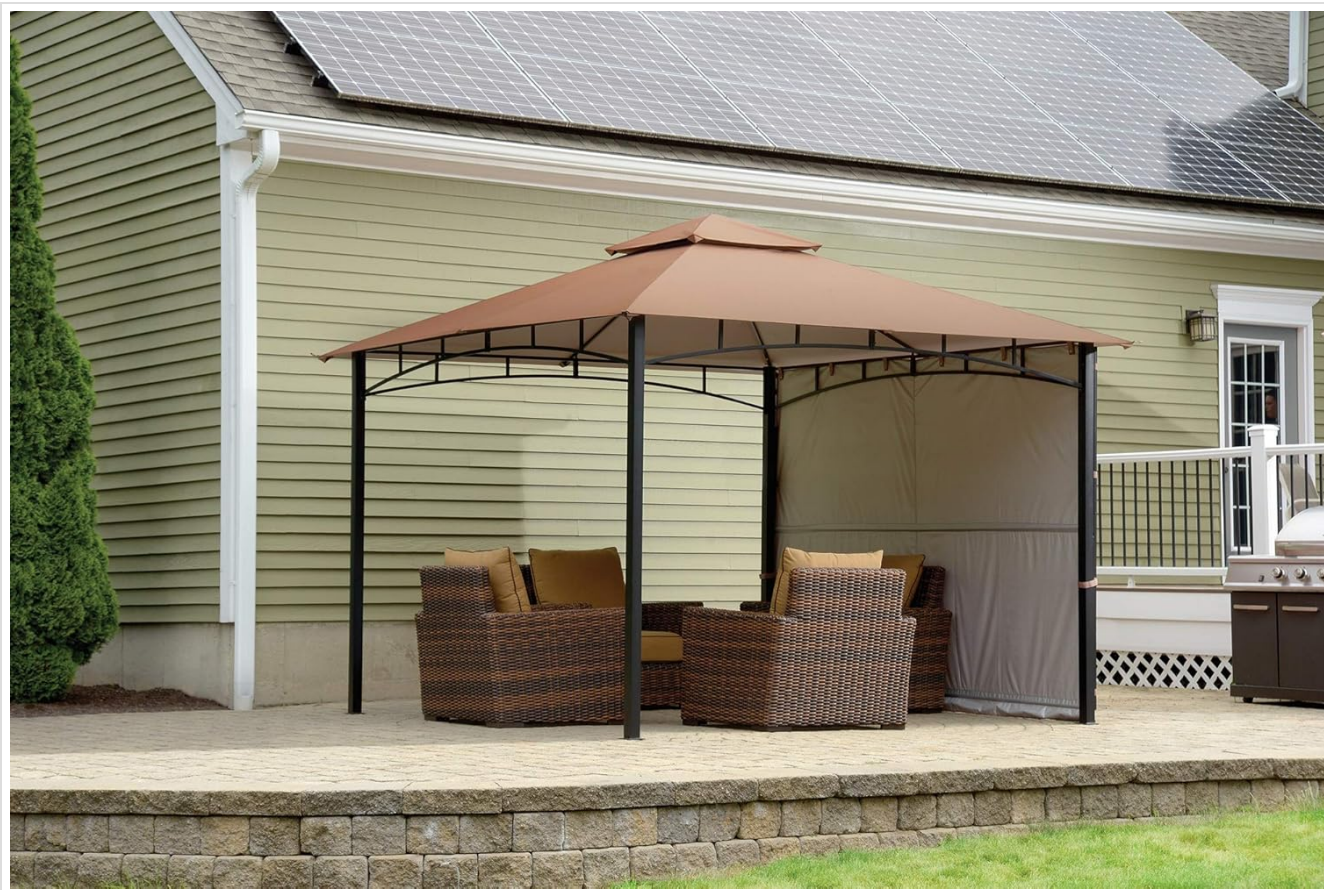
Figure 6: Canopy with extendable awning retracted.

canopy. Ensure it is fully retracted and secured to prevent it from catching wind.