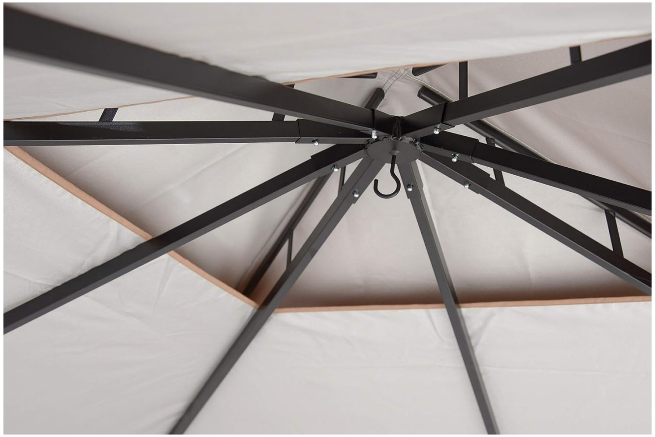
Figure 1: Inside roof structure with central hook for lightweight items.

Assemble the steel frame according to the detailed diagrams in your included instruction manual. The strong 2.4" x 2.4" square corner posts provide stability. Square tube leg posts feature threaded inserts for a solid roof-to-leg attachment. The four exterior 4" wide cross beam trusses create the structure's shape, with 8 beams supporting the roof.