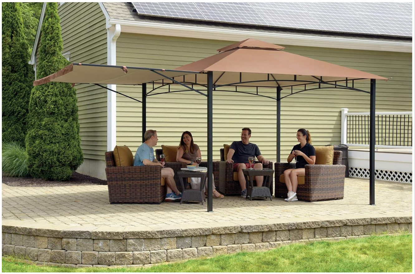
Figure 4: Canopy with extendable awning deployed.