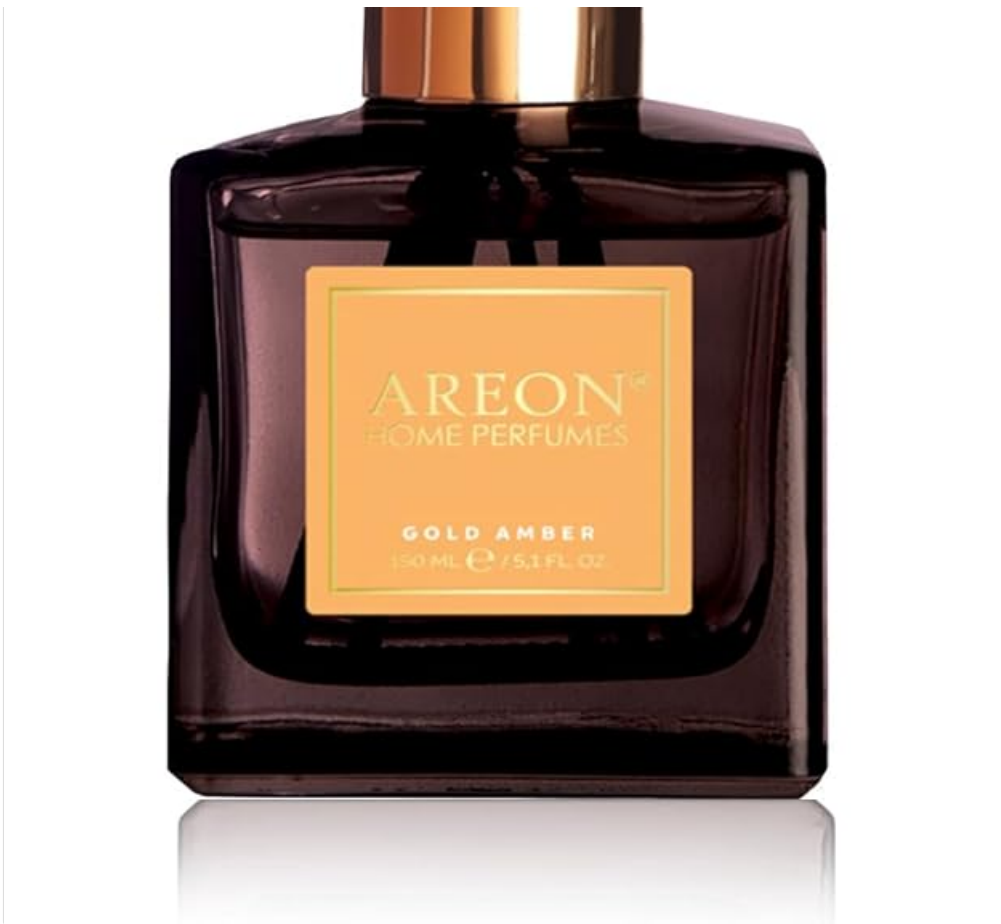
Figure 2: Reed Diffuser with reeds in place.