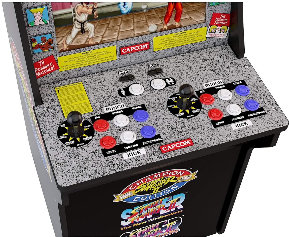
Figure 3: Detailed view of the two-player control panel, showing joysticks and action buttons.