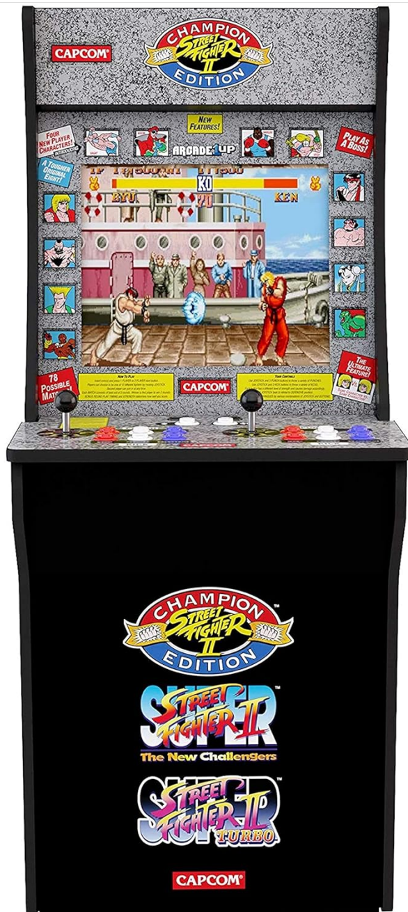
Figure 1: Fully assembled Arcade1Up Street Fighter II Home Arcade Machine.

The cabinet features a classic upright design. For optimal playing height, especially for taller users, a compatible riser (sold separately) can be used to elevate the machine. The dimensions of the unit are approximately 45.8 inches (H) x 22.75 inches (W) x 19 inches (D), with a weight of 58.5 pounds.