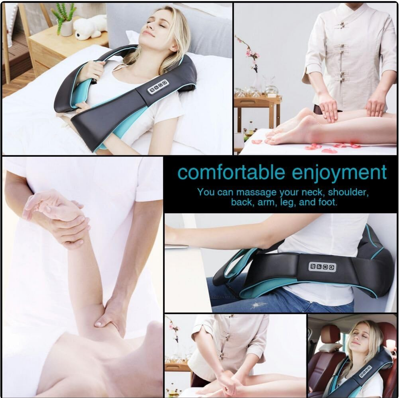
Image: The massager with its power cord connected, demonstrating readiness for operation.