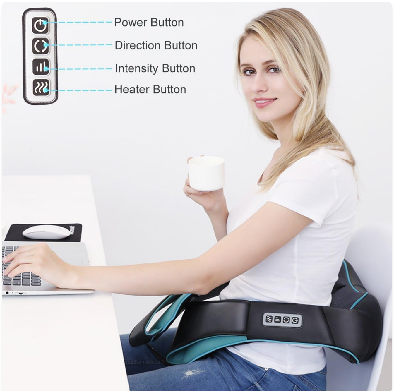
Image: A woman using the massager on her lower back, illustrating its versatility for different body areas.