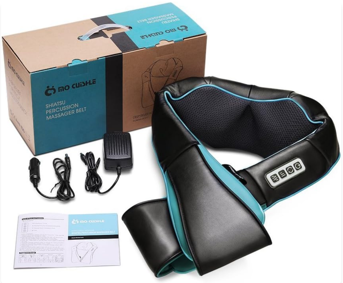
Image: A close-up view showcasing the high-quality leather and breathable mesh materials of the massager, designed for comfort and easy cleaning.