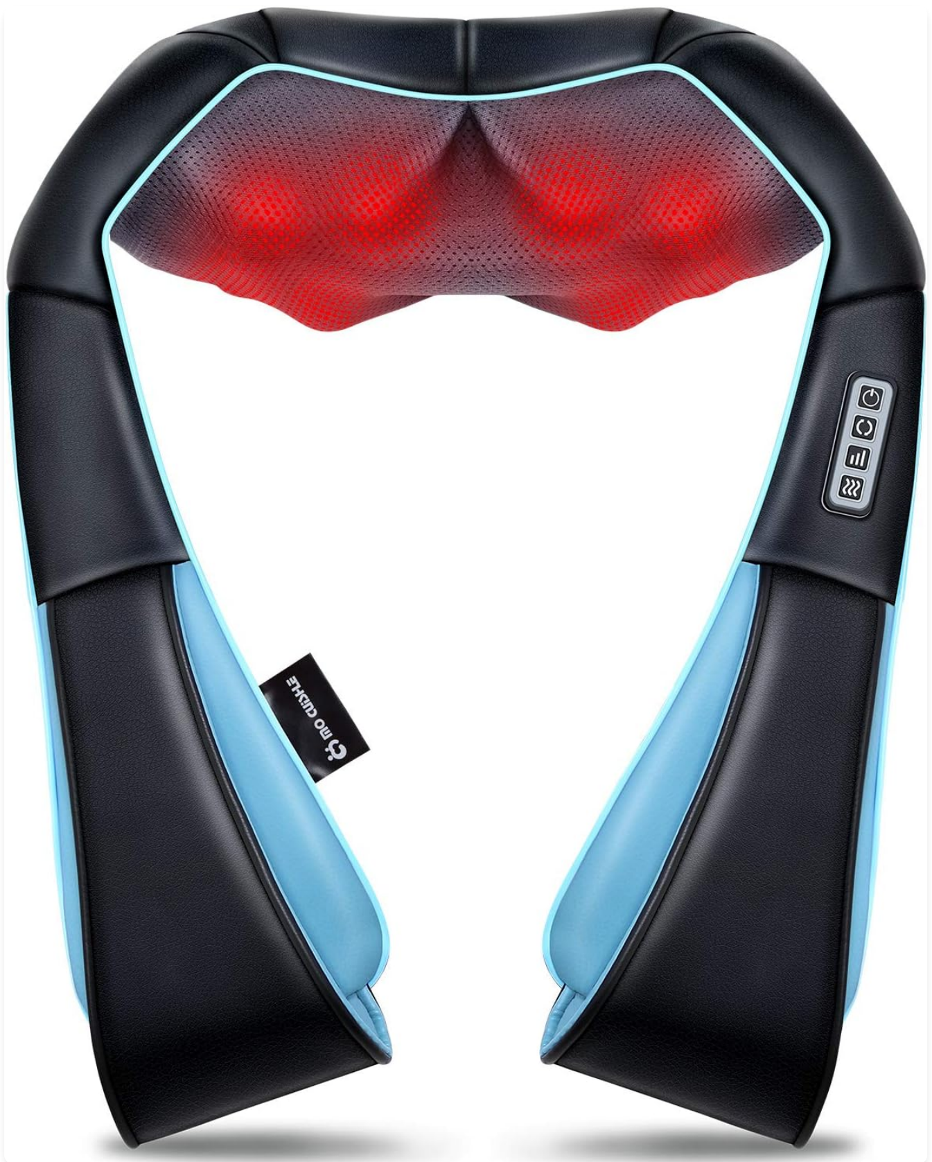
Image: Front view of the massager, highlighting its ergonomic design and integrated control panel.

Familiarize yourself with the main components and controls of your massager.