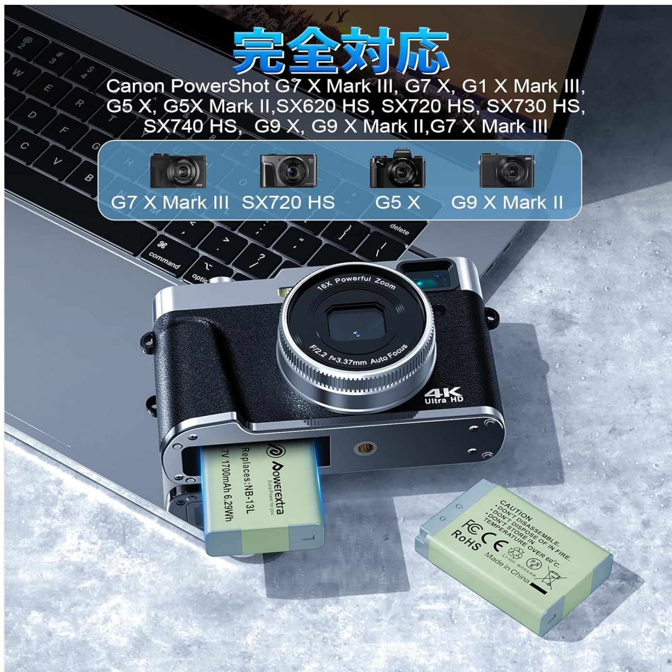
Image 2: An example of a compatible Canon PowerShot camera with the NB-13L battery.