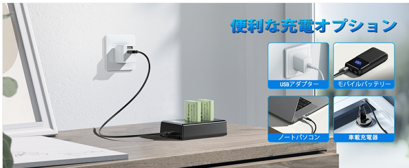
Image 4: Illustration of convenient charging options including USB adapter, mobile battery, laptop, and car charger.

Note: These batteries can also be charged using a genuine Canon charger, and the remaining charge will be displayed.