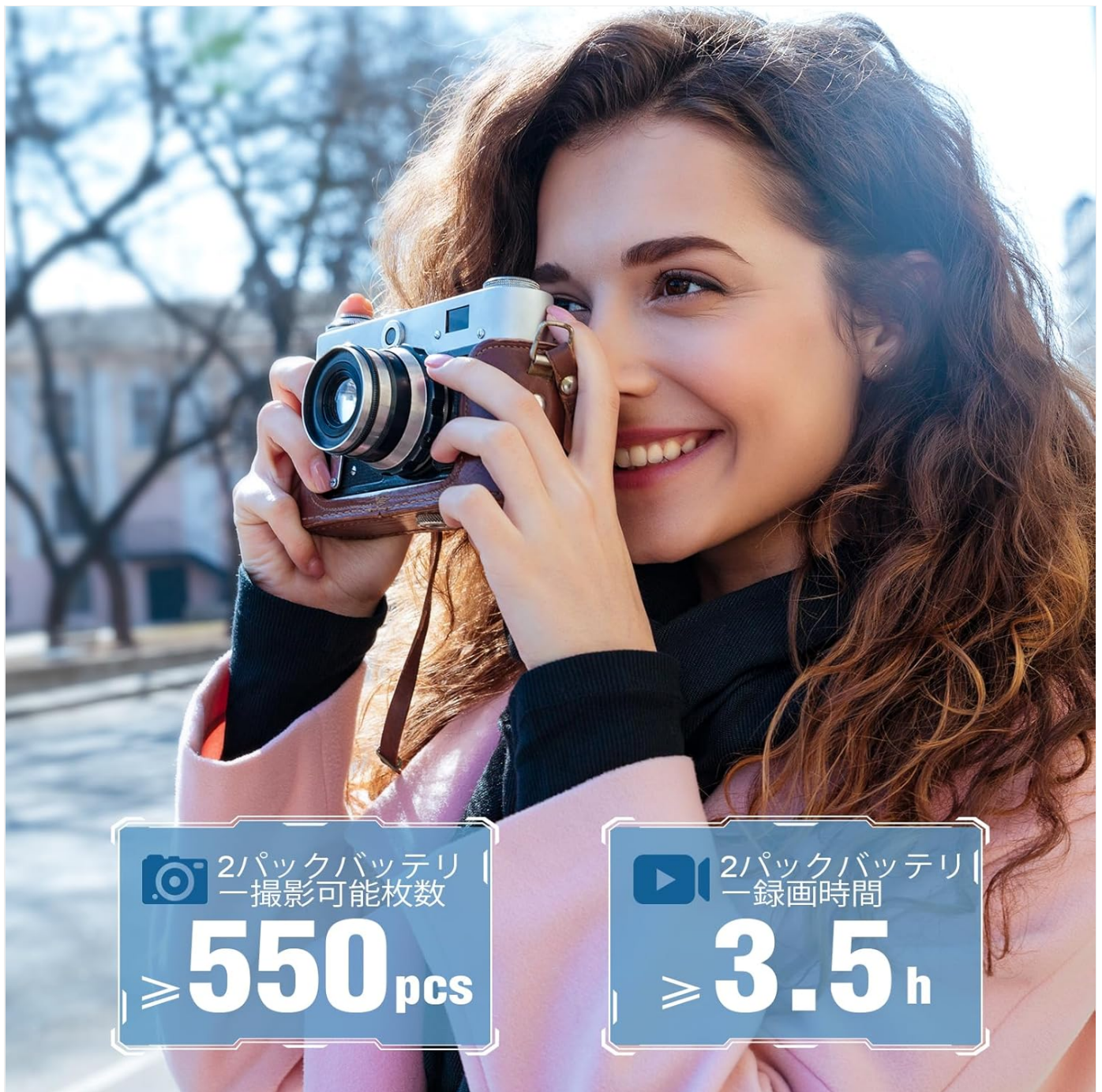
Image 5: A user capturing moments with a camera powered by Powerextra batteries.