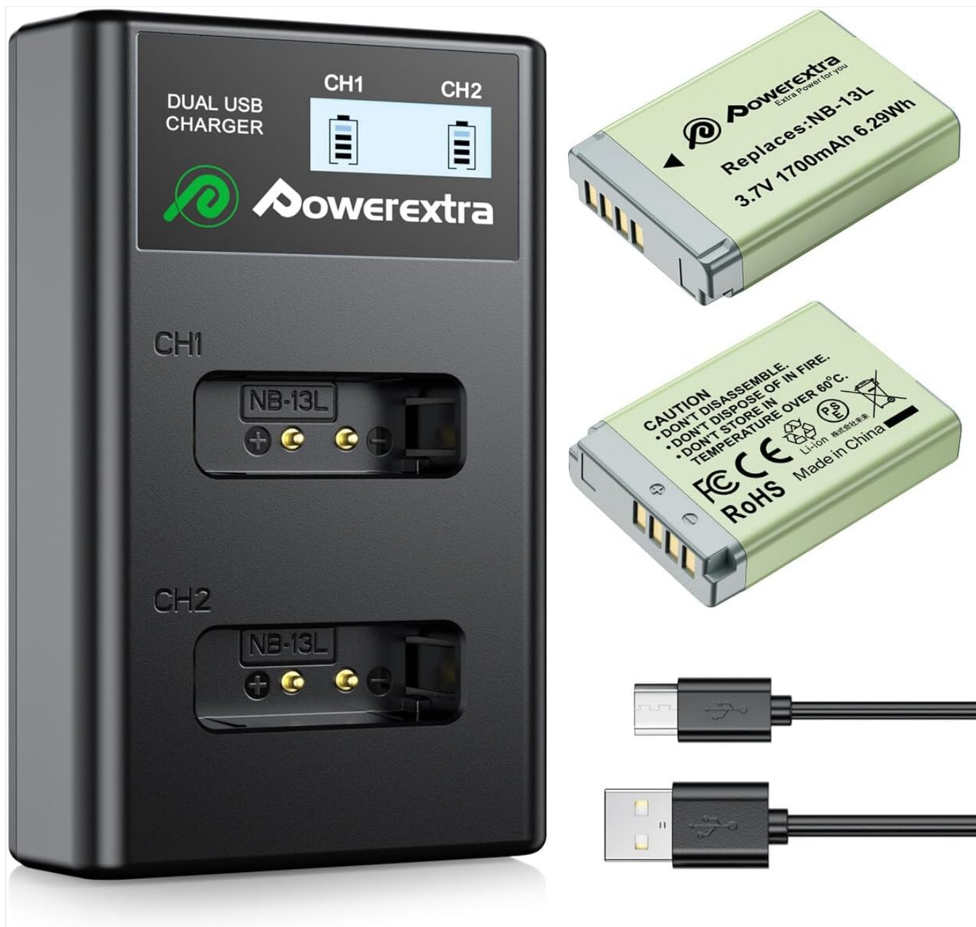
Image 1: The Powerextra NB-13L Battery and Dual USB Charger Set, including two batteries and two USB cables.