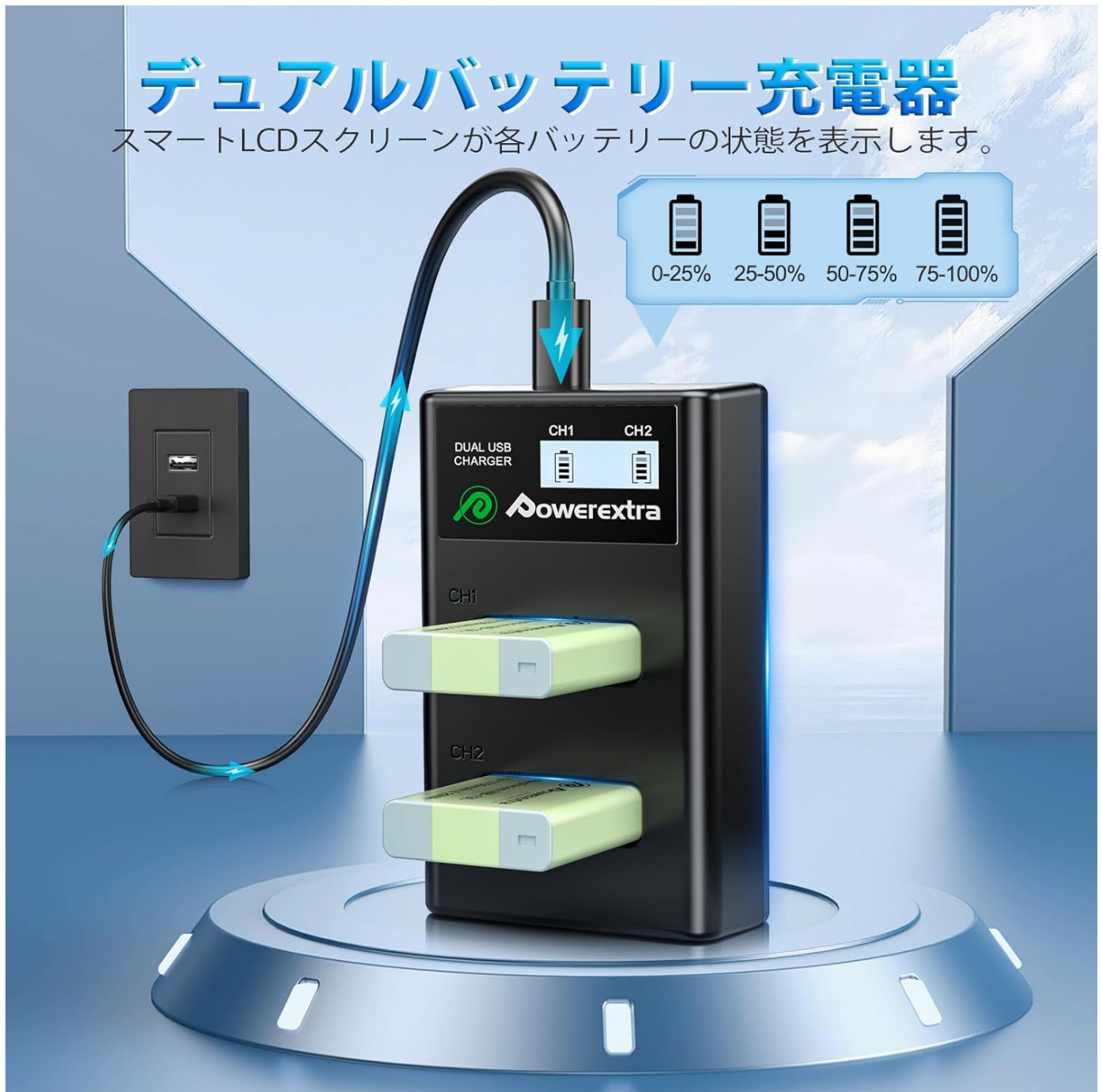
Image 3: The dual USB charger with batteries, illustrating the LCD screen and charging process.