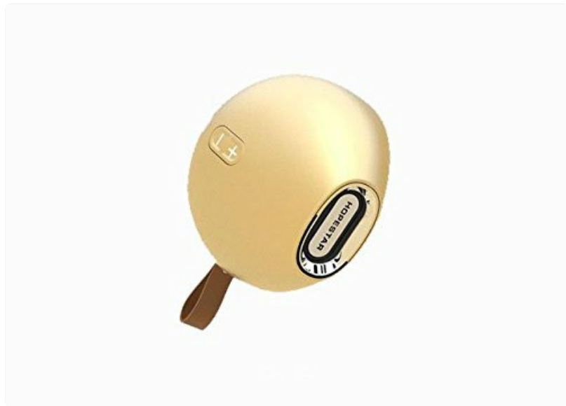
Image: The HOPESTAR A10 speaker in gold, showing its compact design and integrated strap.