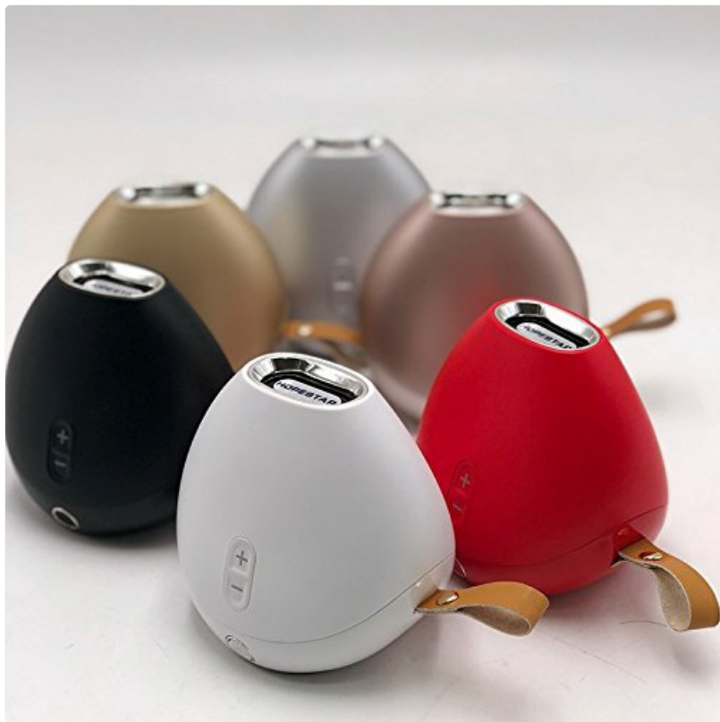
Image: A collection of HOPESTAR A10 speakers showcasing different available colors, highlighting the compact and uniform design across the range.