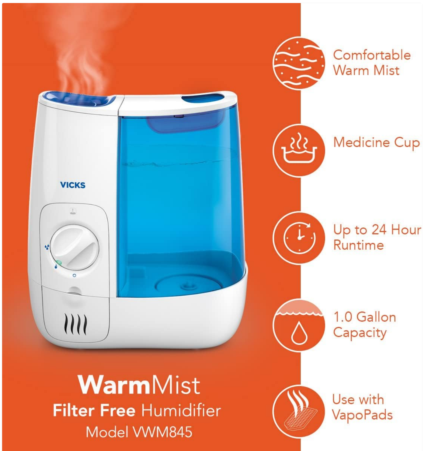
Image: An infographic highlighting key features of the Vicks VWM845 Warm Mist Humidifier, including Comfortable Warm Mist, Medicine Cup, Up to 24 Hour Runtime, 1.0 Gallon Capacity, Filter Free Operation, and Use with VapoPads.