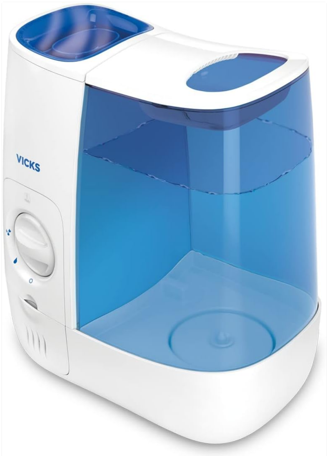
Image: The Vicks VWM845 Warm Mist Humidifier, a white unit with a translucent blue water tank, shown from an angled front view.