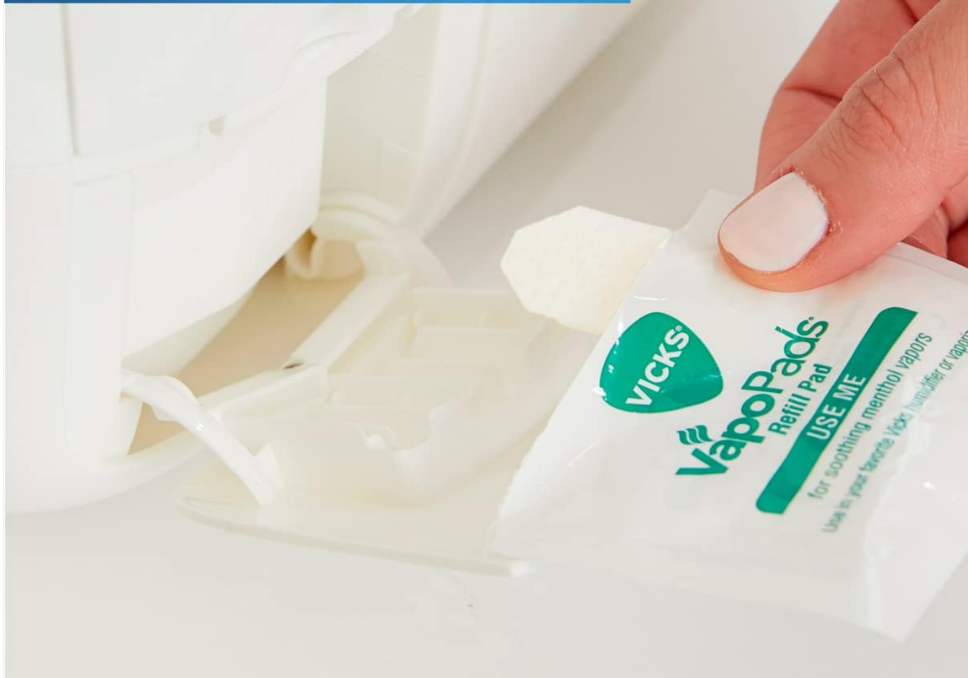
Image: A hand inserting a Vicks VapoPad into the designated scent pad compartment on the side of the humidifier.

Use with Vicks VapoPads for soothing vapors.