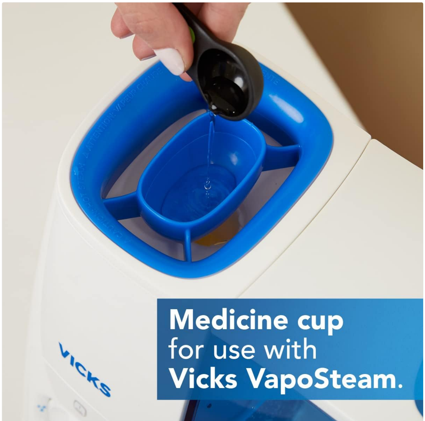
Image: A hand pouring Vicks VapoSteam liquid into the blue medicine cup located on the top of the humidifier.