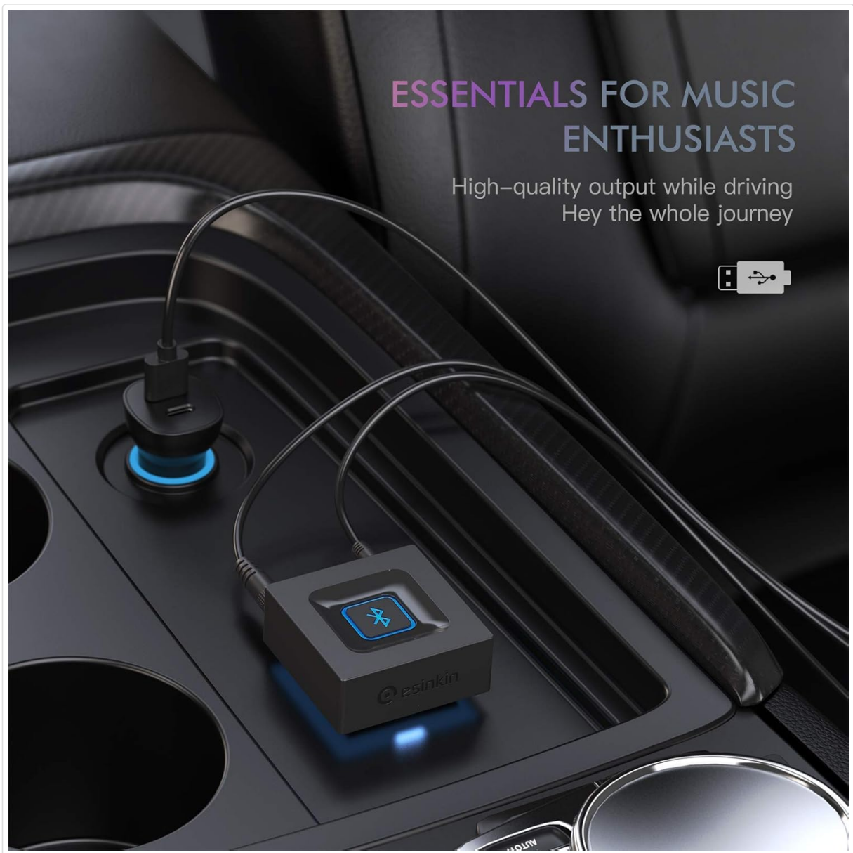
Image 4.1: The receiver powered via a USB port in a car console, demonstrating its compact size and flexible power options.