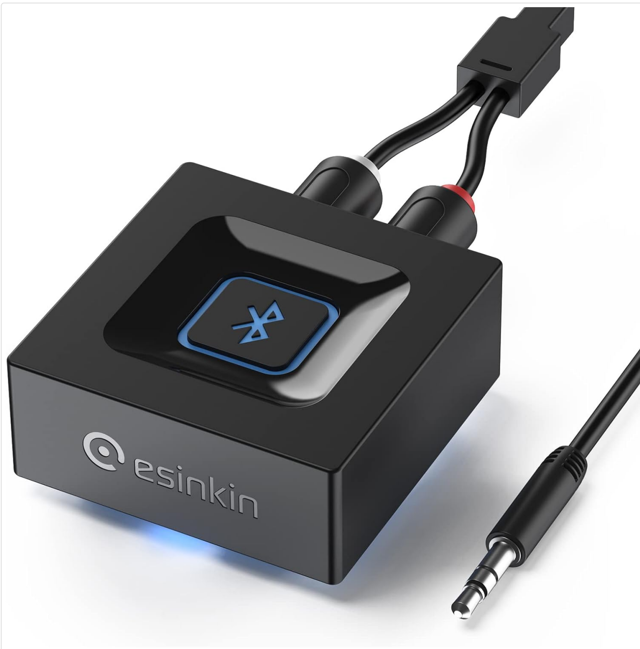
Image 1.1: The esinkin Wireless Audio Receiver, showcasing its compact design and included audio cables (RCA and 3.5mm jack).