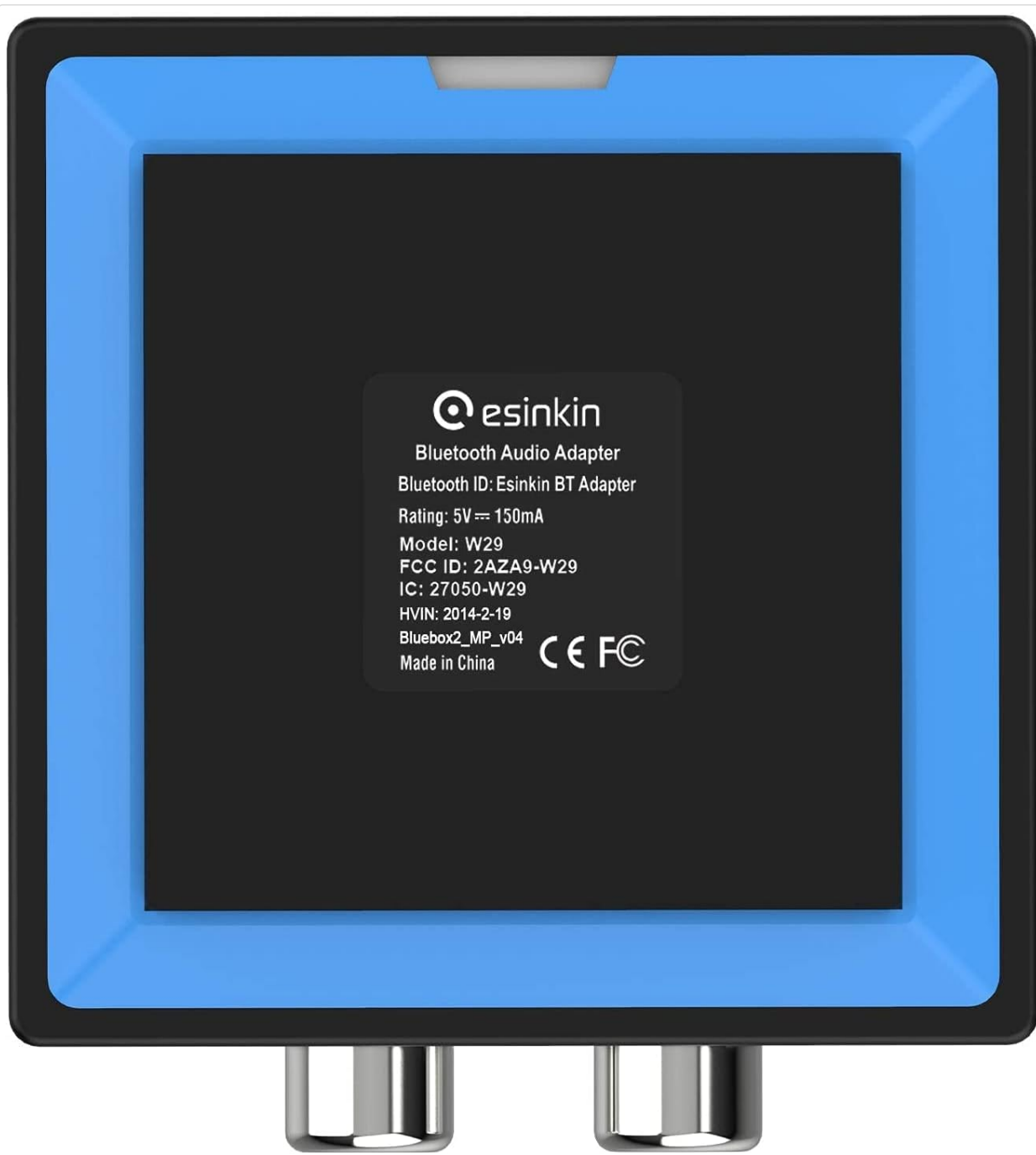
Image 8.1: The underside of the receiver showing the product label with model number, FCC ID, and other regulatory information.