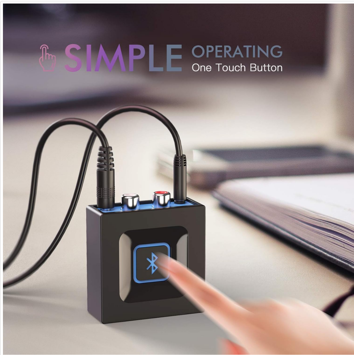
Image 5.1: A hand pressing the central Bluetooth button on the receiver, illustrating the simple one-touch operation for pairing.