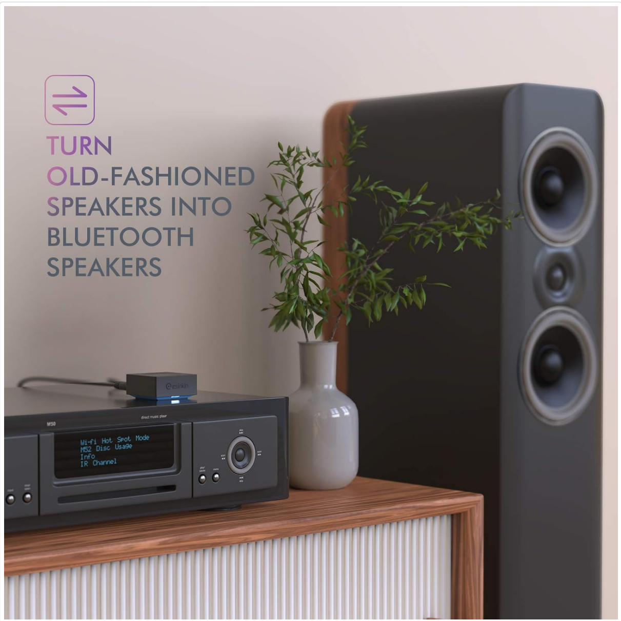
Image 4.3: The receiver seamlessly integrated with a home stereo system, demonstrating how it can upgrade traditional audio setups to wireless.