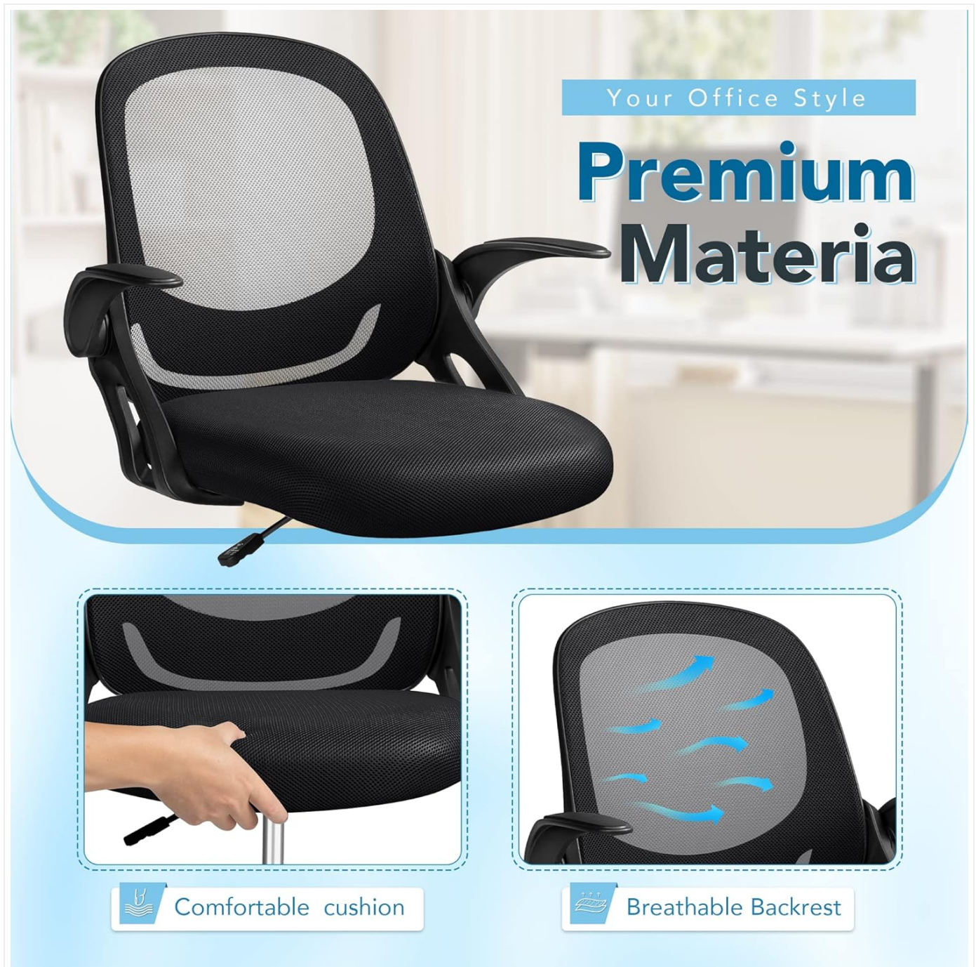
Image 2: The chair features a comfortable cushion and a breathable mesh backrest for extended use.