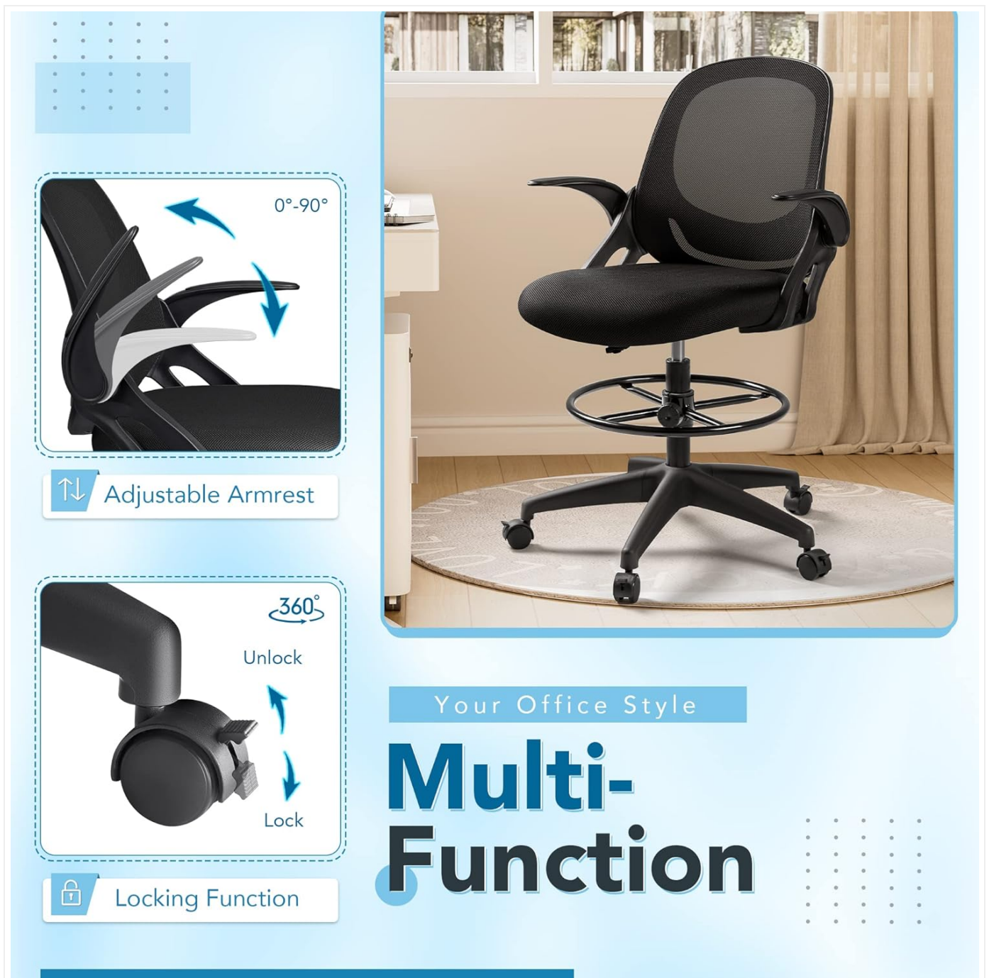
Image 4: Visual guide for adjusting armrests (0-90 degrees) and locking/unlocking the chair's wheels.