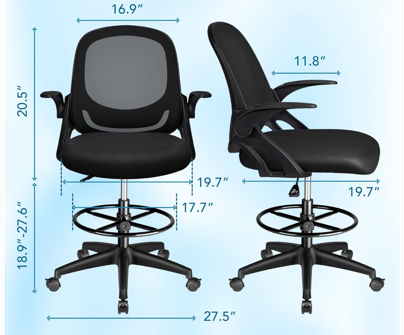
Image 5: Detailed dimensions of the Devoko Drafting Chair, including seat height range and overall width/depth.