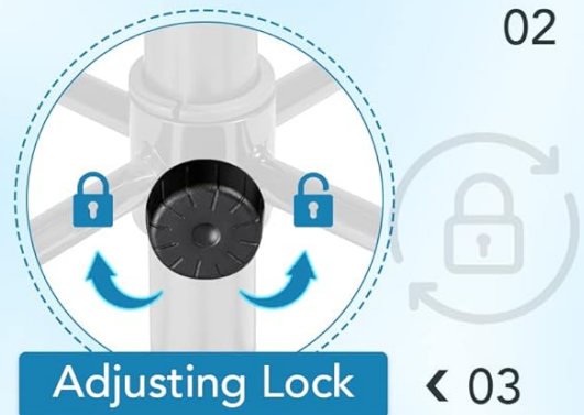
Image 3: Illustration of the adjustable footrest, showing how to raise, lower, and lock its position.