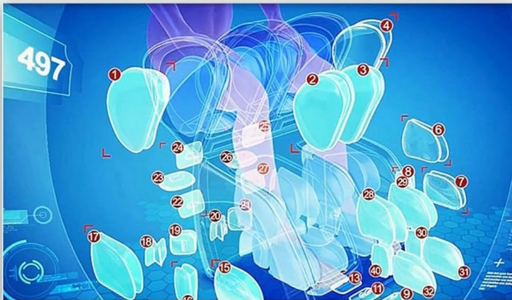
Image: Illustration of the calf airbag system, detailing how the 30 airbags and 3 active rollers work to massage muscles and stimulate reflex points.

Total with 30 air bags, kneading with thigh, calf, instep effective, the 3 active rollers on foot can massage the muscle on foot effectively, stimulating the reflex point on foot.