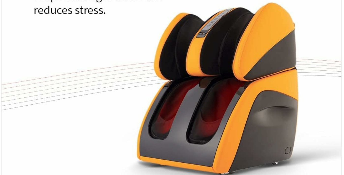
Image: Detailed explanation of the heat therapy function, highlighting its benefits for muscle relaxation.

Can be used for specific heat therapy, with a combination of kneading and rolling for thighs and calves. Helps ease tight knots and reduces stress.