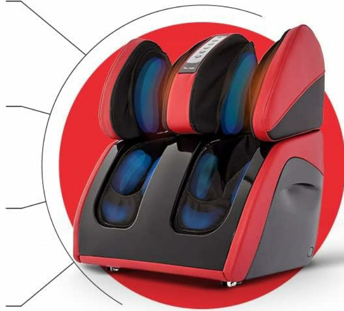
Image: Overview of the massager's key features, including roller levels, program modes, airbag count, and heat therapy.