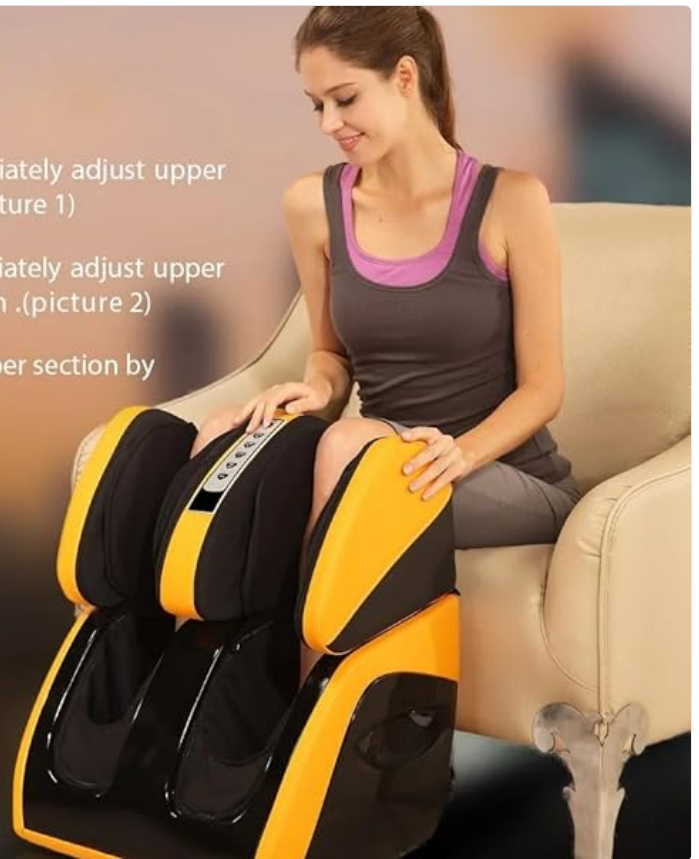
Image: Method of Usage, demonstrating how to adjust the upper section for knee and calf massage, and turning over for knee massage.