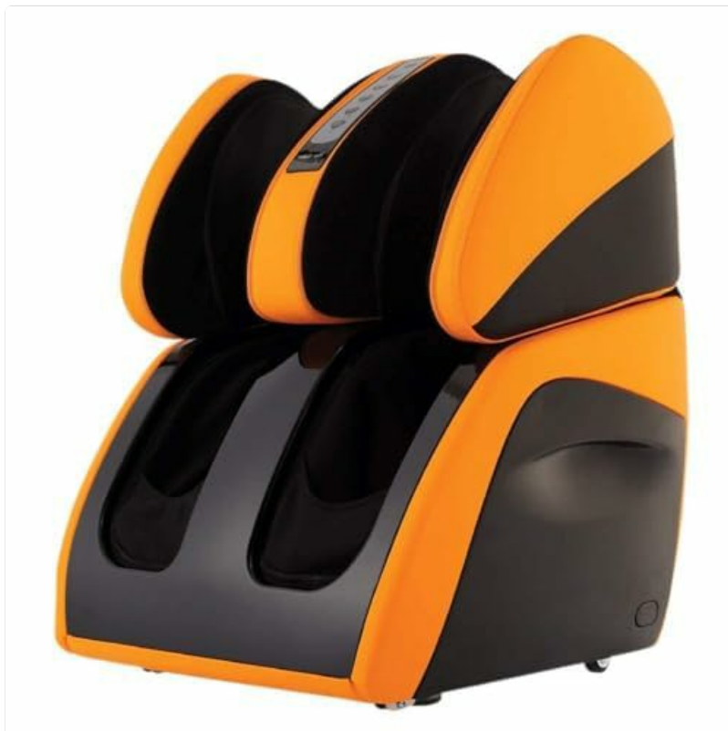
Image: The Robotouch Classic Plus Foot Massager in yellow and black, showcasing its ergonomic design.

The Robotouch Classic Plus Foot Massager is an advanced device designed to provide comprehensive massage therapy for the feet, calves, and thighs. It incorporates intense kneading and vibratory reflexology to alleviate pain and discomfort from overworked muscles. This model features an ergonomic design with PU leather upholstery. This manual provides essential information for the safe and effective operation, maintenance, and troubleshooting of your massager.