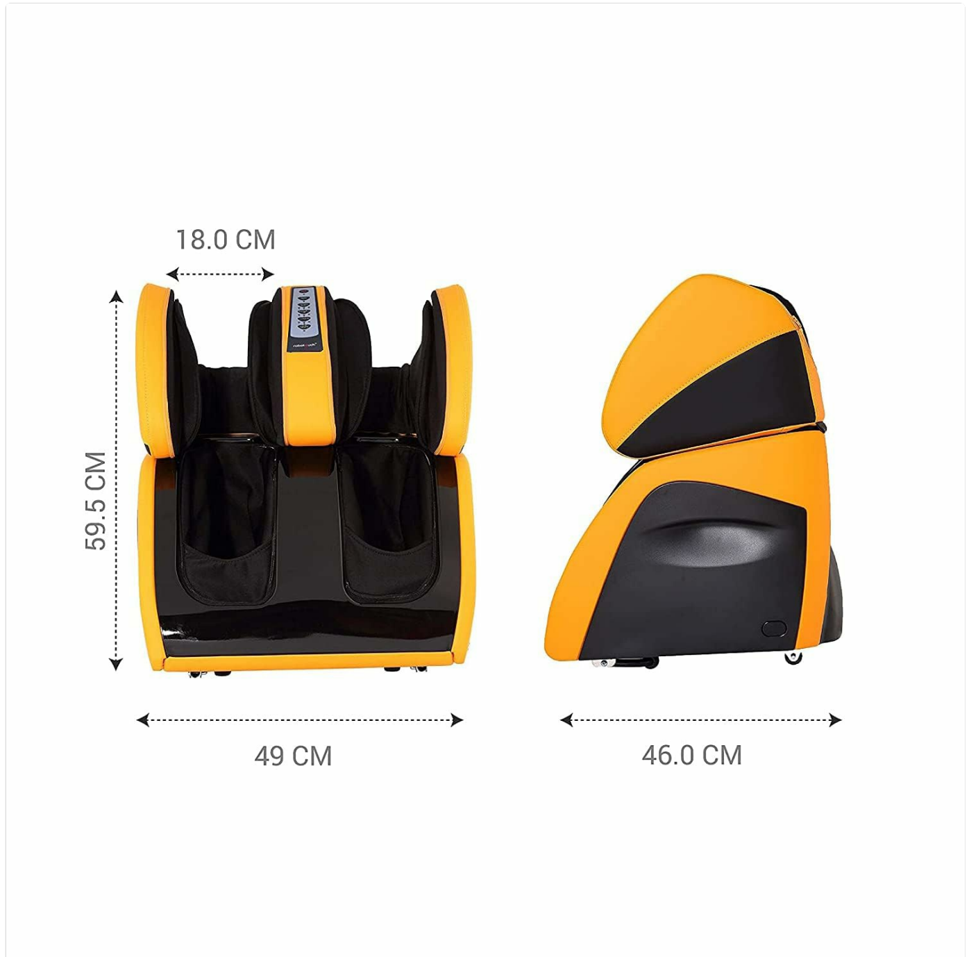
Image: Product dimensions for proper placement, showing length, width, and height measurements.