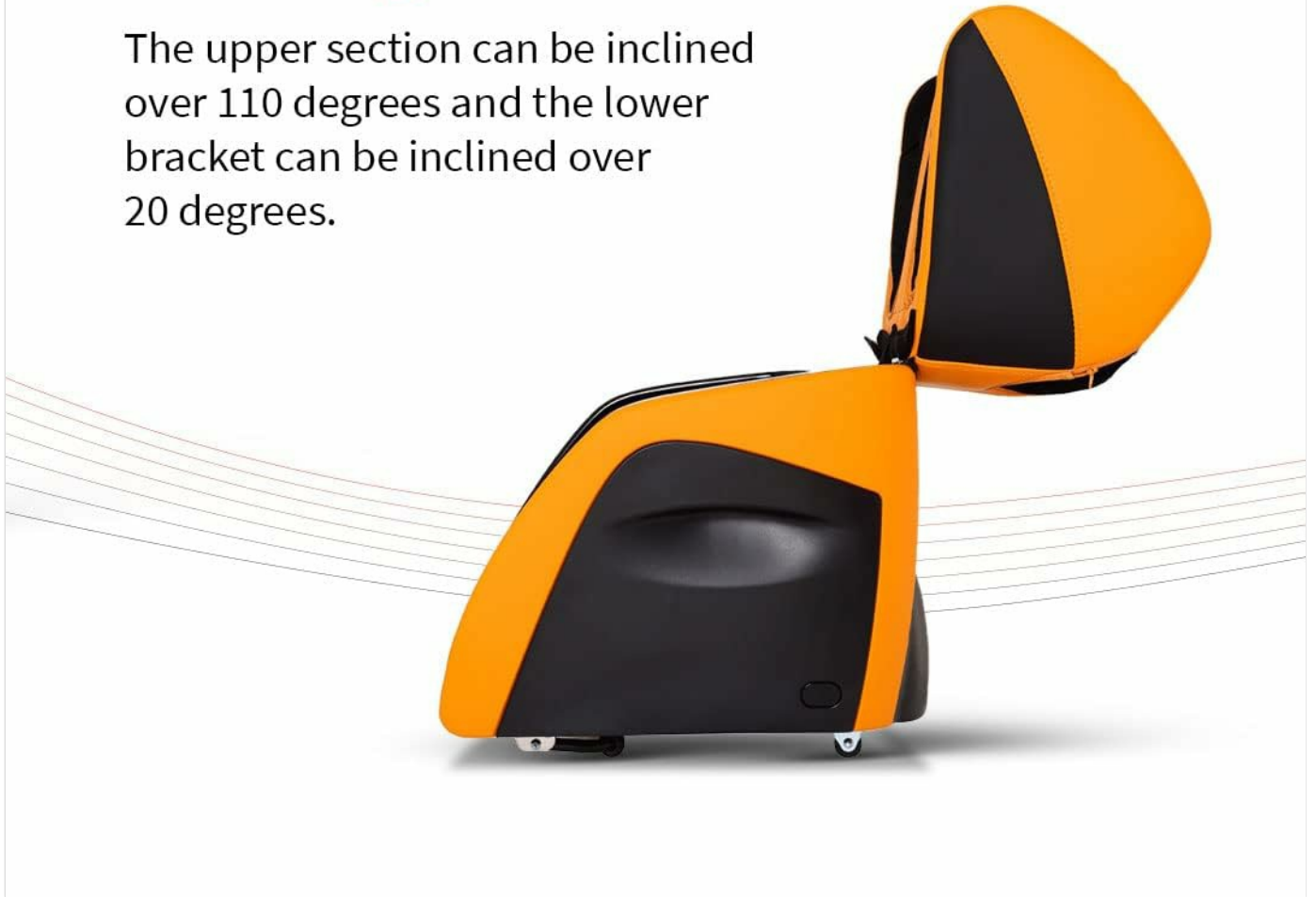
Image: The detachable foot massage unit, illustrating how the upper section can be inclined over 110 degrees and the lower bracket over 20 degrees for adjustable positioning.

The upper section can be inclined over 110 degrees and the lower bracket can be inclined over 20 degrees.