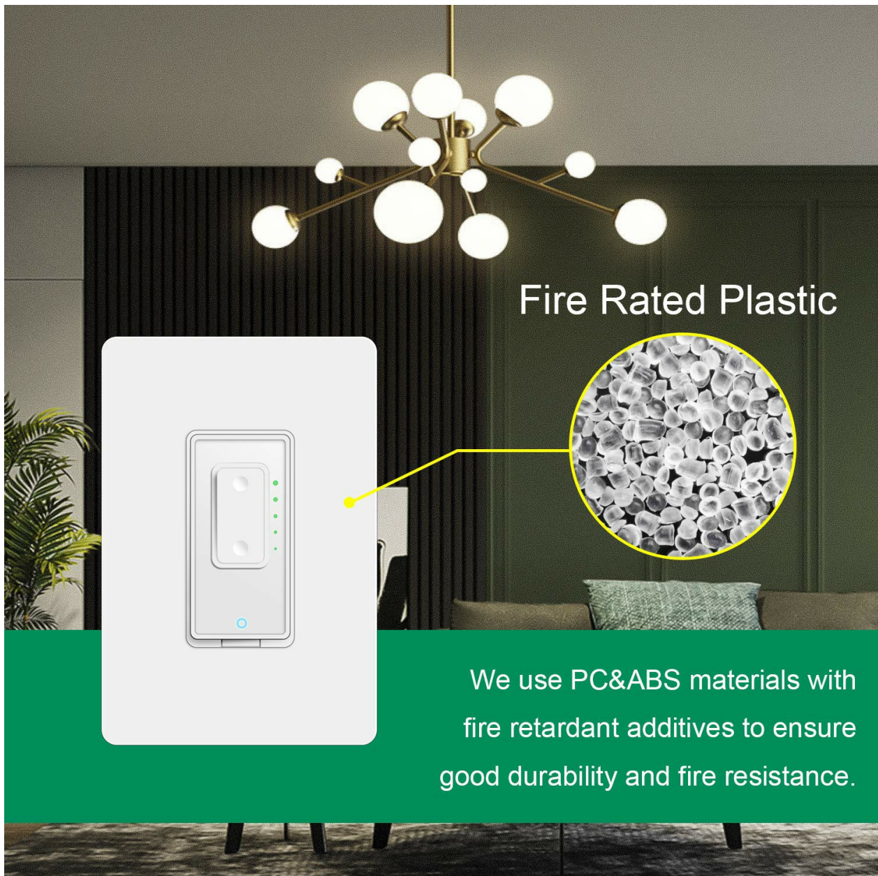
Image 2.1: Illustration highlighting the use of fire-rated PC&ABS materials for durability and fire resistance.