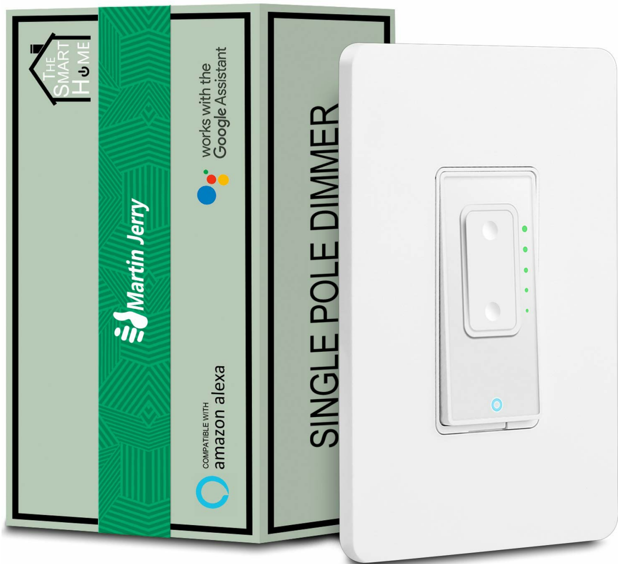
Image 1.1: Martin Jerry Smart Dimmer Switch with its packaging, highlighting compatibility with Amazon Alexa and Google Assistant.