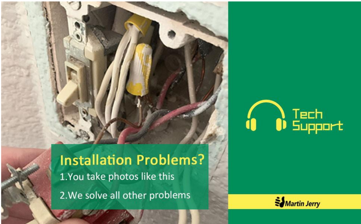
Image 6.1: Example of how to photograph wiring for technical support when encountering installation problems.