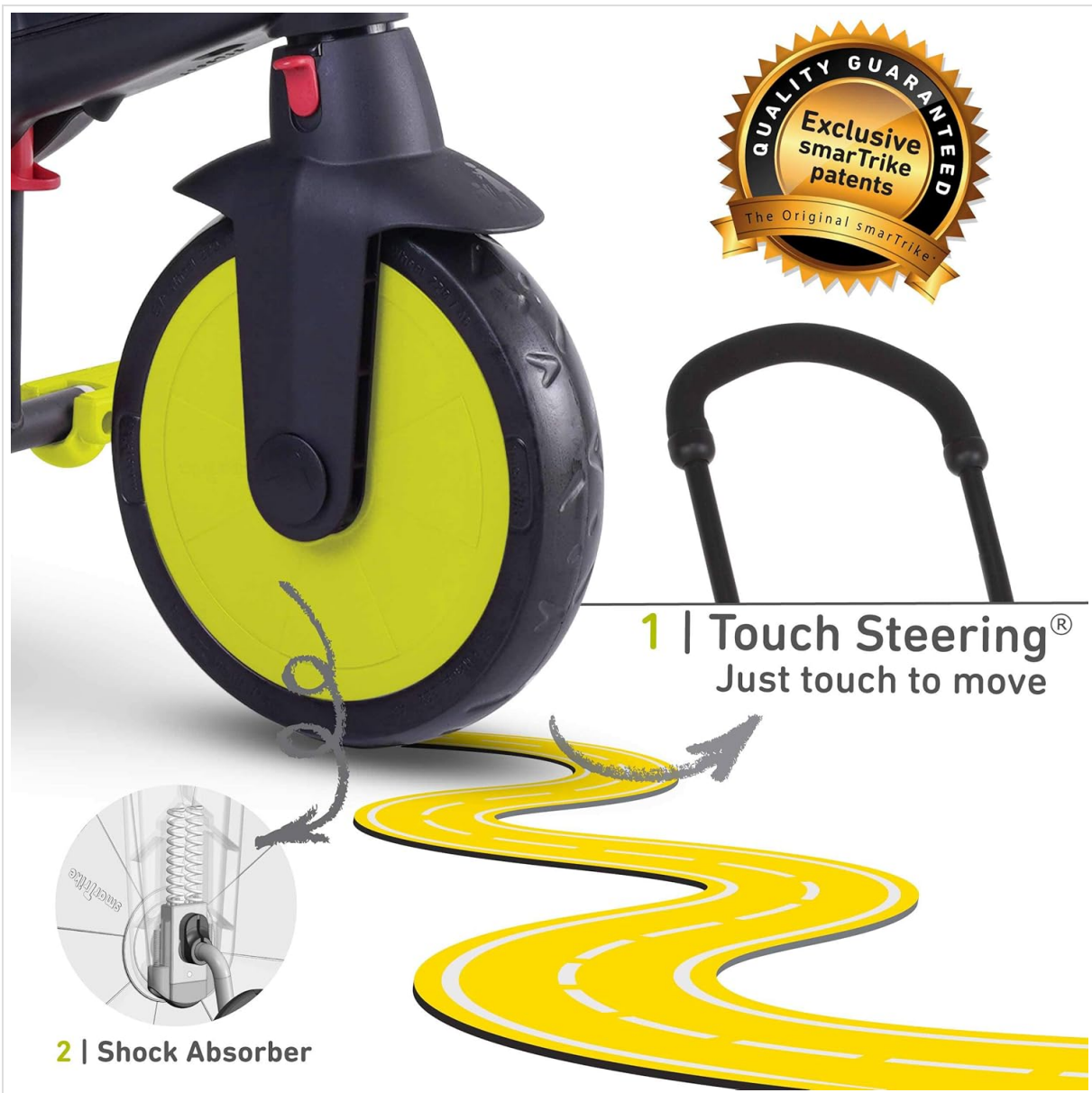
Image: A detailed view of the front wheel, highlighting the Touch Steering mechanism and the integrated shock absorber for a smoother ride.