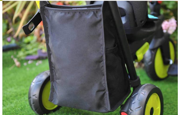
Image: A composite image illustrating the secure 3-point Y harness, the adjustable telescopic parent handle, and the practical storage bag.

Keep this large storage bag filled with all the baby essentials you need while out and about.