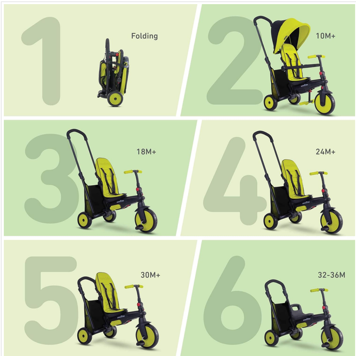
Image: A visual representation of the six developmental stages of the smarTfold 300+ tricycle, from compact folding to independent riding.