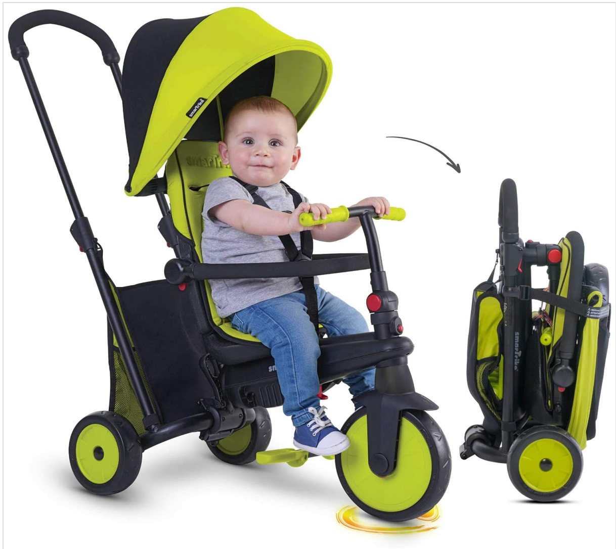
Image: A child seated in the tricycle, with an arrow indicating the compact folding capability of the smarTfold 300+.