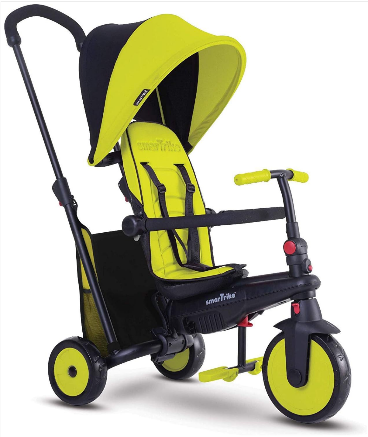
Image: The smarTrike 6 in 1 smarTfold 300+ Baby Tricycle in its full configuration, featuring a parent handle, canopy, and child seat with harness.