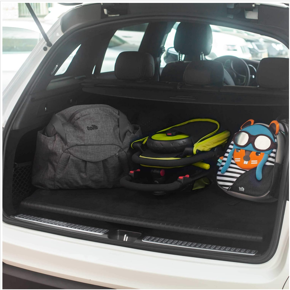
Image: The smarTfold 300+ tricycle in its compact, folded state, easily fitting into a car trunk alongside other items.