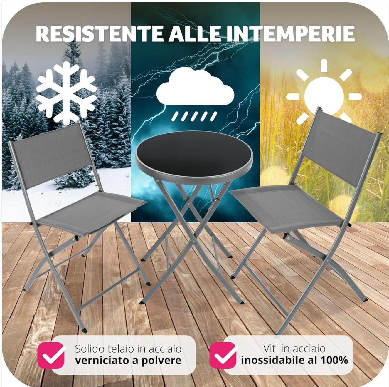
Image: The tectake balcony set depicted under snow, rain, and sun, illustrating its robust weather-resistant design and materials.