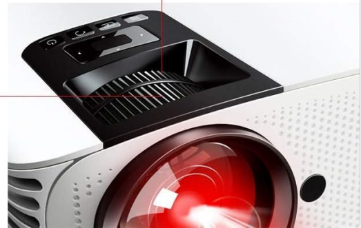
Image: Diagram illustrating how keystone correction and manual focus adjustment correct image distortion and clarity.