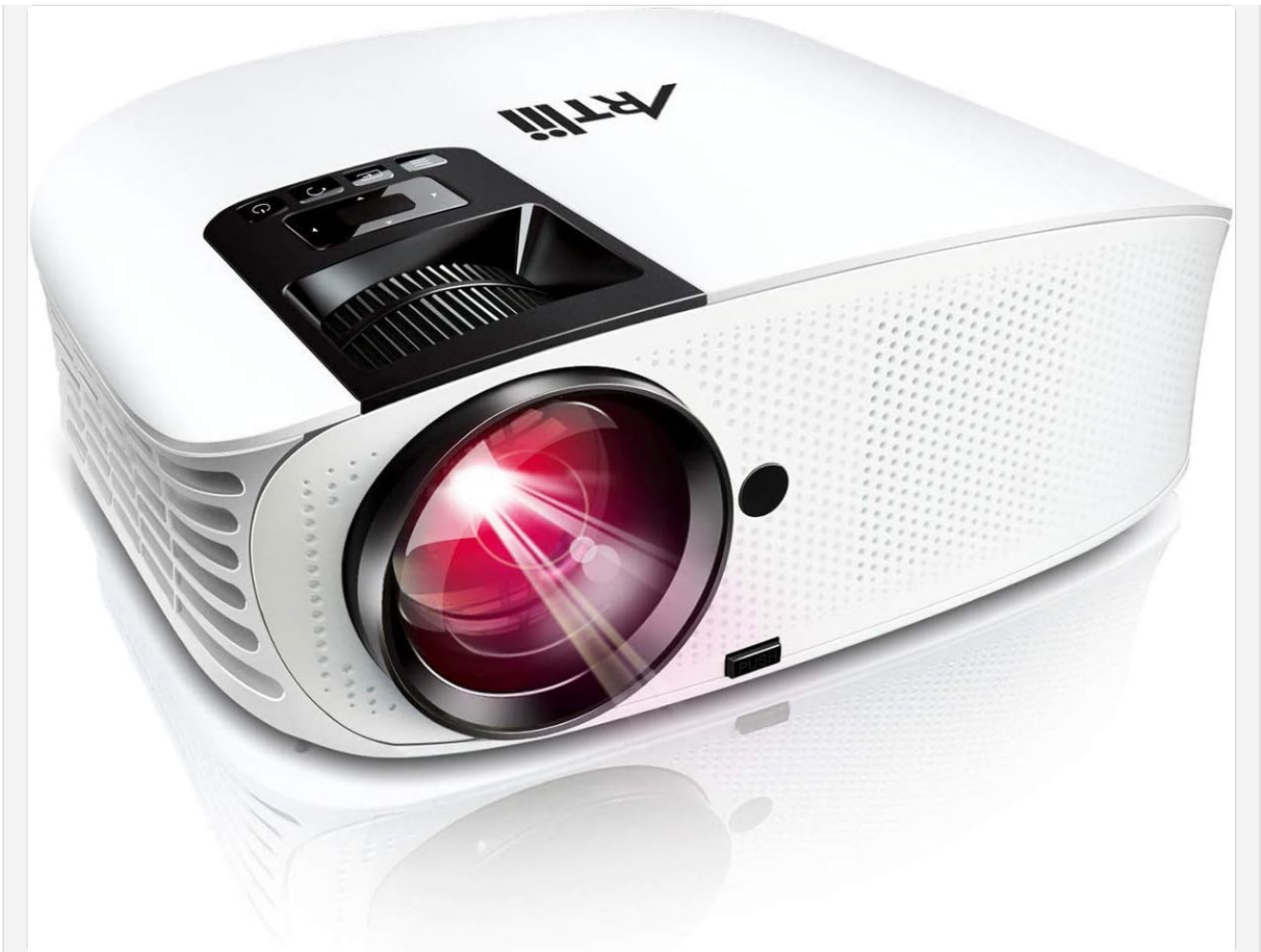
Image: Front view of the ARTlii HD Projector, showcasing its lens and sleek white design.