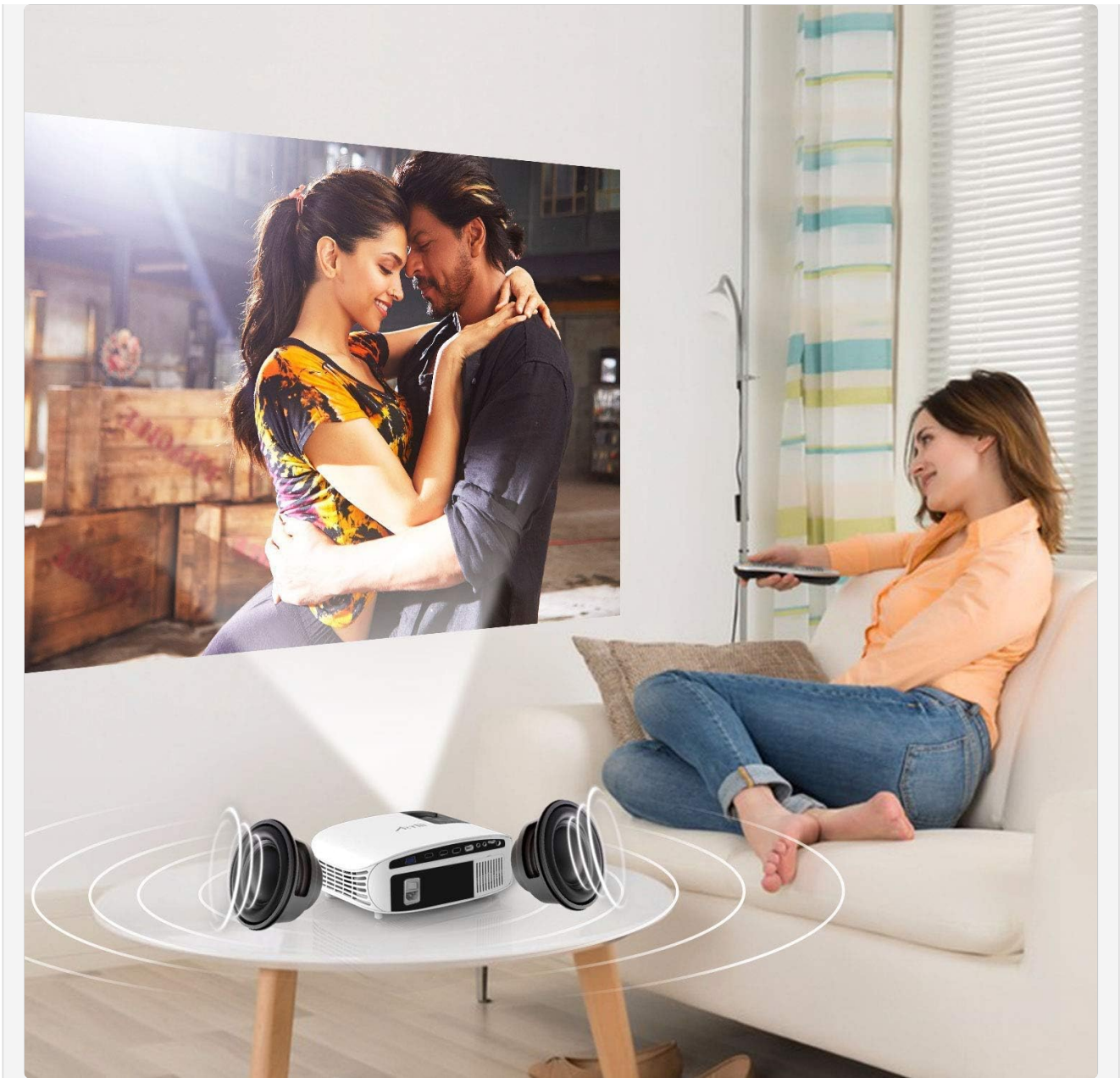
Image: Illustration showing the projector emitting sound waves, highlighting its HiFi stereo audio capabilities.