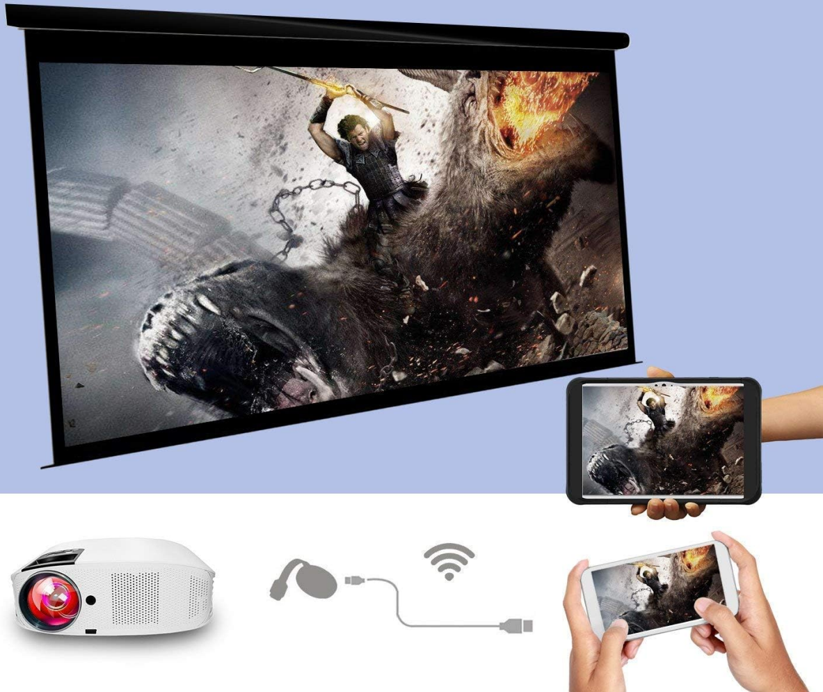
Image: Diagram showing a projector connecting to a smartphone or tablet via a Wi-Fi display dongle.

Need a wifi display dongle( Not included)