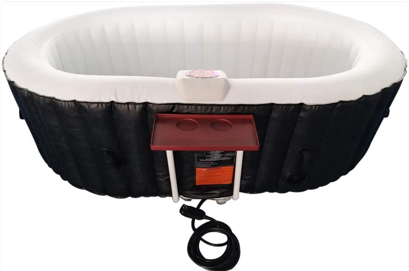
Figure 1: ALEKO Inflatable Hot Tub Spa (Oval, Black & White)

The ALEKO Inflatable Hot Tub Spa provides a personal, high-powered jetted bubble experience for relaxation and well-being. This 145-gallon, 2-person oval hot tub features a durable design and user-friendly controls.