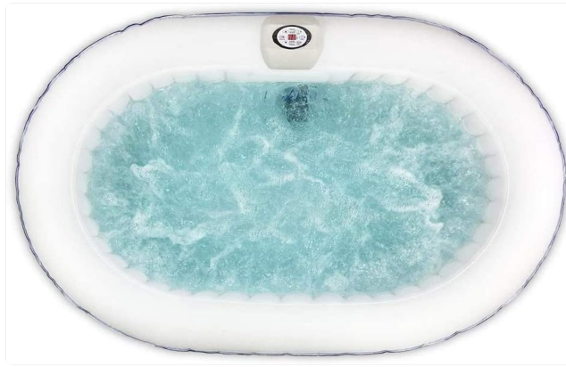
Figure 6: Digital Control Panel for easy operation.