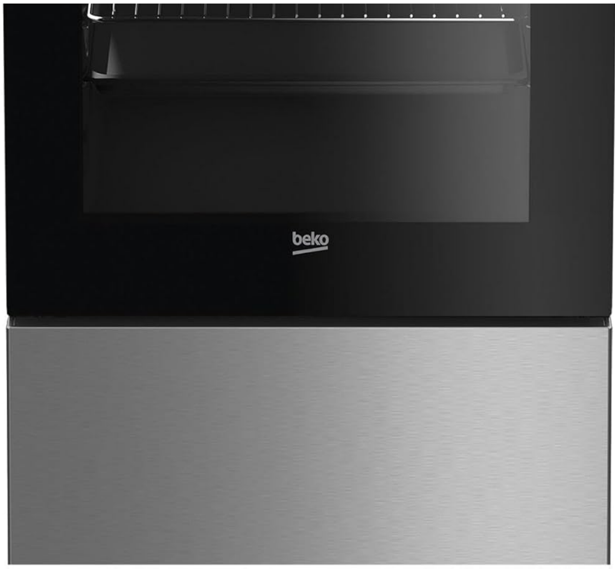
Figure 2.3: View of the oven interior with racks. The oven cavity includes multiple shelf positions and a removable wire rack for cooking.