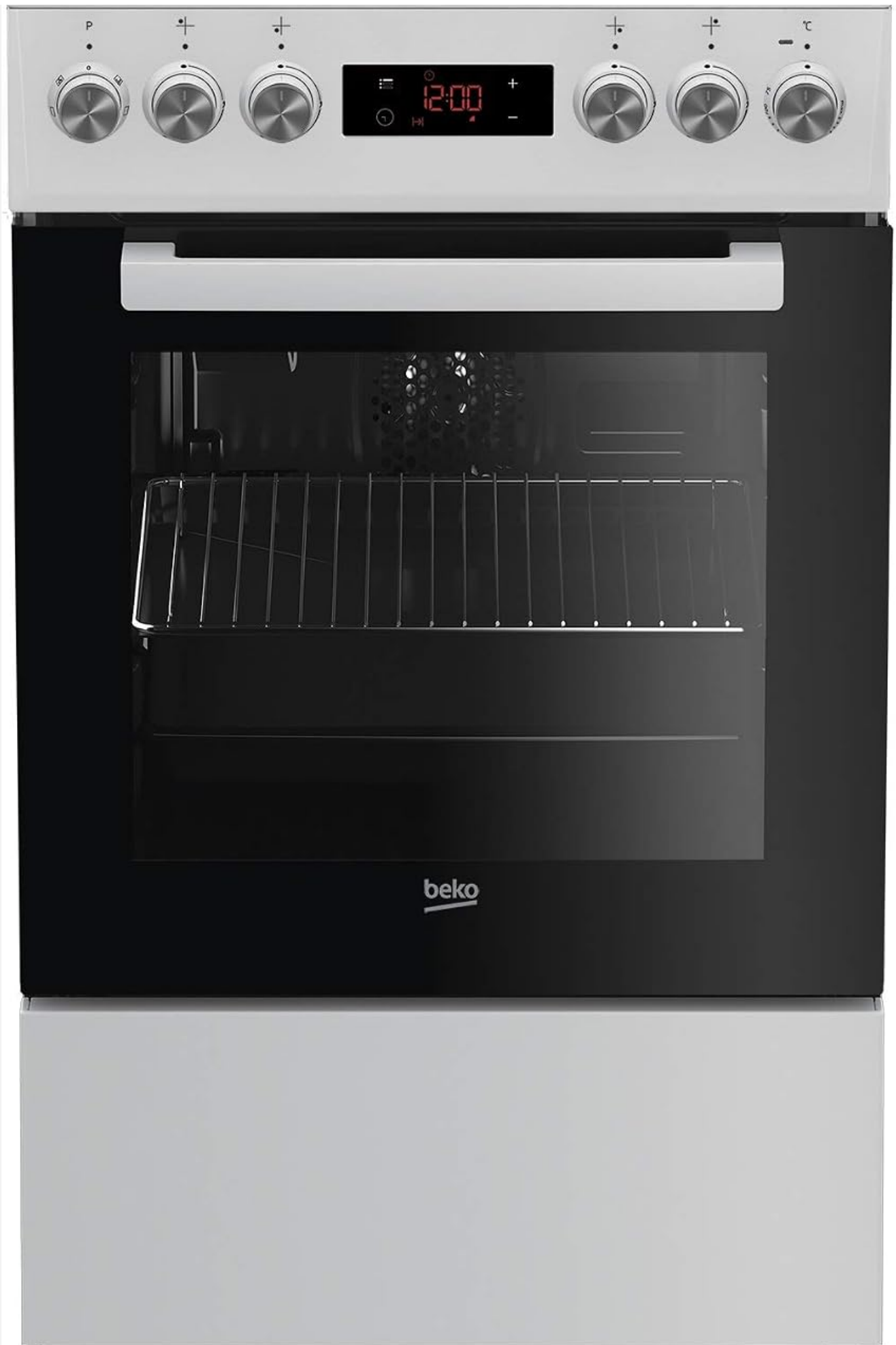
Figure 2.1: Front view of the Beko FSE52320DWD Freestanding Gas Cooker. This image displays the appliance's white exterior, the black glass oven door with a handle, and the four gas burners on the hob. Control knobs are visible on the front panel above the