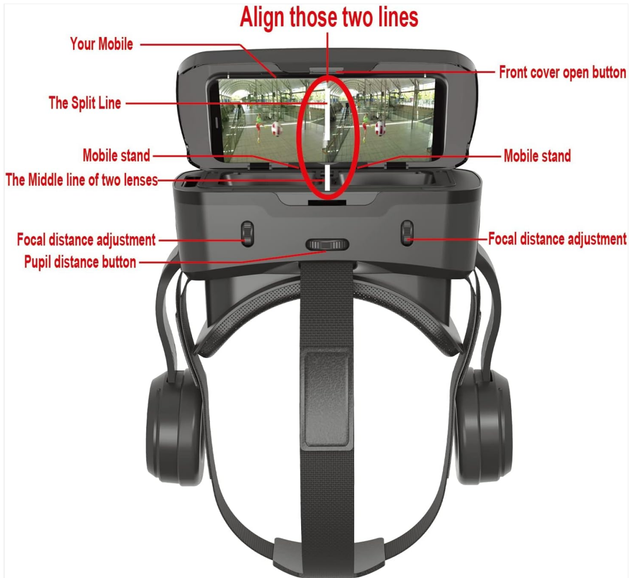
Image 2.1: Labeled diagram of the VR EMPIRE VR Headset V10.0, highlighting key components and smartphone placement.