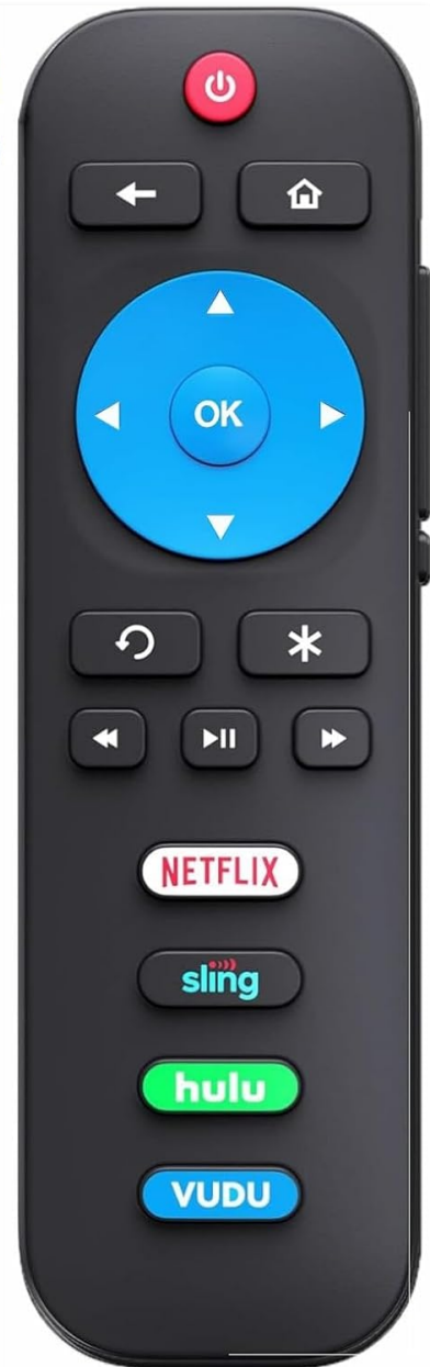
Image 4: The remote control in use with a TCL Roku TV, highlighting the app shortcut buttons.