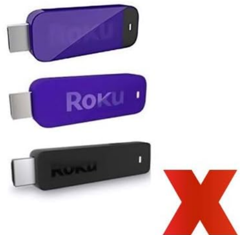
Image 5: Visual representation of compatible Roku TVs versus incompatible Roku devices.