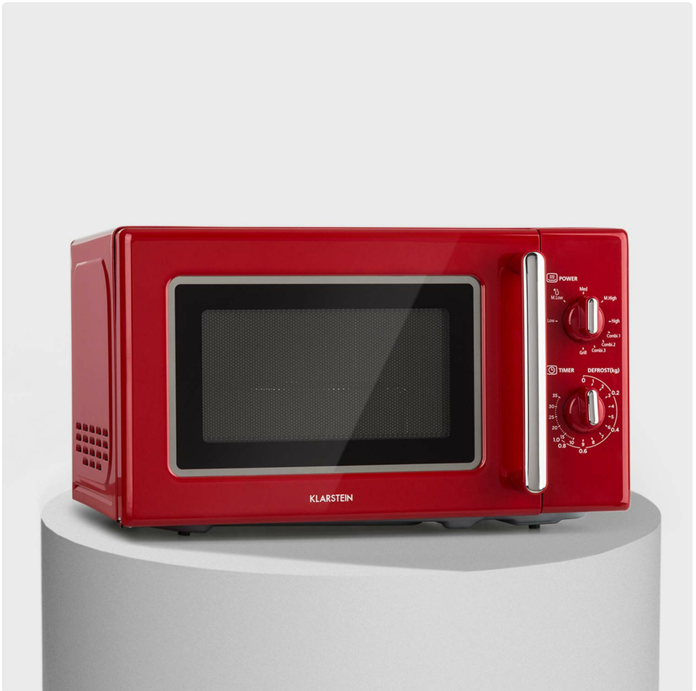
Figure 3.1: Front view of the Klarstein Caroline Freestanding Microwave Oven in red, showcasing its retro design and control panel.