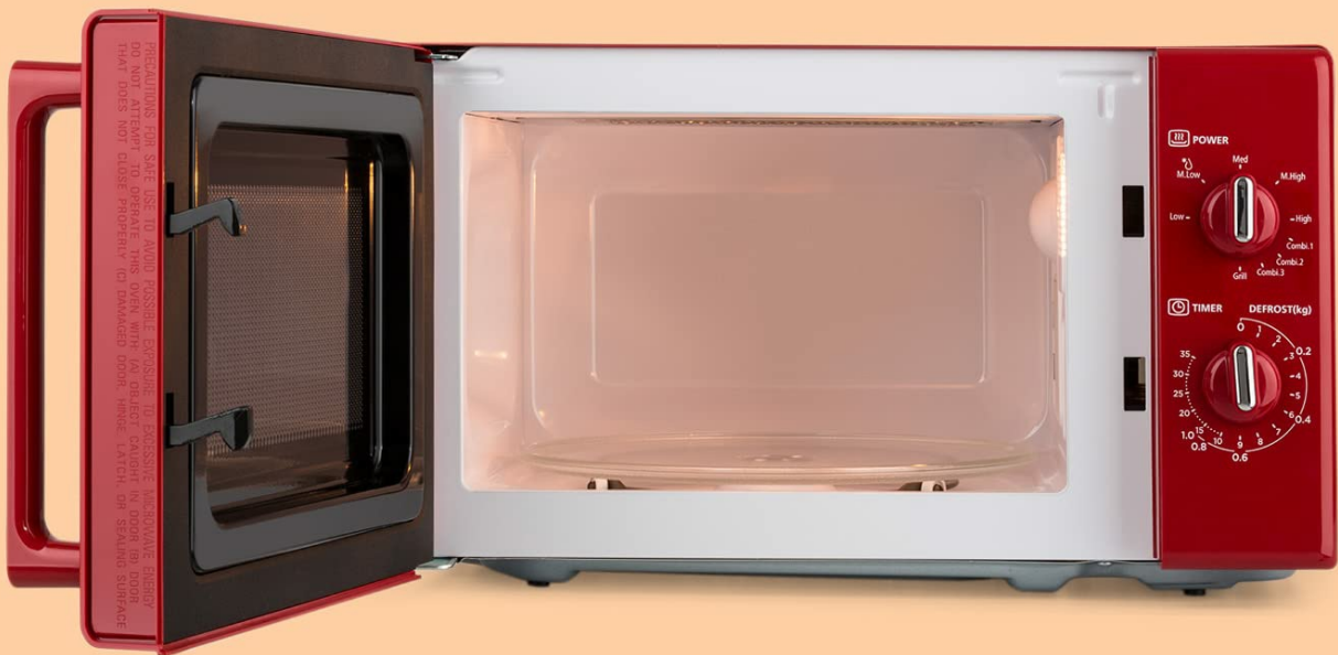
Figure 3.3: Interior view of the microwave oven, highlighting its 20-liter capacity and the Ø 25.7 cm glass turntable, providing ample space for dishes.