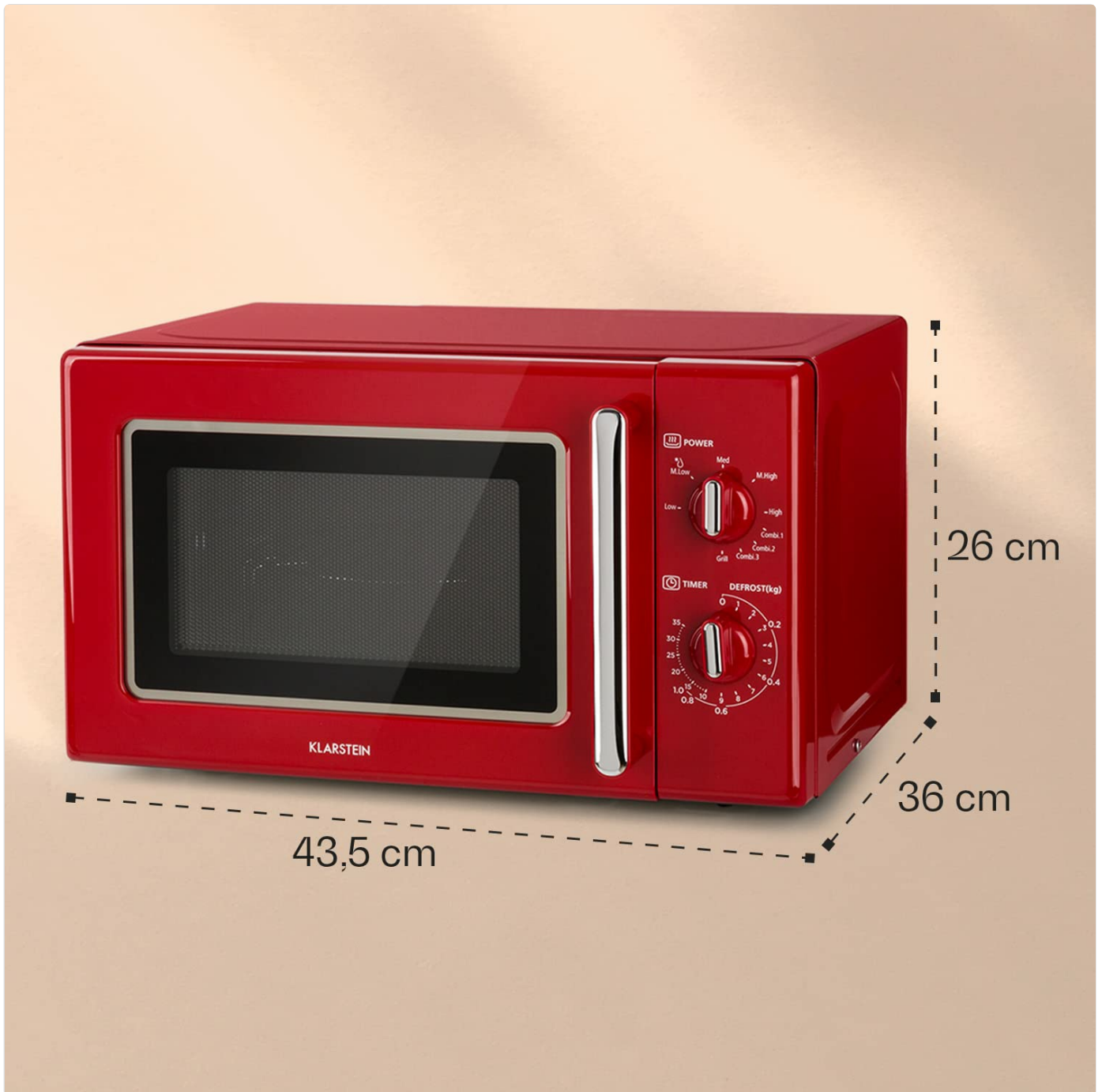
Figure 3.6: Diagram illustrating the external dimensions of the microwave oven: approximately 43.5 cm (L) x 26 cm (H) x 36 cm (D).