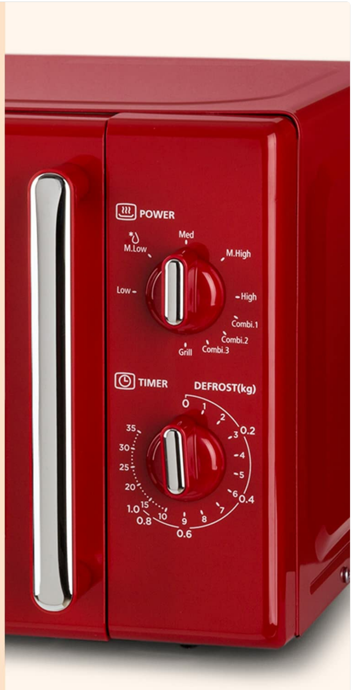
Figure 3.4: Close-up of the control panel, demonstrating the QuickSelect technology with two intuitive rotary knobs for power and timer/defrost settings.