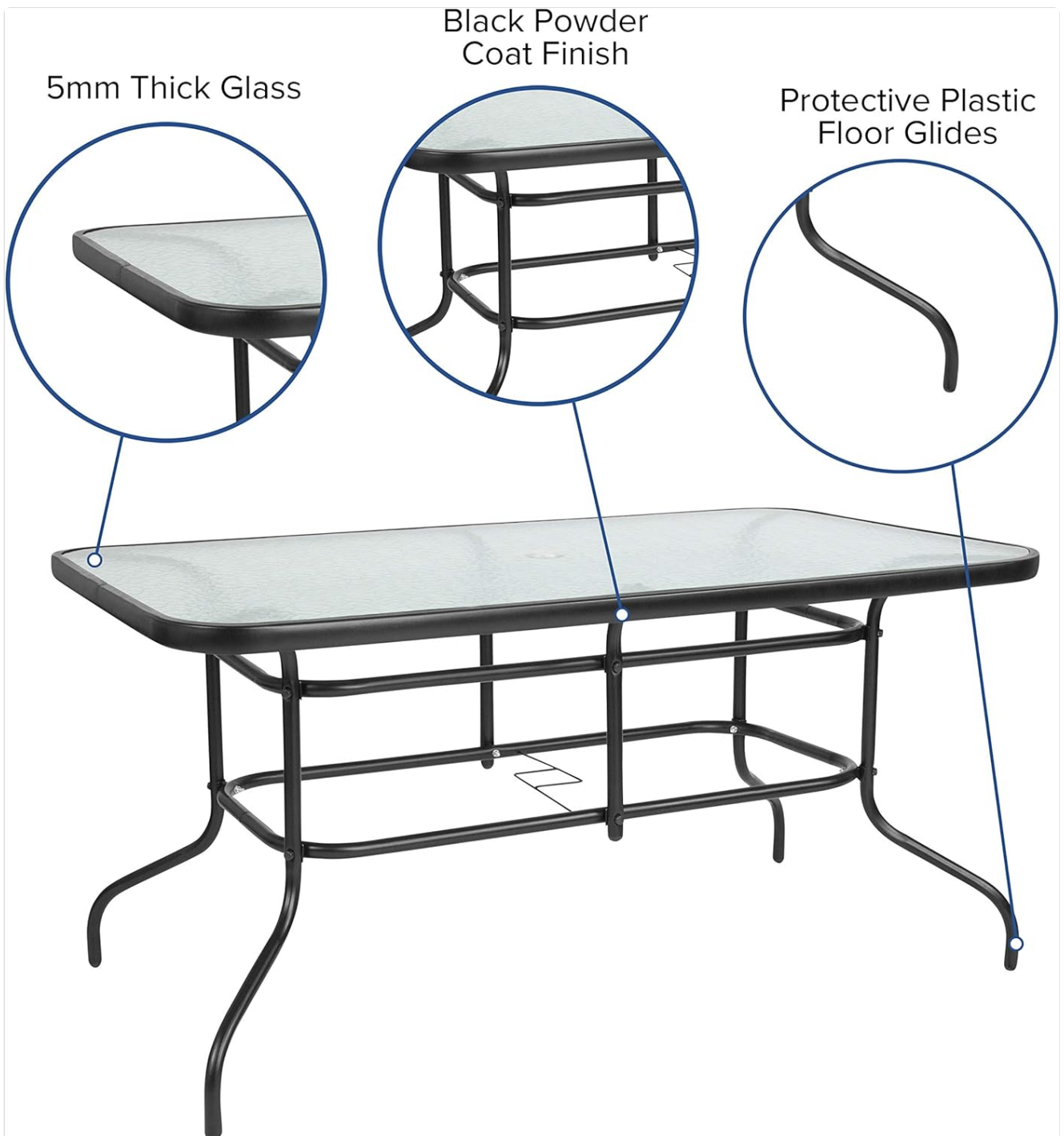
Figure 4.1: Key features of the table, including the 5mm thick tempered glass, black powder coat finish, and protective plastic floor glides.