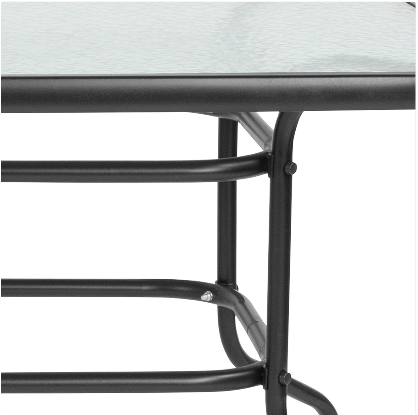
Figure 4.2: Detail of the frame connection, showing where legs attach.