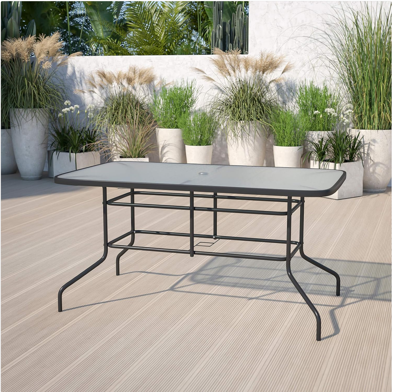
Figure 4.4: The assembled table ready for use in an outdoor environment.