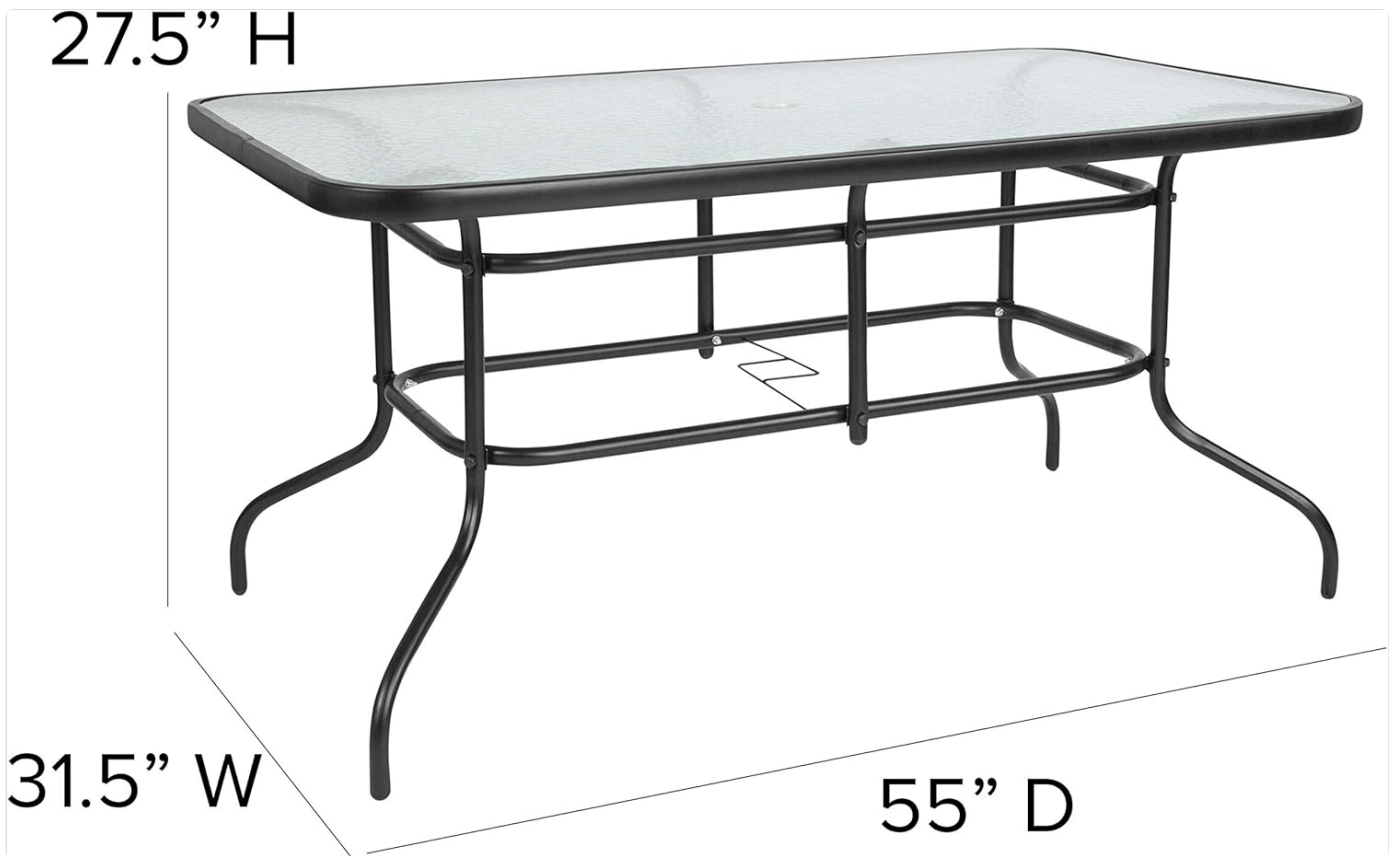
Figure 8.1: Key dimensions of the Flash Furniture Tory Table.