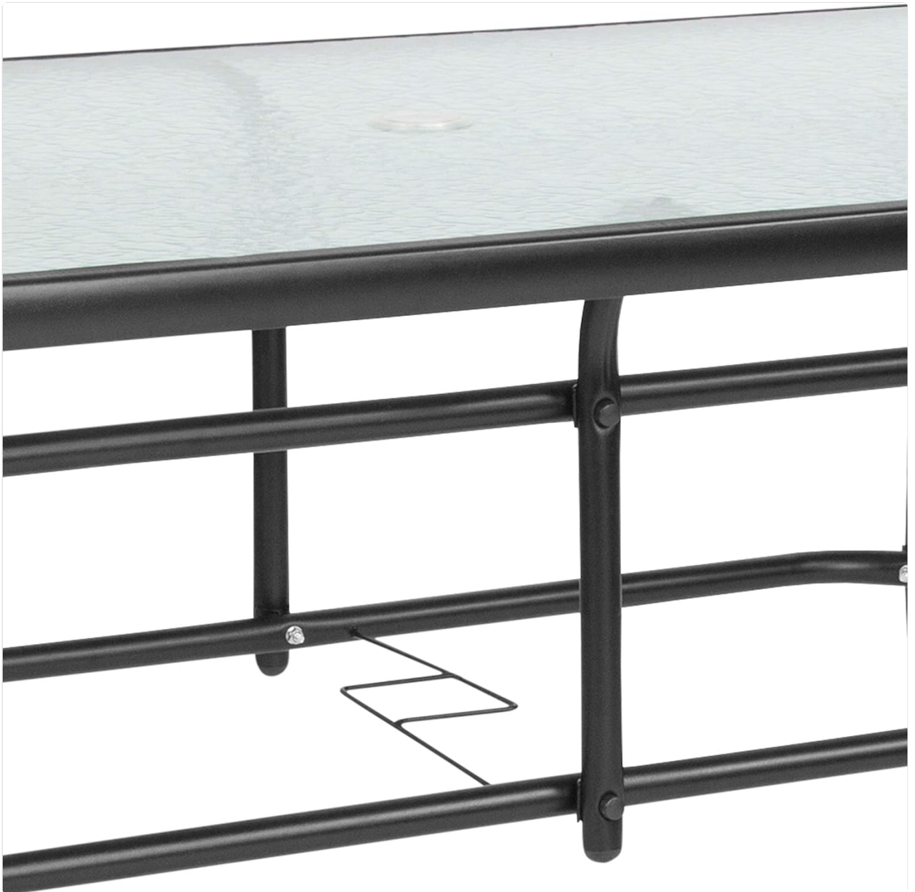
Figure 5.1: The central umbrella hole, designed for standard patio umbrellas.