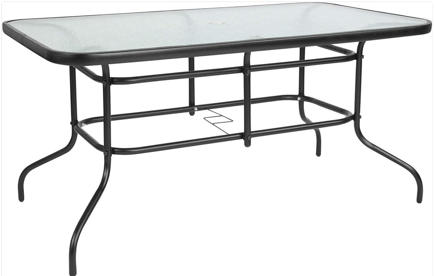
Figure 1.1: The Flash Furniture Tory Rectangular Tempered Glass Table, showcasing its clear tempered glass top and black metal frame.

This manual provides essential information for the safe and proper assembly, operation, and maintenance of your Flash Furniture Tory Rectangular Tempered Glass Table. Designed for both indoor and outdoor use, this table features a durable tempered glass top and a sturdy metal frame, complete with an umbrella hole for added versatility. Please read this manual thoroughly before assembly and retain it for future reference.