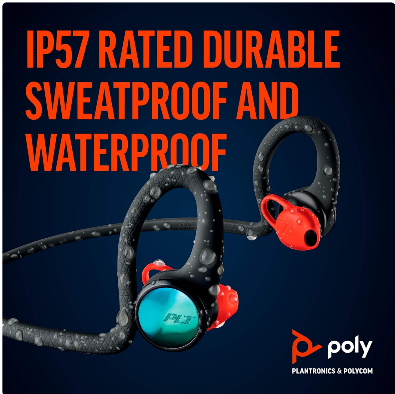
Image: The headphones shown with water droplets, emphasizing their IP57 rating for sweat and water resistance.

The BackBeat FIT 2100 headphones are IP57 rated, making them durable, sweatproof, and waterproof. This protection safeguards the earphones from sweat, rain, and spills, allowing them to withstand rigorous workouts. After exposure to water or heavy sweat, ensure the charging port is dry before charging.