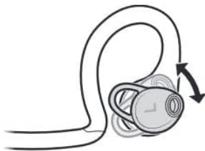
Image: Diagram illustrating the correct way to wear the BackBeat FIT 2100 headphones, with the band draped behind the head.

Rotate the eartip between a plus and minus 20° range to achieve an optimal fit and sound experience. This adjustment helps ensure the earbud sits correctly in your ear without blocking the ear canal entirely, thanks to the Always Aware design.