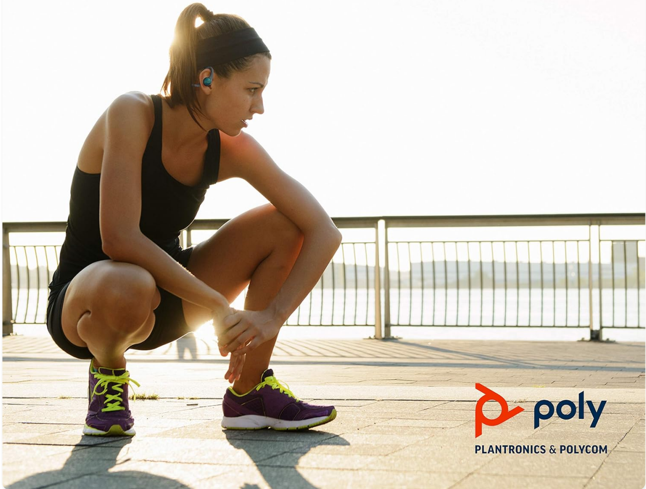
Image: A person exercising outdoors, demonstrating the wireless range and freedom of movement provided by the headphones.