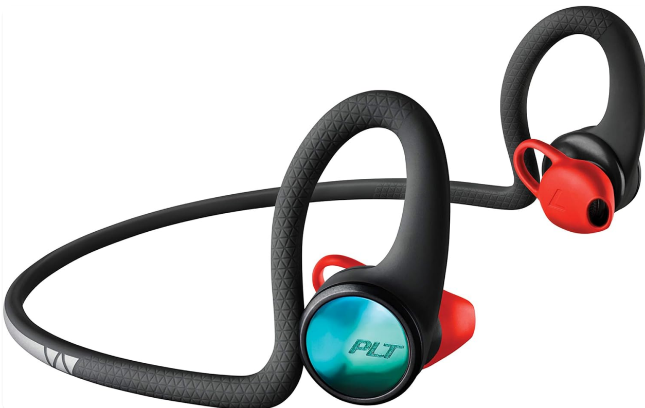
Image: Plantronics BackBeat FIT 2100 Wireless Headphones, showcasing their sleek design and earloop

The Plantronics BackBeat FIT 2100 wireless sport earbuds are designed for outdoor use, offering a rugged and ultra-stable experience. They feature Always Aware ear tips, which allow users to hear their surroundings for enhanced safety during training. Constructed with waterproof and sweatproof materials, these earbuds provide a secure fit with earloops that remain stable during rigorous exercise. Their lightweight design ensures comfort, and with up to seven hours of wireless listening, they are suitable for extended workout sessions.