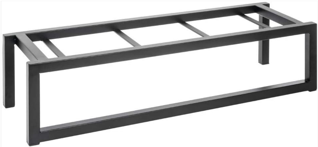
Figure 2: Angled view of the HUBERT Rectangular Display Riser, ready for placement.

adequately support the weight of the riser and any items placed upon it. Avoid placing the riser on uneven surfaces to prevent instability.