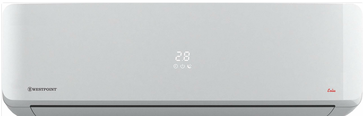
Image 1: Westpoint Split AC system showing the indoor unit, outdoor unit, and remote control.

The Westpoint Split AC WST-1221.L consists of an indoor unit, an outdoor unit, and a remote control for convenient operation. This system is designed to provide efficient cooling for your space.