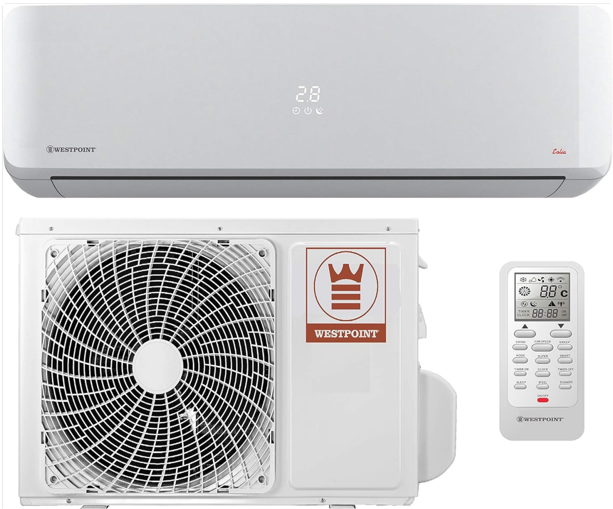
Image 2: Close-up view of the Westpoint Split AC outdoor unit, highlighting its robust design.